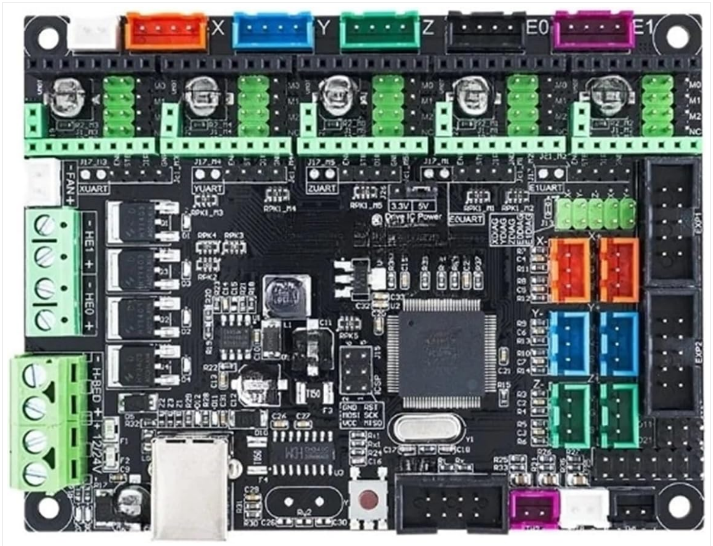
Figure 3.1: Top view of the MKS Gen_L 2.1 control board, showing main chip, stepper driver slots, and various connectors (X, Y, Z, E0, E1 motor outputs, fan, heater, and endstop connections).

Below are images illustrating the various components and connection points on the MKS Gen_L 2.1 board.