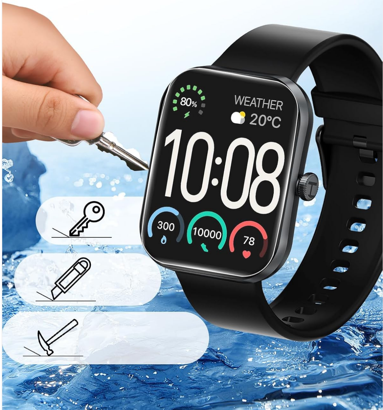
Image: Illustration of scratch-proof protection.

Protect the screen to prevent metal scratches such as keys