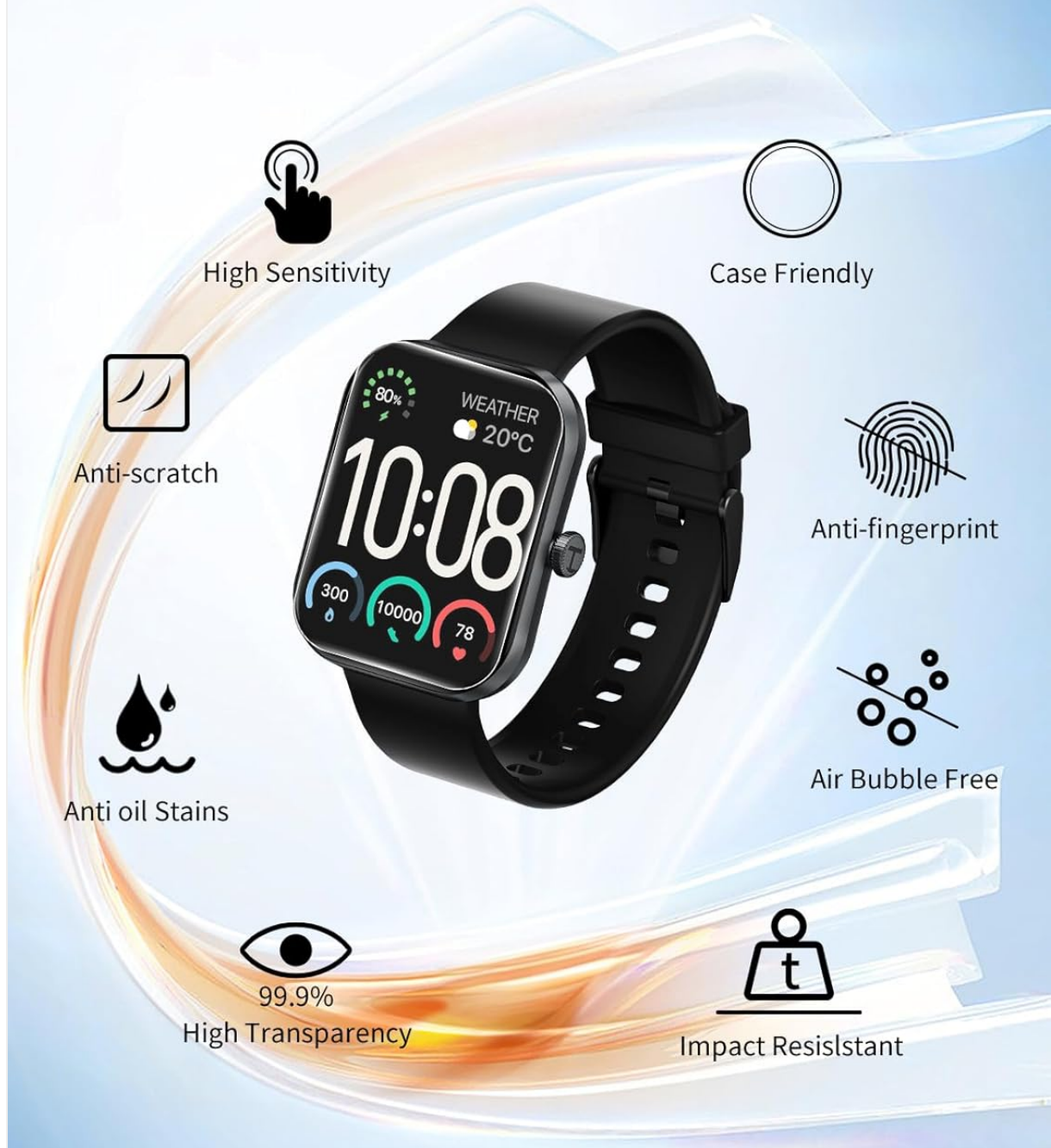
Image: Overview of screen protector features.