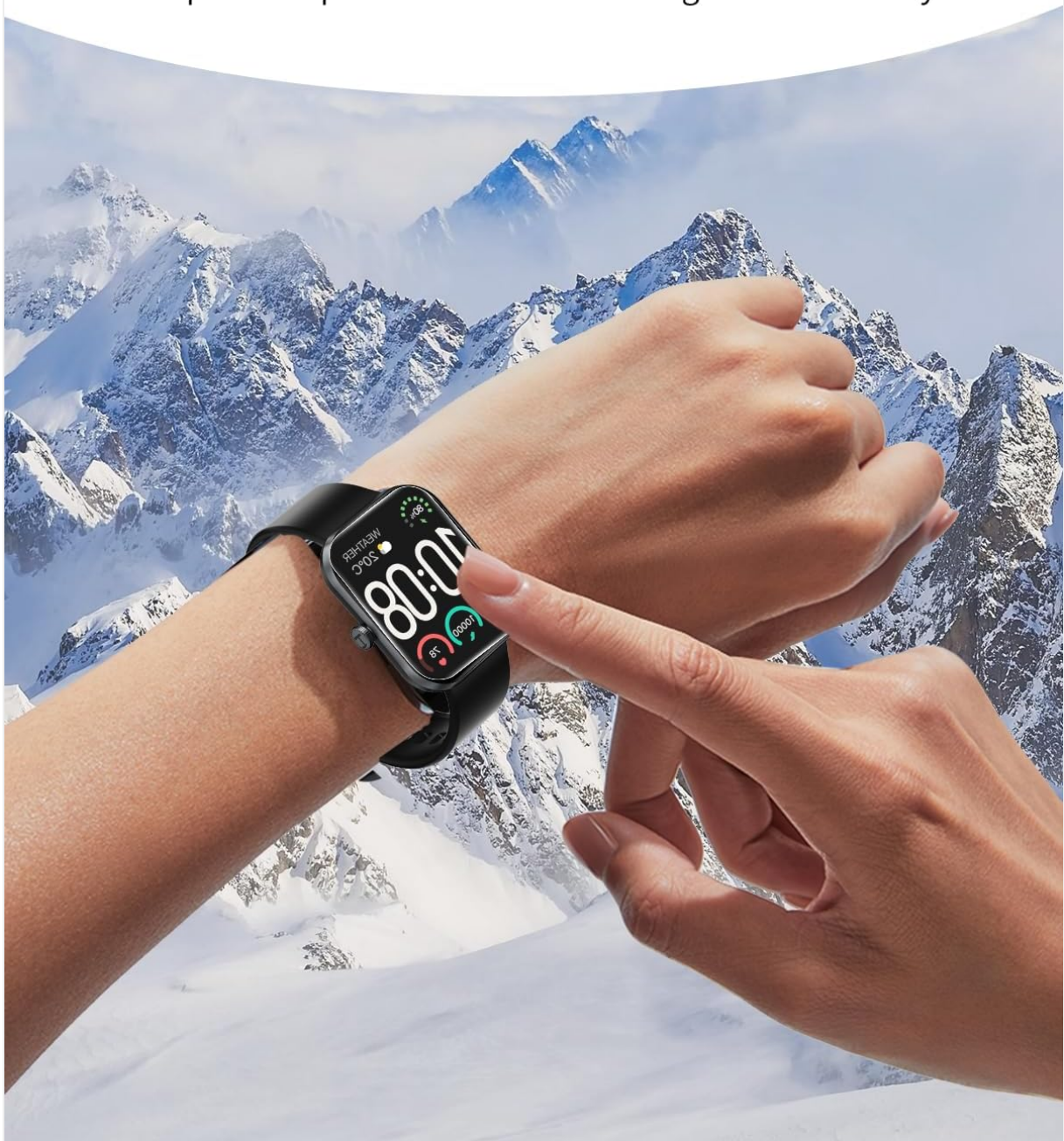
Image: Demonstration of high touch sensitivity.

The protector provides a clear view and high touch sensitivity