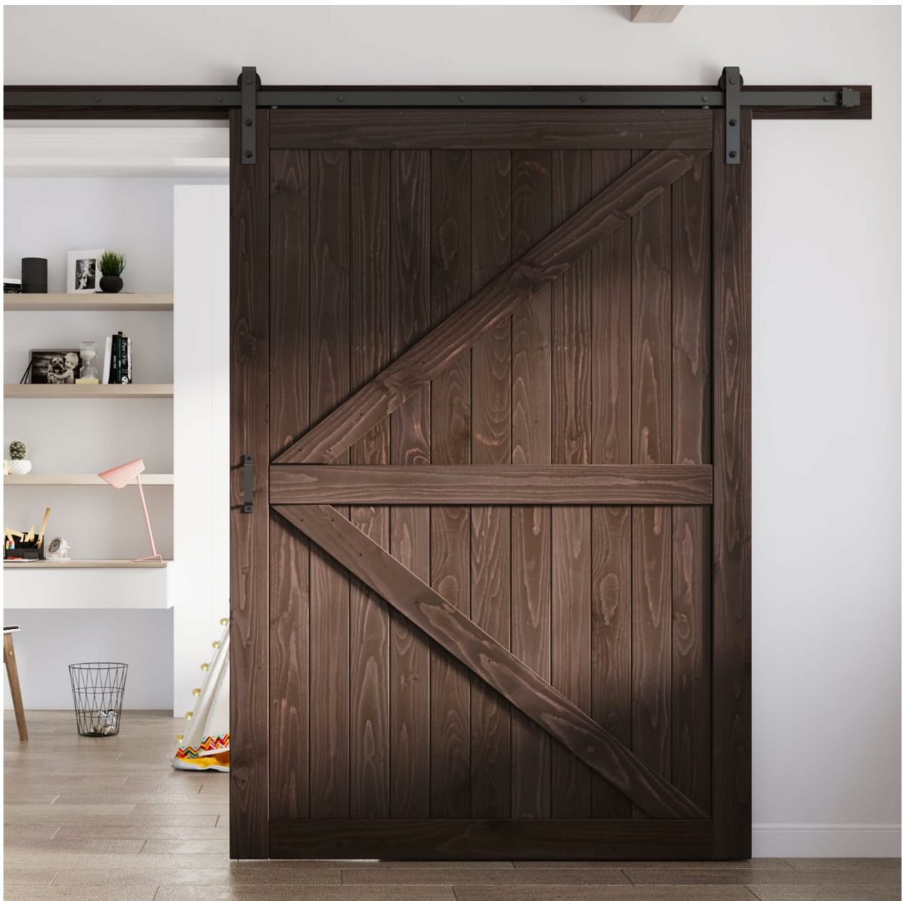
Figure 1: FREDBECK 60x84 Brown K-Frame Barn Door