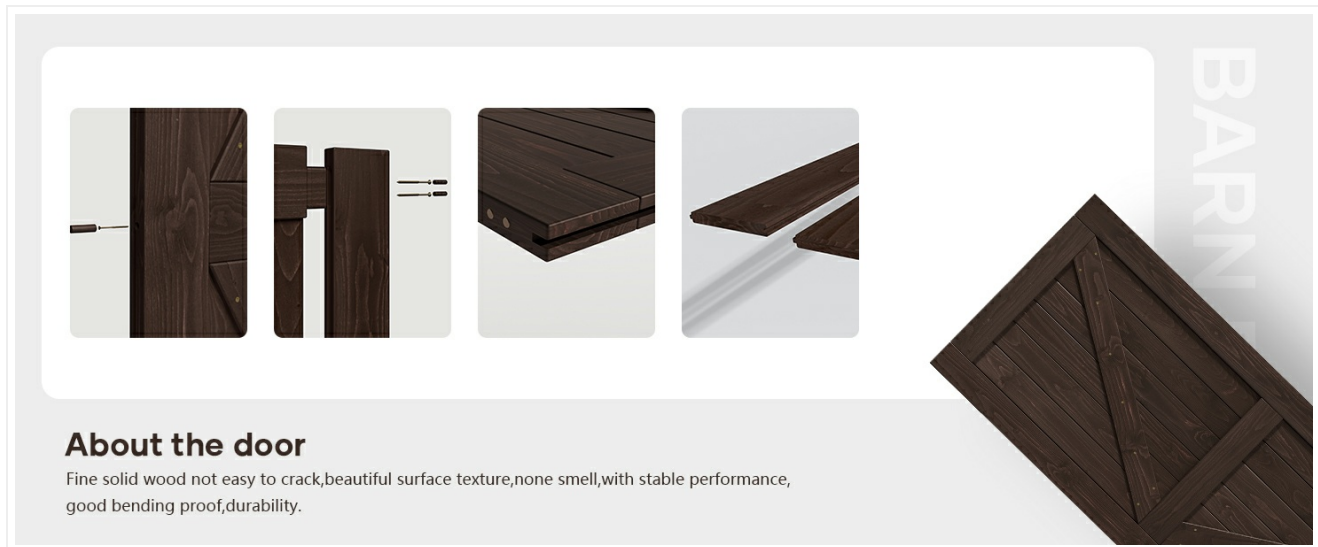
Figure 3: Spruce Wood Characteristics