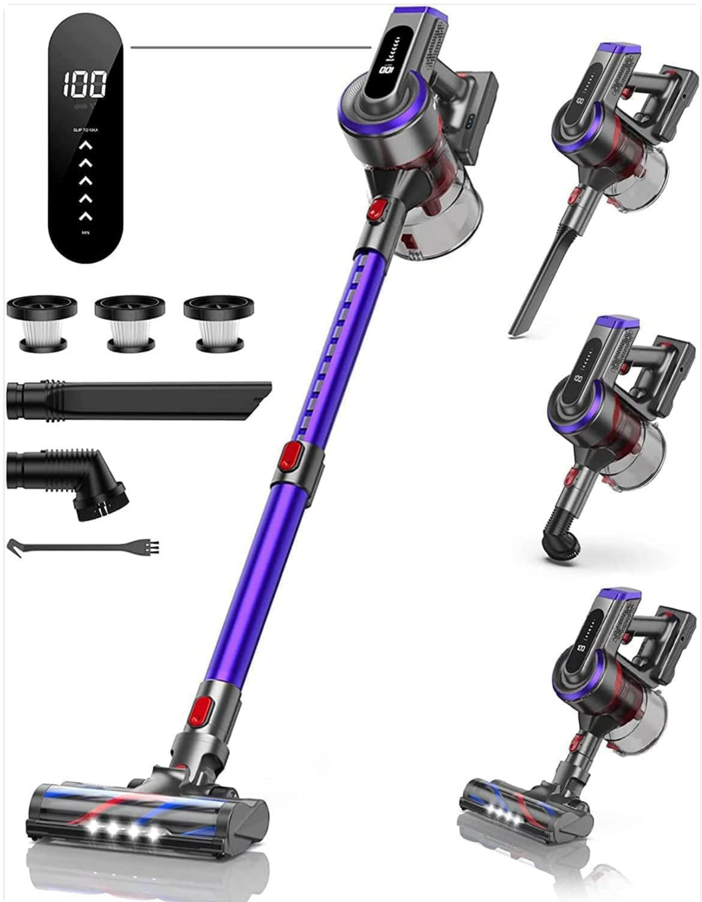
Image: The BuTure VAC Cordless Vacuum Cleaner main unit, along with various attachments including the electric floor brush, round brush, crevice brush, adjustable tube, wall mount bracket, and cleaning tool. Two HEPA filters and the charger are also shown.