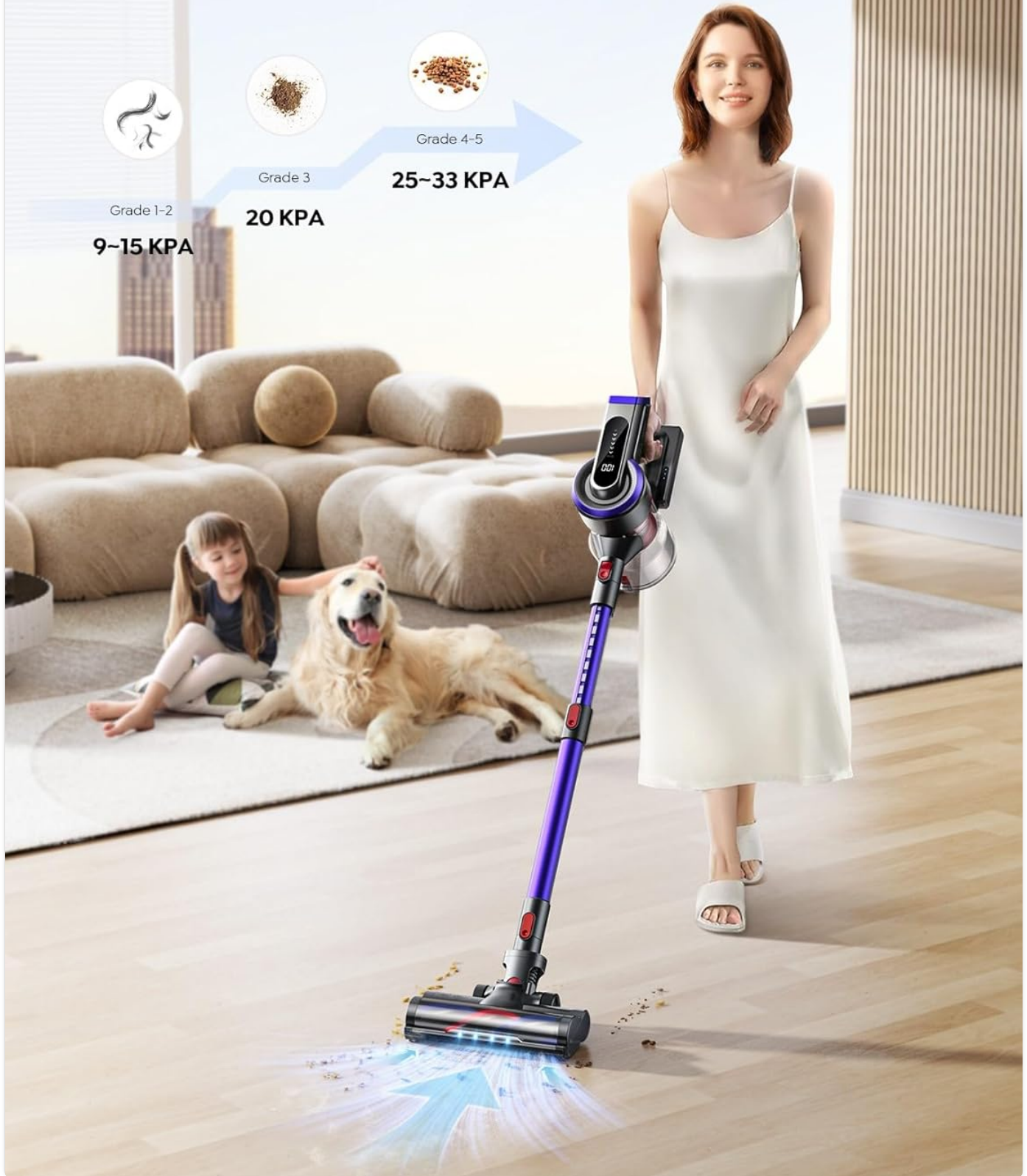
Image: A woman operating the BuTure VAC JR400 cordless vacuum cleaner on a hard floor, illustrating its strong suction capability by picking up various debris. A small child and a dog are in the background, indicating a home environment.