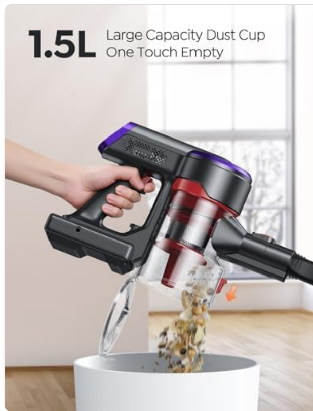
Image: A hand demonstrating the one-touch emptying mechanism of the vacuum's 1.5L large capacity dust cup, showing collected debris falling into a waste bin.