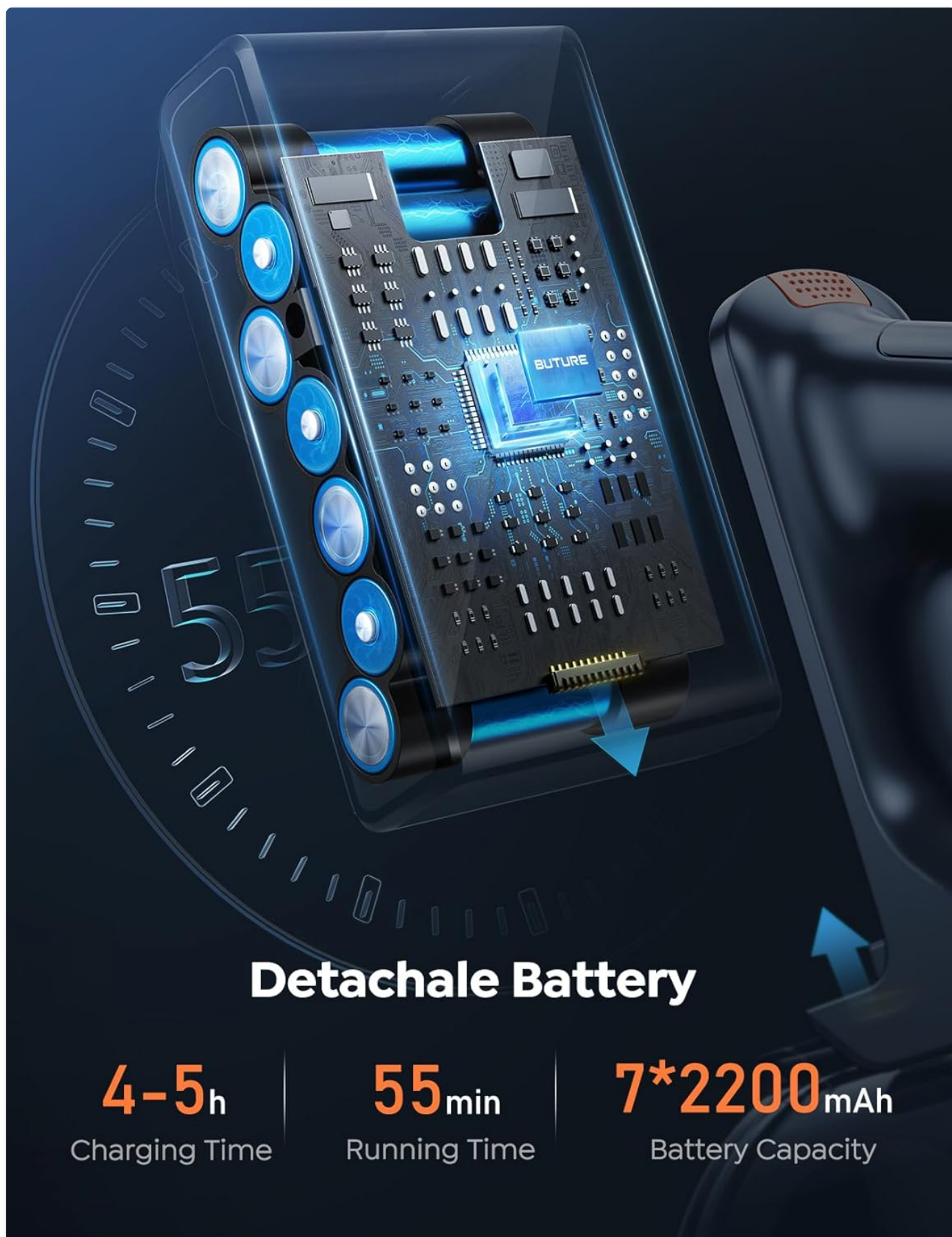
Image: An internal view illustration of the vacuum's detachable battery pack, highlighting its 7*2200mAh cells, charging time of 4-5 hours, and a running time of up to 55 minutes.