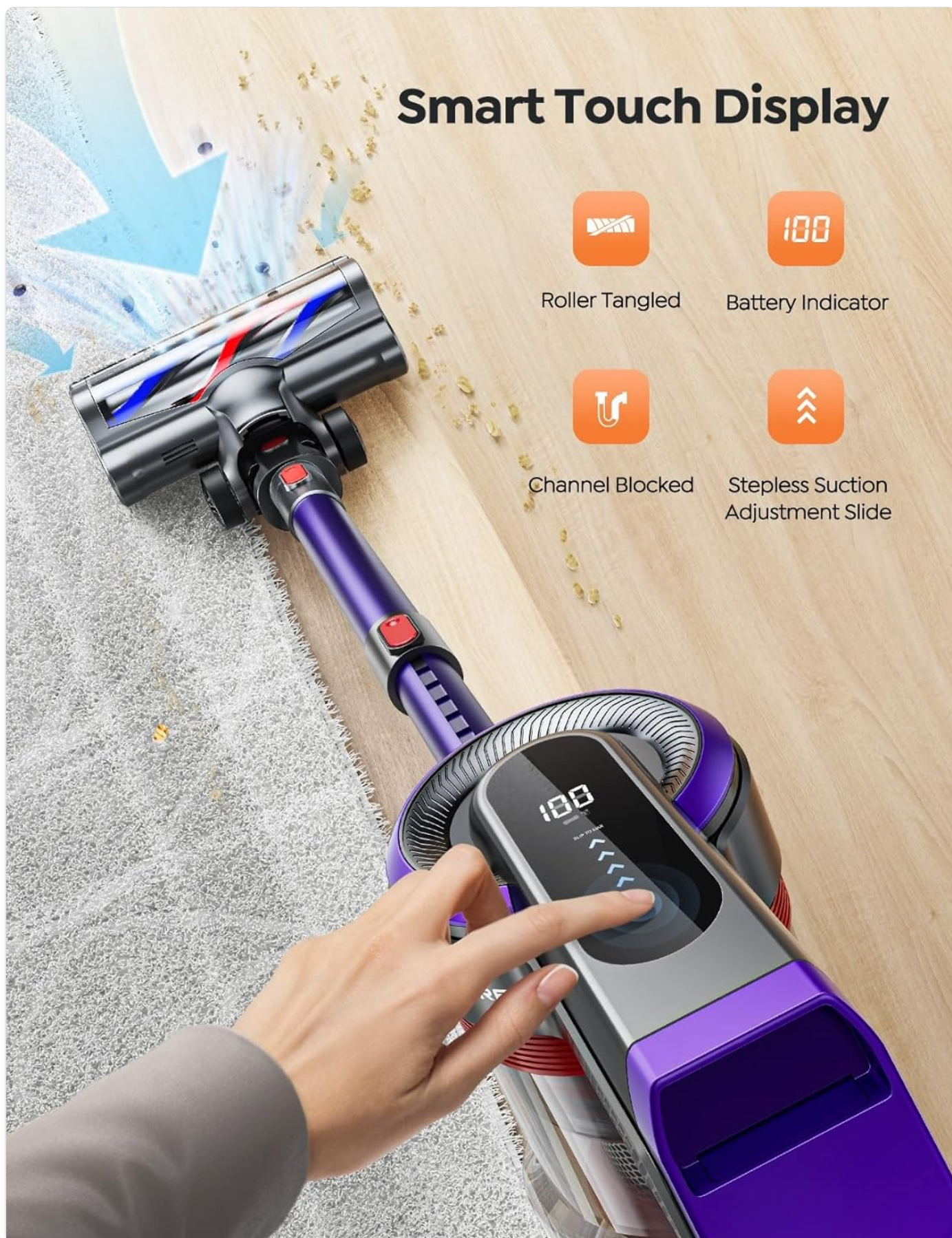
Image: A hand interacting with the smart touch display on the vacuum cleaner's main body. The screen shows battery indicator, roller tangled warning, channel blocked warning, and a stepless suction adjustment slide.