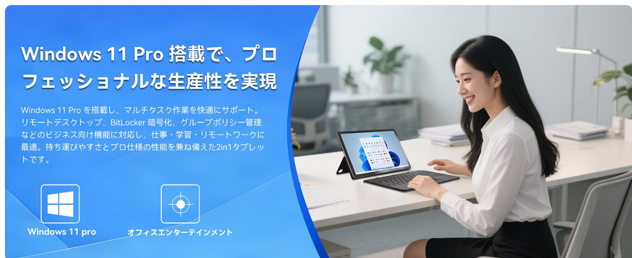
Figure 10: The Windows 11 Pro operating system, optimized for productivity and security.

The device comes pre-installed with Windows 11 Pro, offering enhanced security and productivity features. This includes Snap Layouts for efficient multitasking, TPM 2.0 with automatic encryption for robust defense, and WSL2 compatibility for running Linux and Windows apps concurrently.