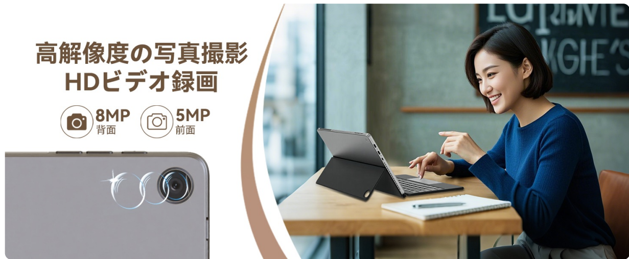
Figure 9: Dual cameras (5MP front, 8MP rear) for clear photos and video calls.

The NewBook 11 features a 5MP front camera and an 8MP rear camera, providing clear image quality for online meetings, document scanning, and casual photography. Features like distortion correction and noise suppression enhance usability.