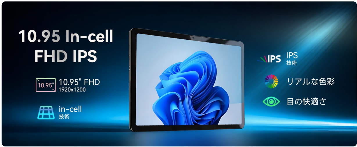
Figure 5: The 11-inch FHD IPS display, emphasizing visual quality and user comfort.