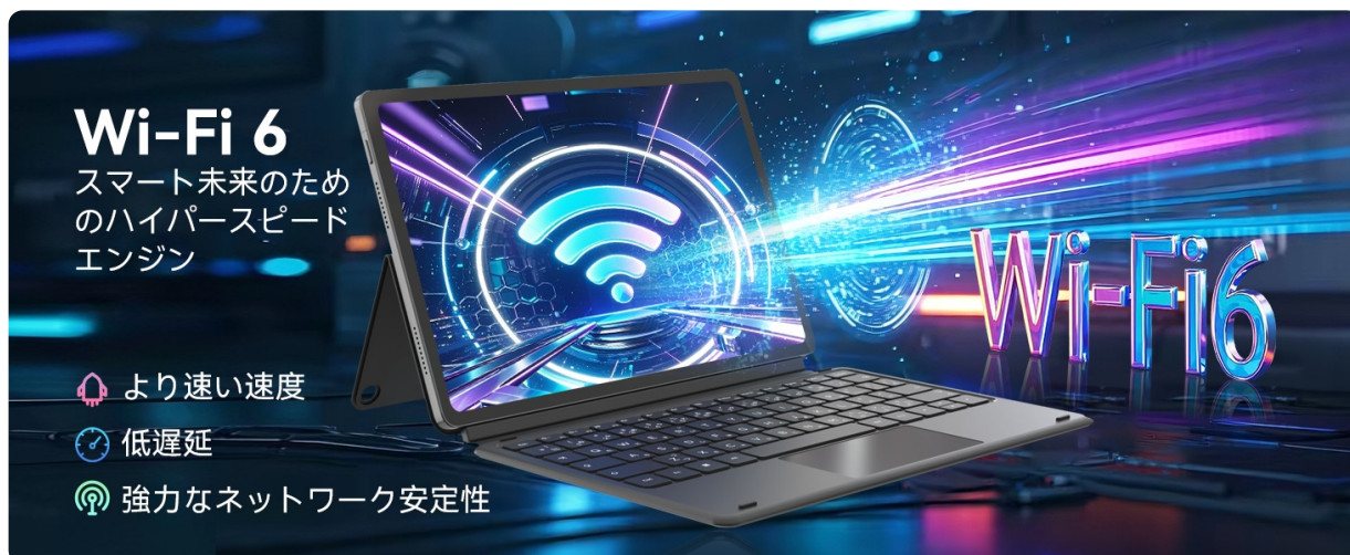
Figure 7: Wi-Fi 6 connectivity for a fast and stable internet experience.

The device features Wi-Fi 6 and Bluetooth 5.0 for stable and fast wireless connections. It includes two Type-C ports (for charging and data transfer), USB 3.0, a TF card slot, Micro HDMI, and a 3.5mm audio jack, providing versatile connectivity for various peripherals and external displays.