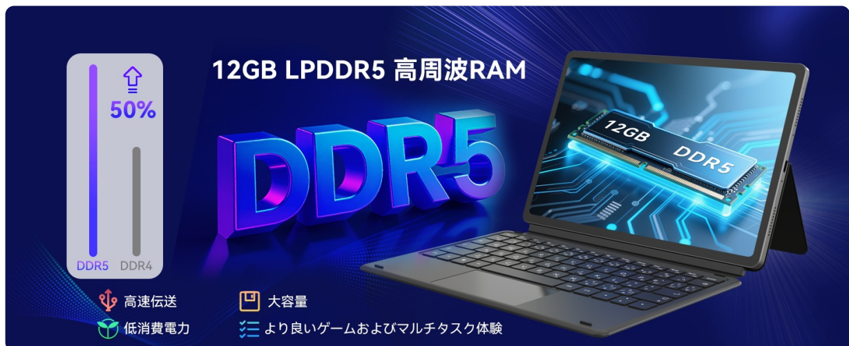
Figure 4: Illustration of LPDDR5 RAM benefits, including speed and power efficiency.

The 256GB PCIe NVMe SSD provides high-speed storage, optimizing file operations and application launches. This durable storage solution is designed for stable performance even in challenging environments, with robust encryption for privacy protection.