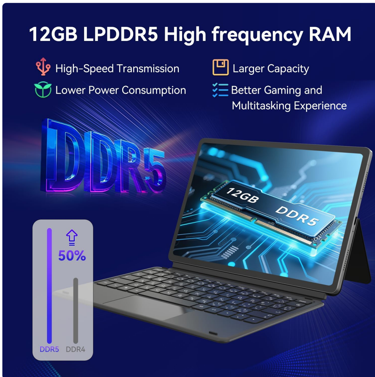
Figure 2: The NewBook 11 demonstrating its flexibility across different usage modes.

Your browser does not support the video tag.