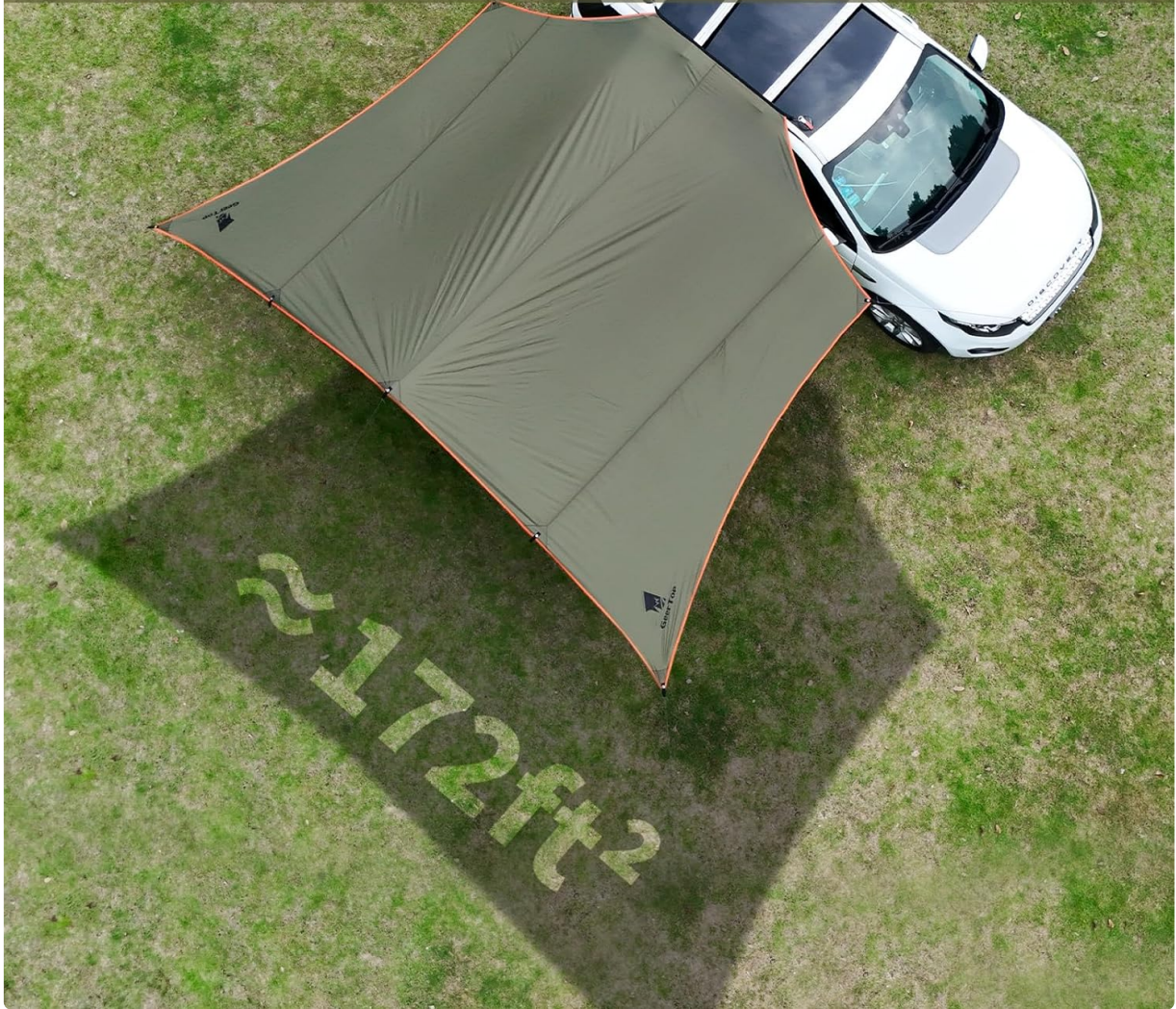
Image: Awning attached to a white SUV with suction cups on the roof, demonstrating easy setup.