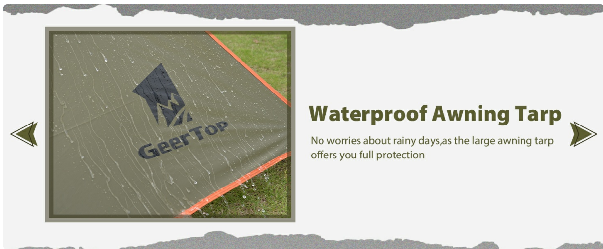
Image: Close-up view of the awning's waterproof fabric, highlighting its 3000mm water column rating.