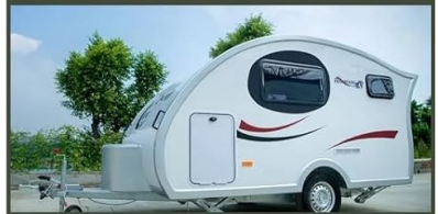
Image: The awning is shown compatible with a range of vehicles including trucks, SUVs, MPVs, RVs, Jeeps, and trailers.