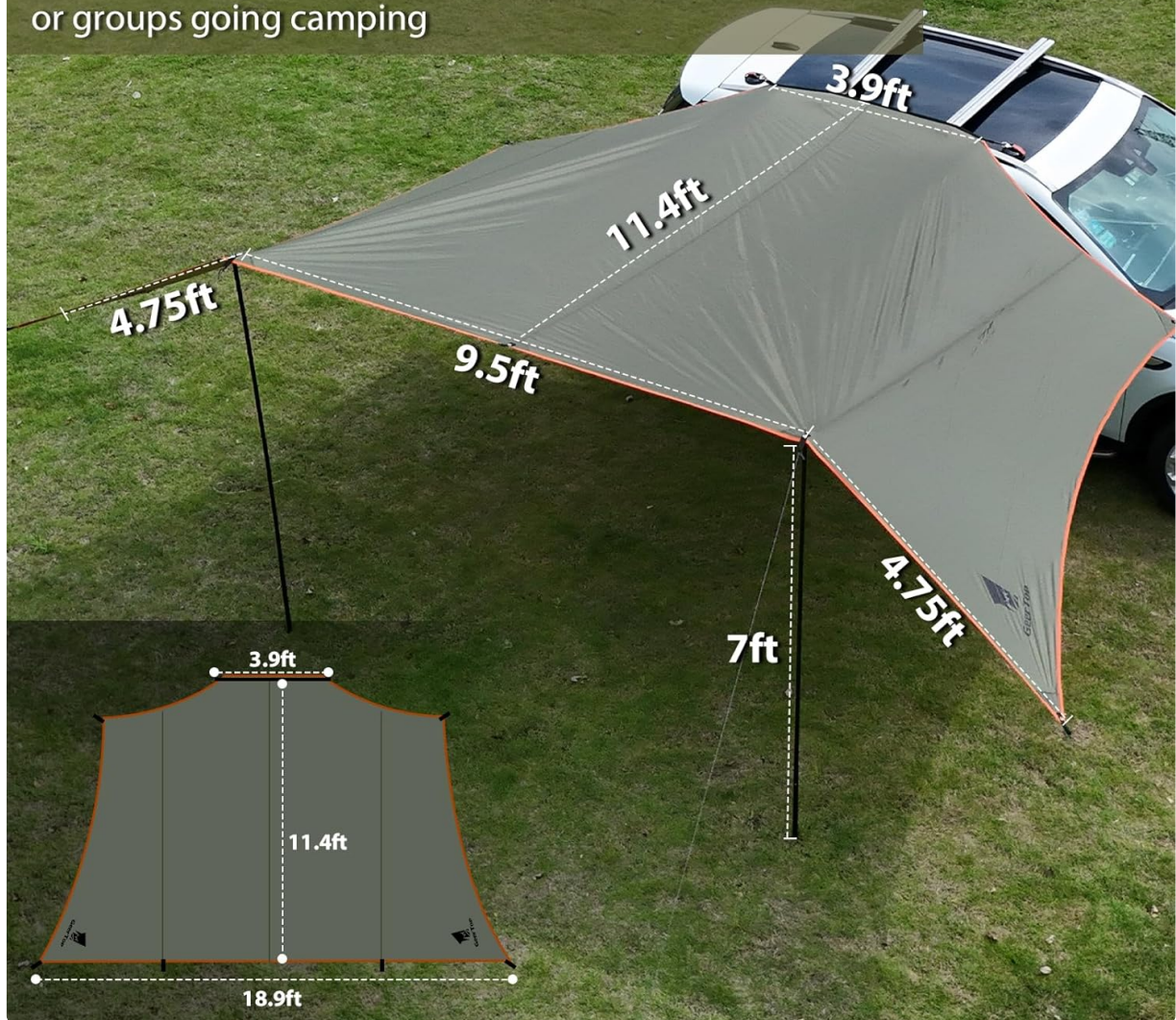
Image: Detailed dimensions of the awning, illustrating its large coverage area.

It covers a large area, perfect for families or groups going camping