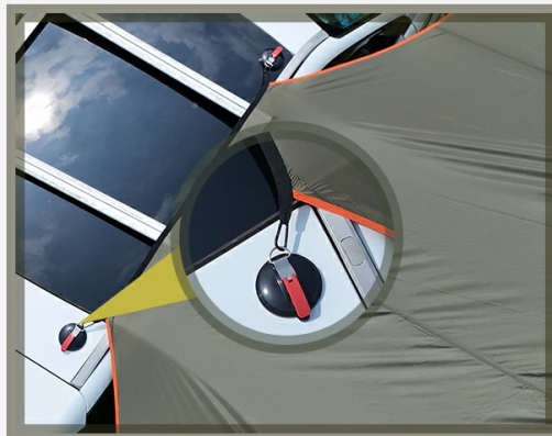
Image: Diagram illustrating the simple process of attaching the awning to a vehicle using suction cups.

Effortlessly secure the tarp to your vehicles with two strong, oversized suction cups