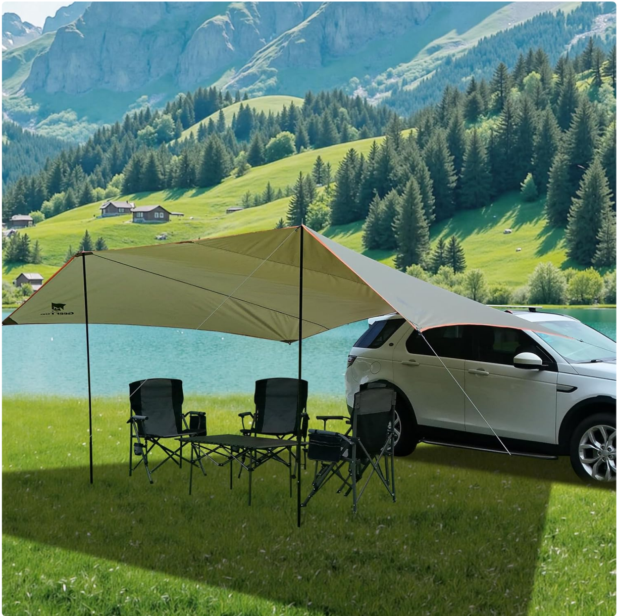
Image: Aerial view demonstrating the expansive 172 sq ft shade area provided by the awning.