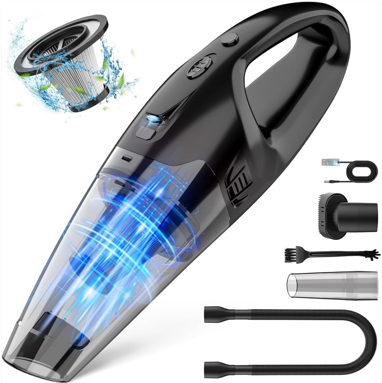
Image: The handheld vacuum unit with a visual representation of its HEPA filter being cleaned with water, emphasizing its washable design.

The washable HEPA filter should be cleaned regularly to ensure efficient filtration and suction.