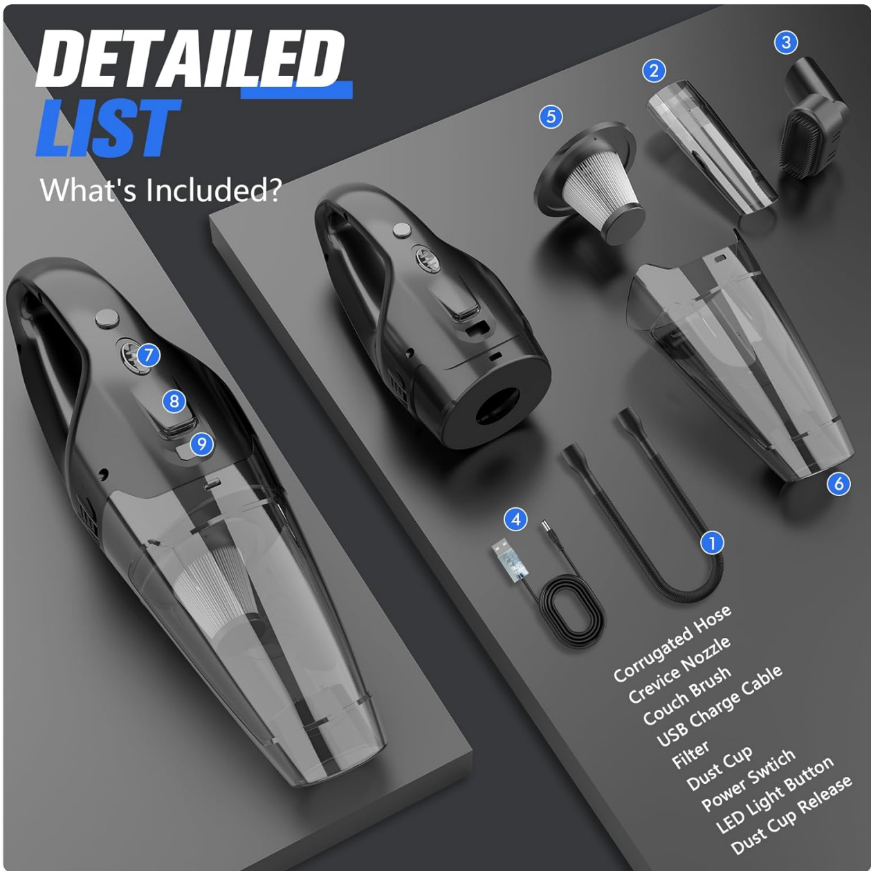
Image: All components of the BSRCO Handheld Vacuum, including the main unit, various nozzles, hose, filter, and charging cable.