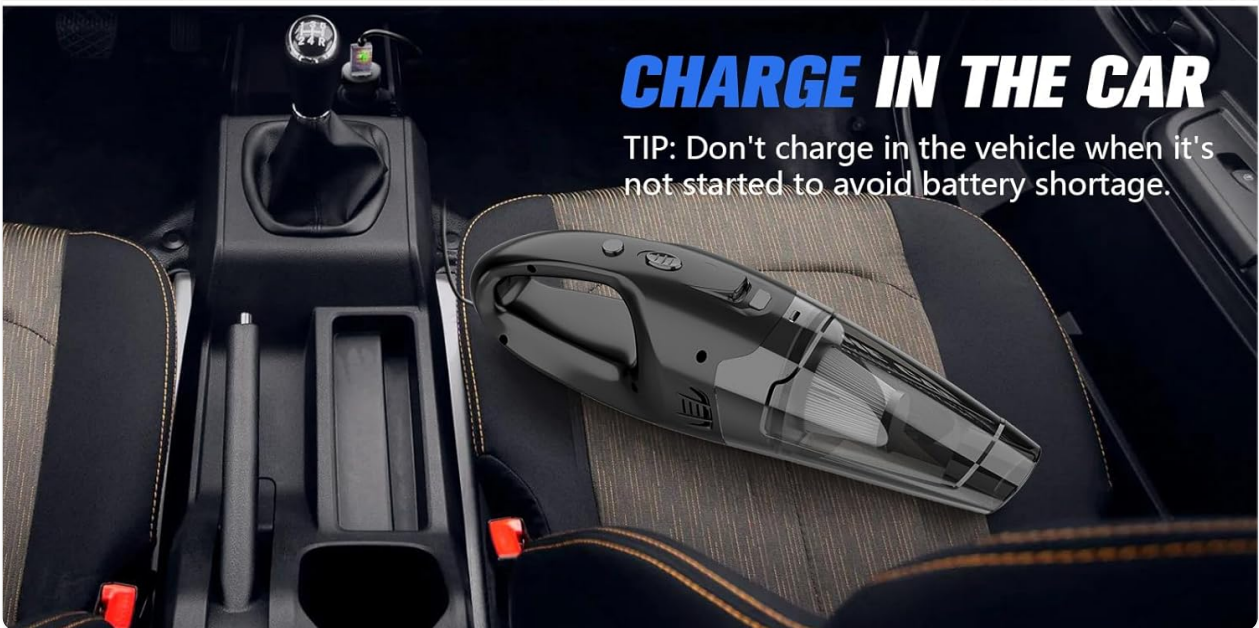
Image: The handheld vacuum unit connected to a USB charger, showing a red light for charging and a green light for fully charged. Also shown charging in a car interior.

TIP: Don't charge in the vehicle when it's not started to avoid battery shortage.