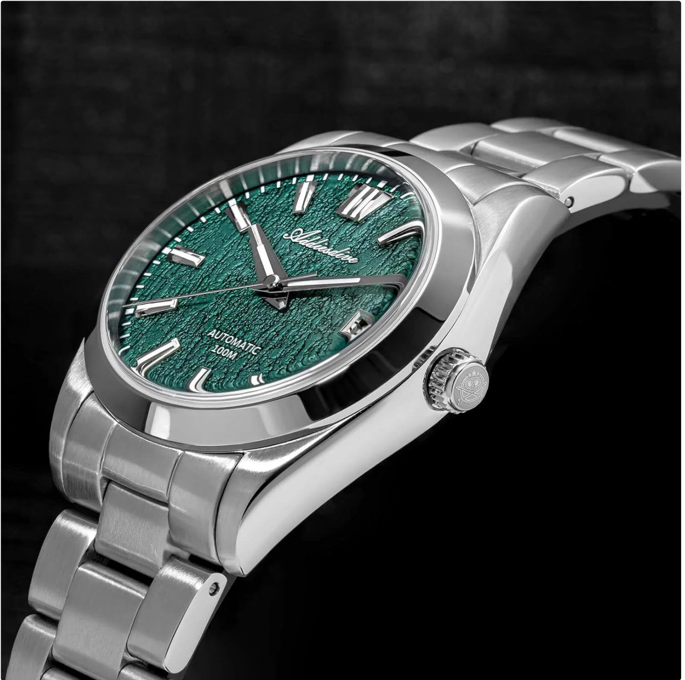
Figure 4: Luminous display of the watch in low light.

glows in low-light conditions, providing clear readability in the dark with a soft blue luminescence.