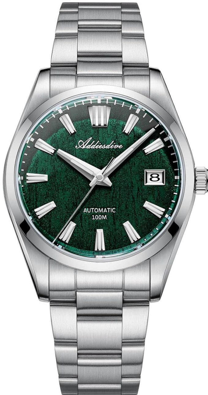
Figure 1: Close-up of the ADDIESDIVE AD2075 watch dial.