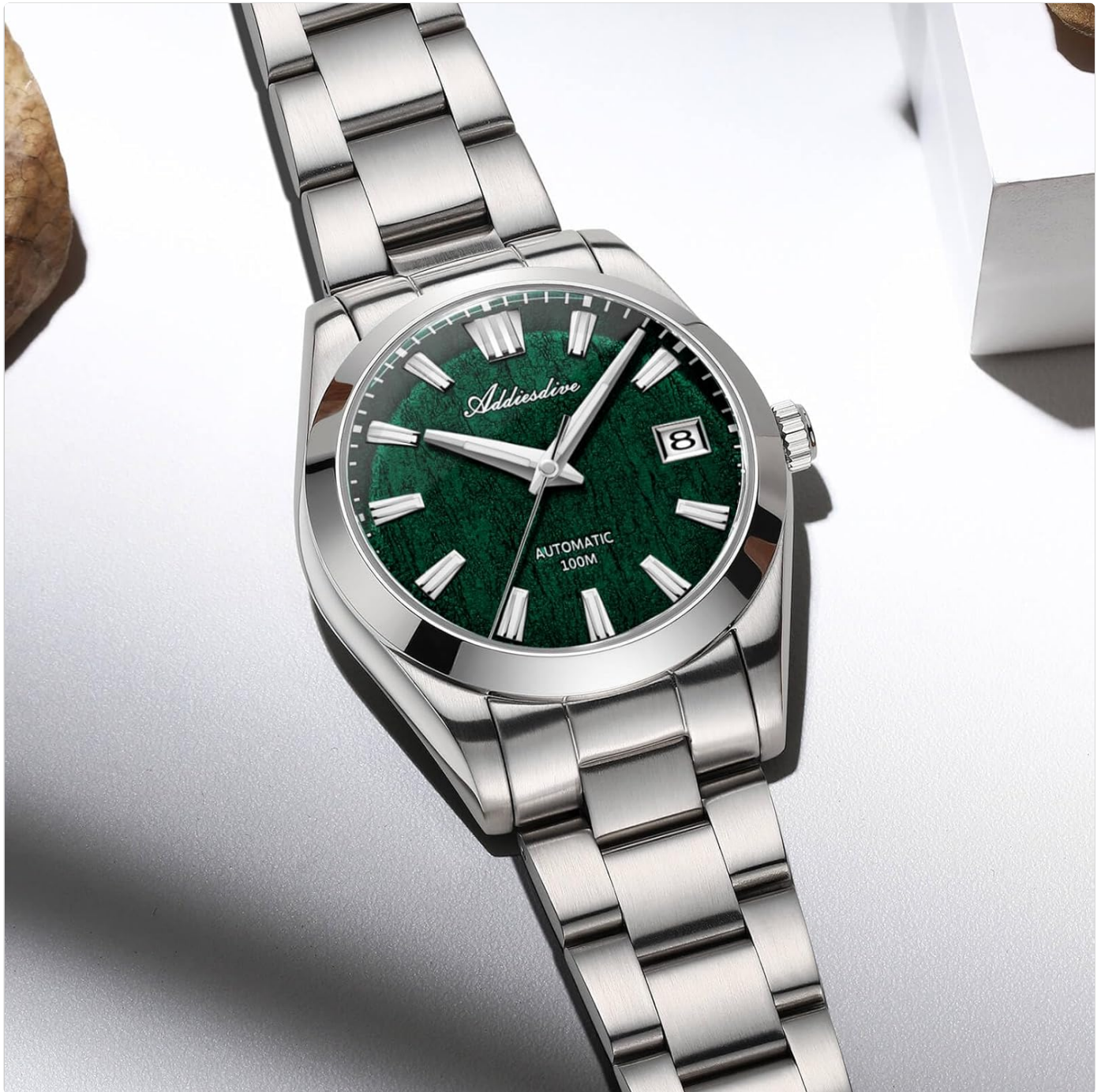
Figure 3: ADDIESDIVE AD2075 watch on a wrist.

Your ADDIESDIVE AD2075 watch is rated for 100 meters (10 ATM) of water resistance. This means it is suitable for everyday use, including hand washing, light rain, and accidental splashes. It is not suitable for swimming, diving, or showering with hot water. Always ensure the crown is fully screwed down to maintain water resistance.