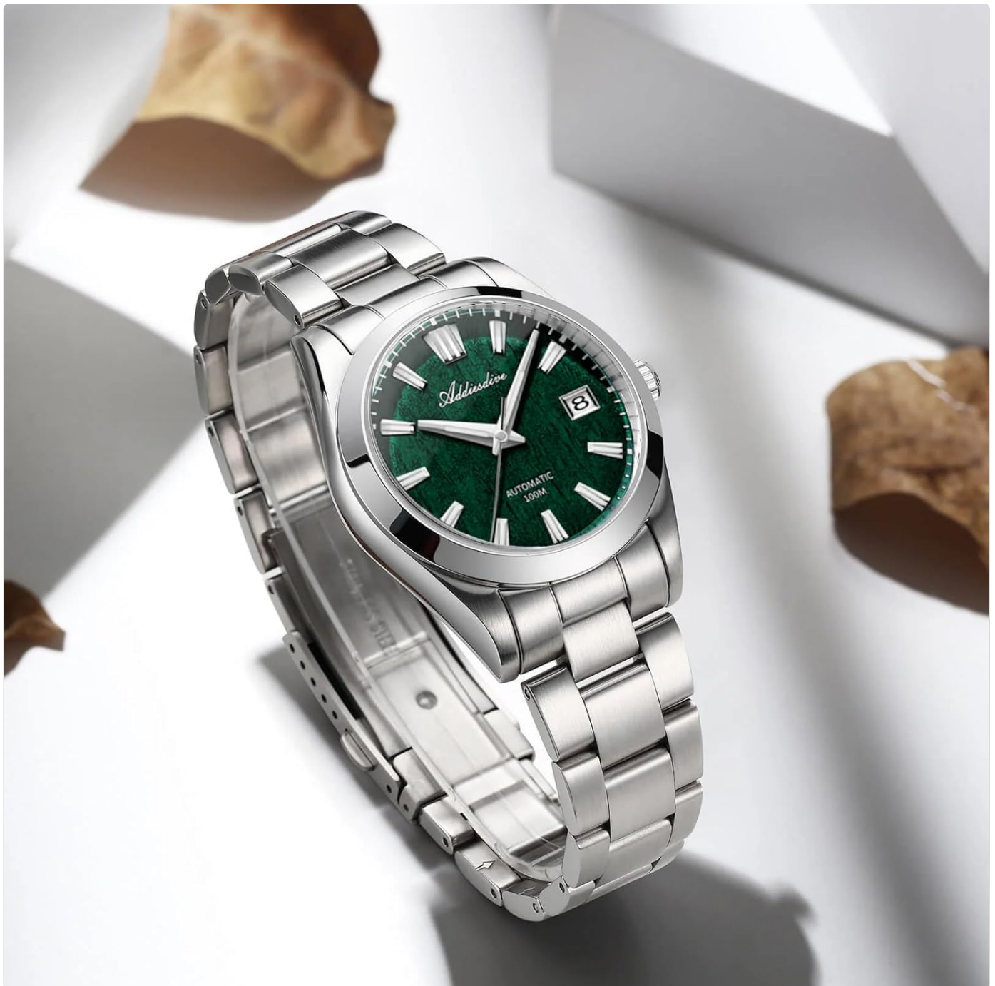
Figure 5: ADDIESDIVE AD2075 watch dimensions.