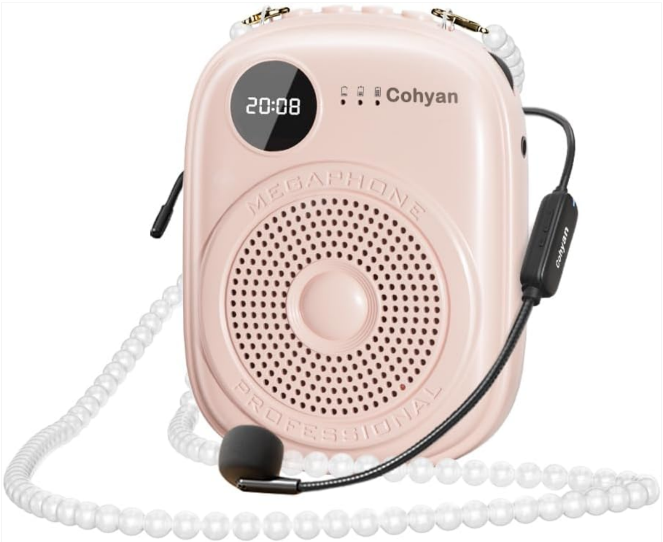
Figure 3.1: Main components of the COHYAN K18 Wireless Voice Amplifier package.