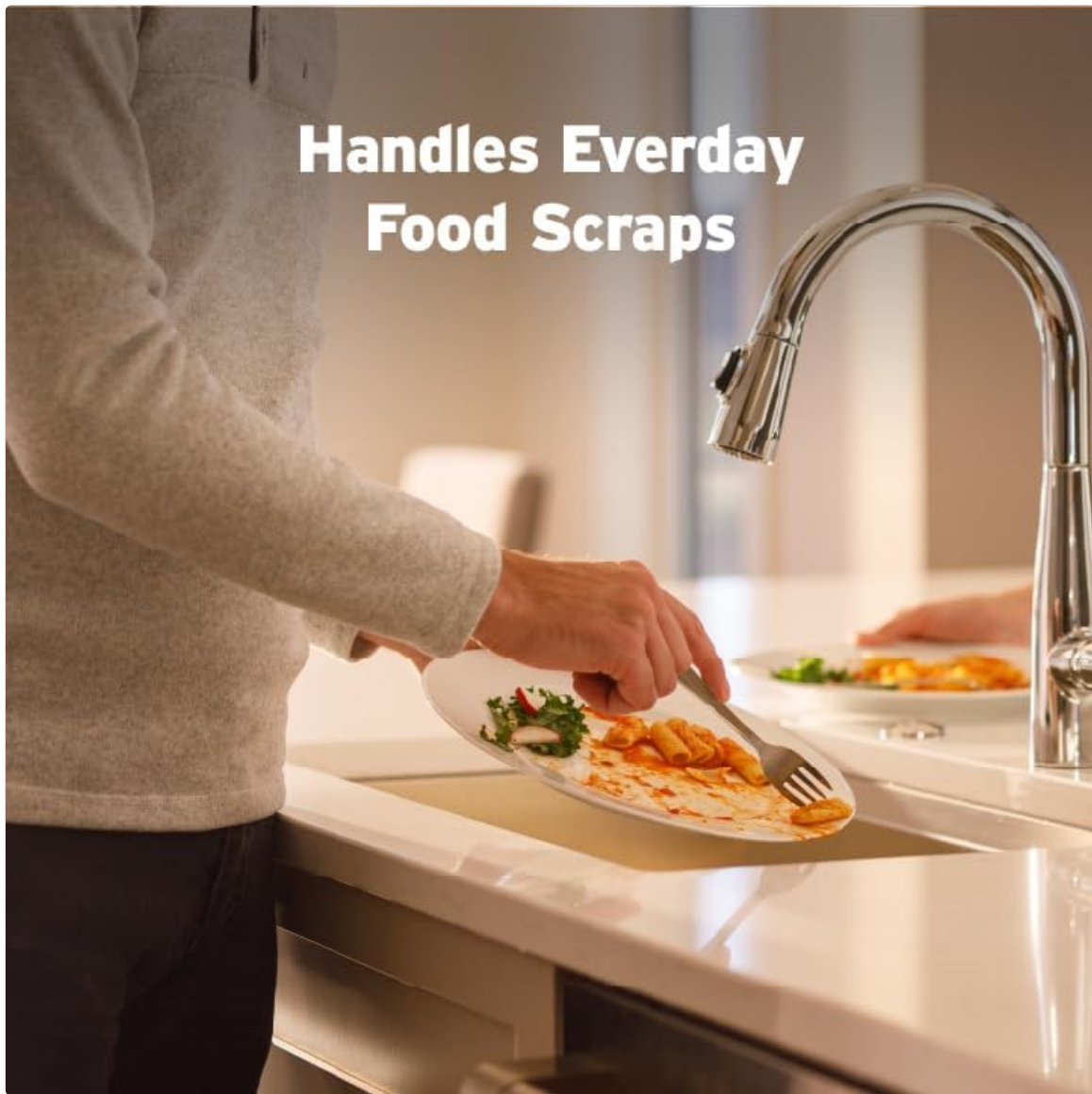
Figure 3: The Badger 5 efficiently handles everyday food scraps, making kitchen cleanup easier.