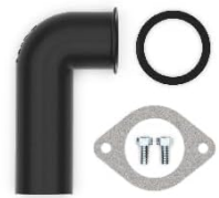
Discharge Tube Assembly