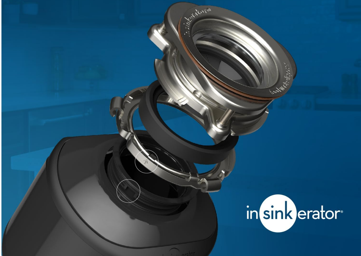
Figure 5: Lift & Latch Technology simplifies installation, enabling two-handed attachment of the disposal.