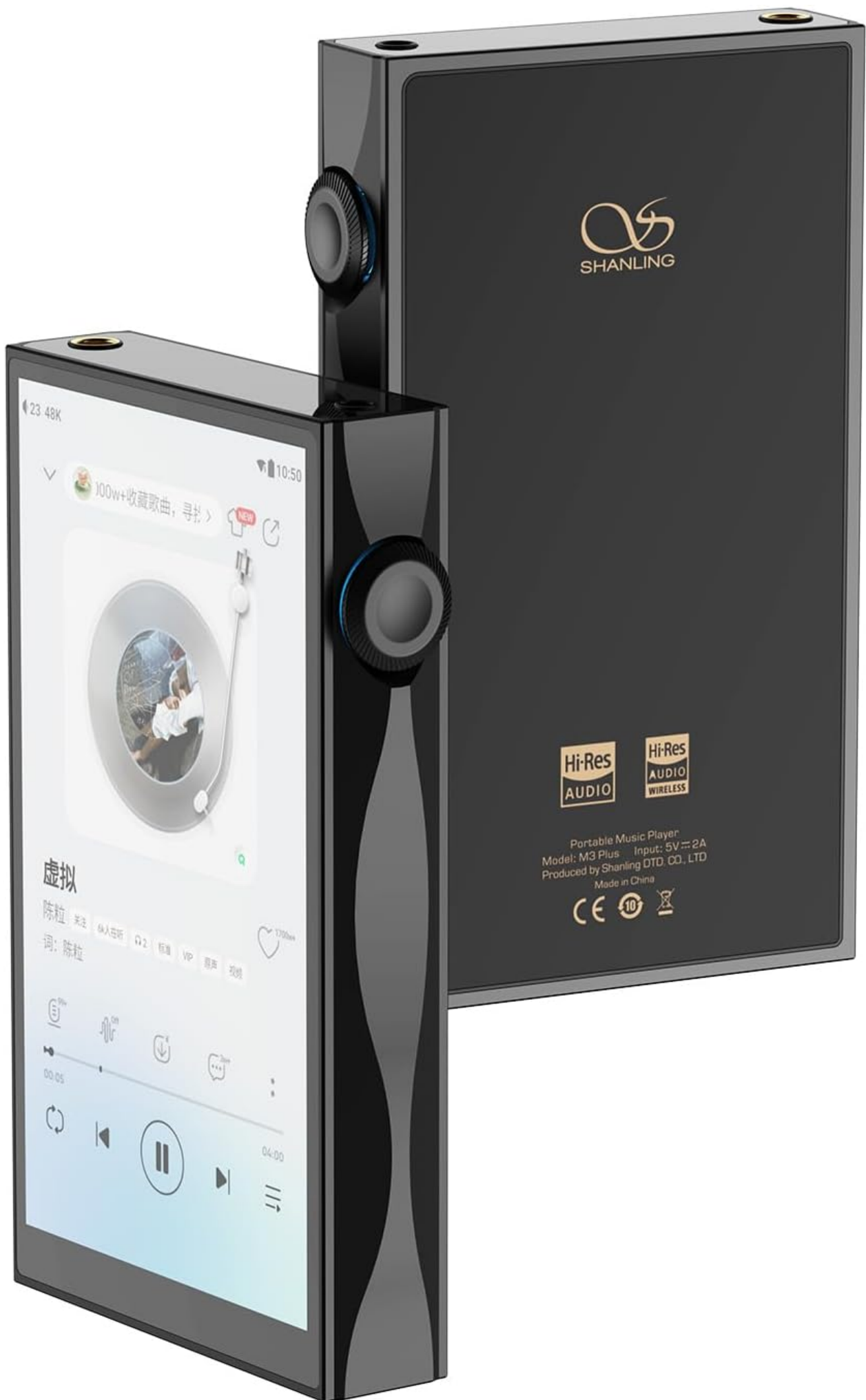
Image: Front and back view of the SHANLING M3 Plus, showing the screen and rear panel with branding and certifications.