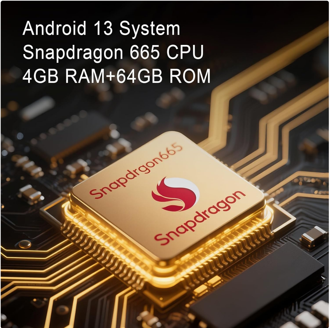
Image: Close-up of the Snapdragon 665 CPU chip, illustrating the core processing power of the M3 Plus with Android 13.