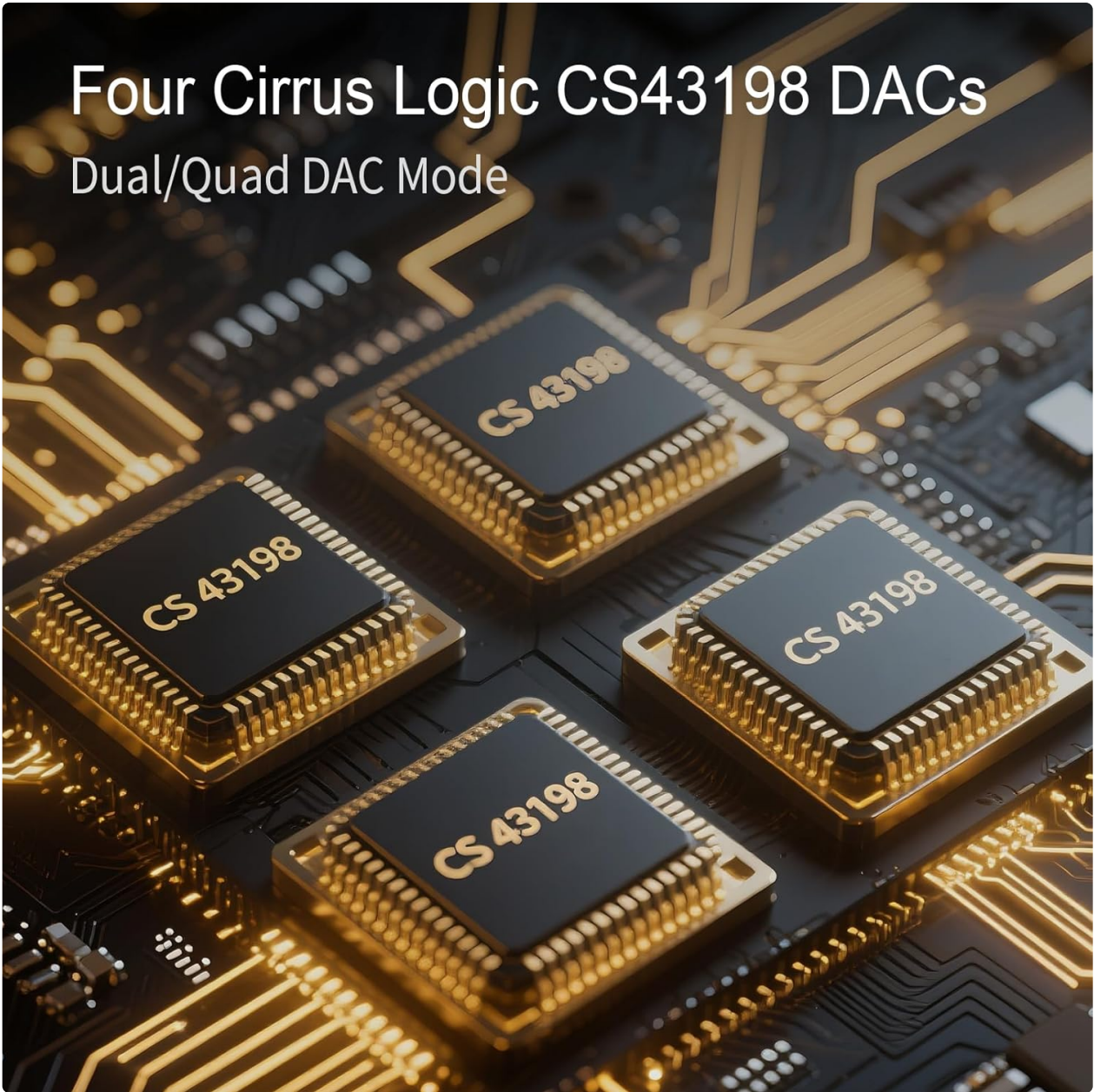
Image: Visual representation of the four Cirrus Logic CS43198 DACs, highlighting the device's advanced audio processing capabilities.