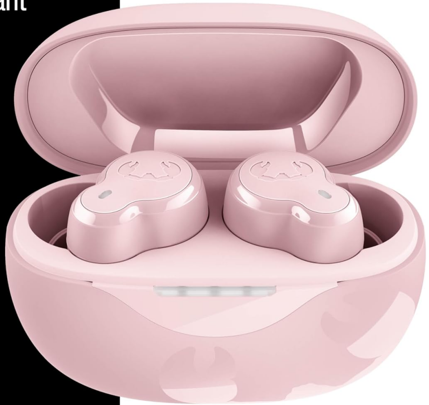
Image: A pink charging case open, revealing two pink Twins Breez earbuds inside, with text indicating "Ultra Compact" and "Powerful sound in tiny earbuds."

Un son puissant dans de minuscules écouteurs