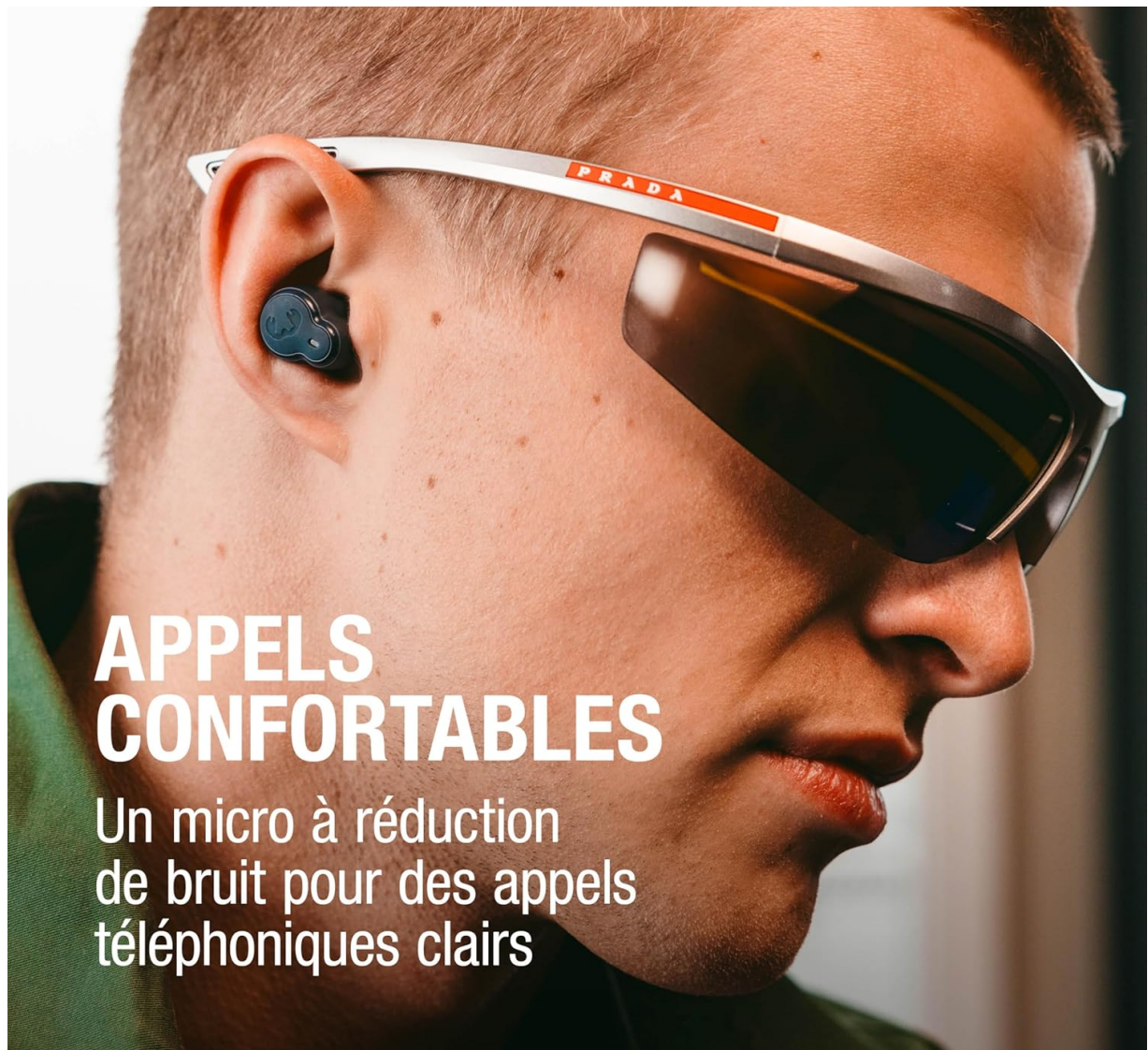
Image: A person wearing a dark blue earbud, smiling, with text indicating "Convenient Calling" and "Noise Cancelling Microphone for Clear Calls."