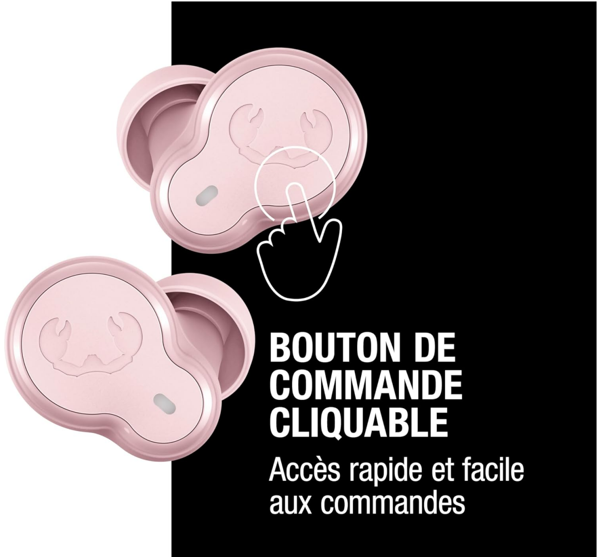
Image: Two pink Twins Breez earbuds with a hand icon indicating the clickable control area on the earbud.

The Twins Breez earbuds feature a clickable control button for easy management of audio and calls.