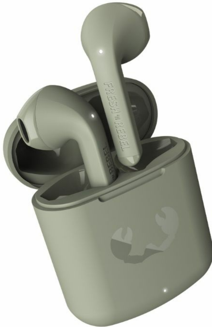
Image: A light grey charging case for the earbuds, shown from multiple angles, highlighting its compact design and charging port.