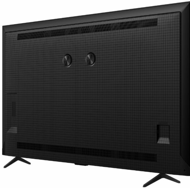
Image: Angled rear view of the TCL 50P7K QLED TV, providing a clearer look at the port arrangement.