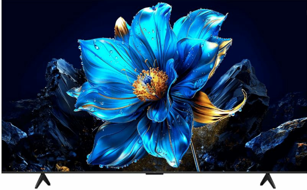
Image: Front view of the TCL 50P7K QLED TV with its two-leg stand attached.