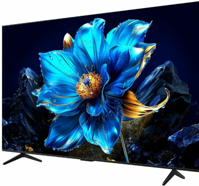
Image: Side view of the TCL 50P7K QLED TV, showing the profile with the stand.