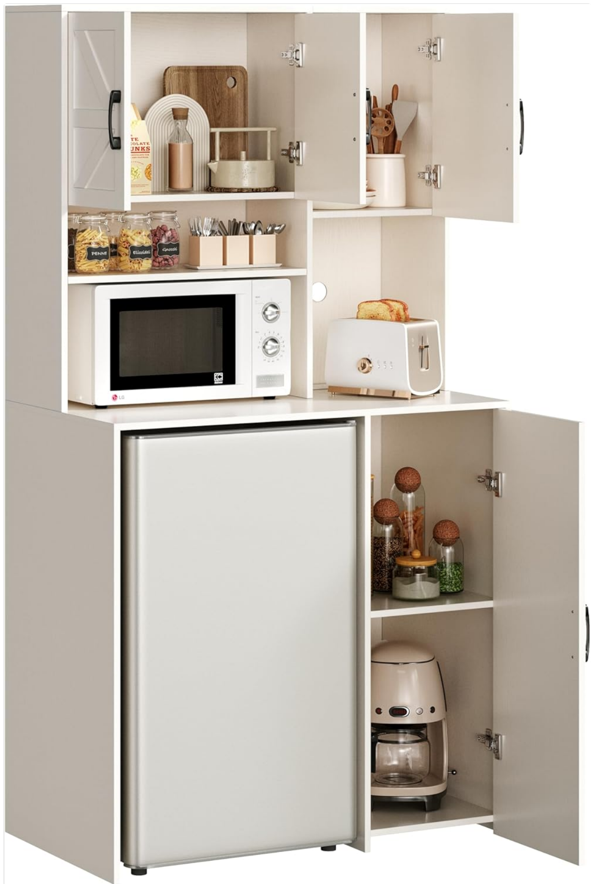
Figure 3: Cabinet in Use. This image demonstrates the cabinet's functionality as a beverage station or coffee bar, accommodating a mini fridge and various small appliances.