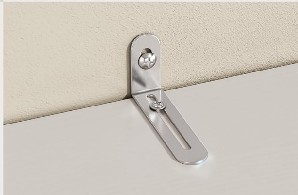
Figure 2: Key Features. This image highlights the integrated power socket, the spacious upper double cabinets for storage, and the anti-tip kit for enhanced safety.

Secures the cabinet to the wall for a safer space.