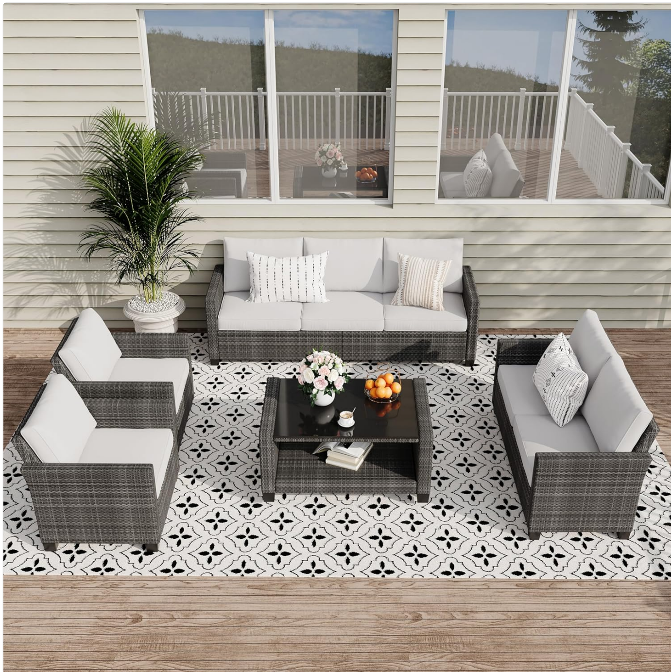
Image: The Garvee patio furniture set configured in an L-shape, demonstrating its adaptability to different outdoor layouts.