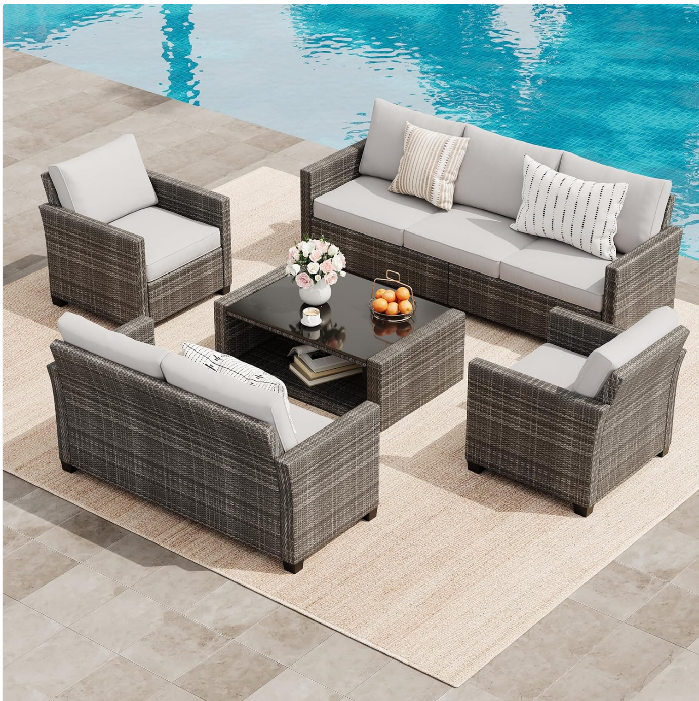
Image: The patio furniture set positioned next to a swimming pool, illustrating its suitability for various outdoor environments.