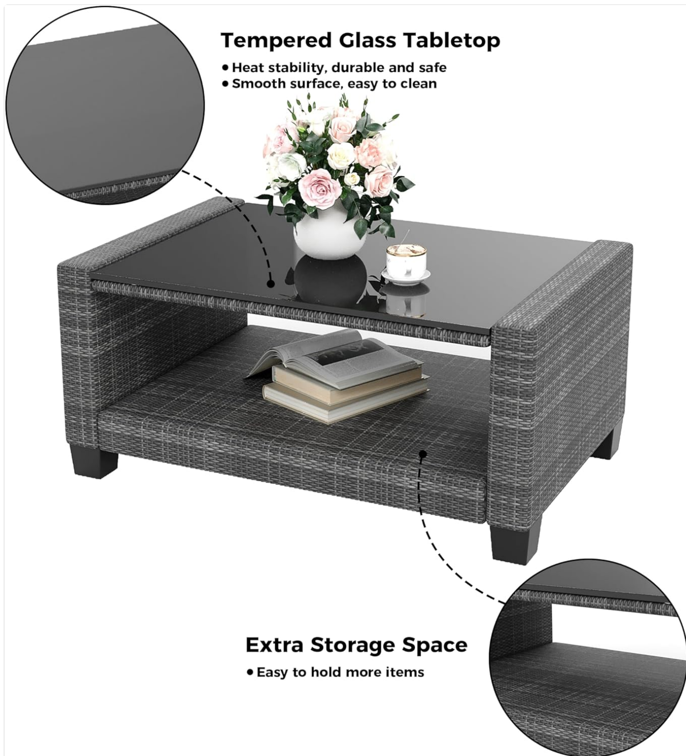
Image: A close-up of the coffee table, showcasing its tempered glass tabletop and the additional storage space available underneath, suitable for books or magazines.