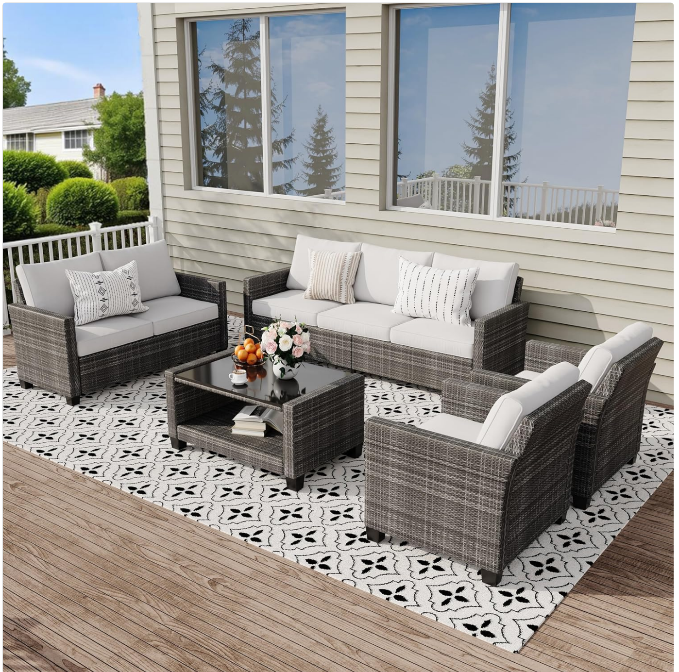
Image: The complete Garvee 5-piece patio furniture set, including two armchairs, a loveseat, a three-seater couch, and a coffee table, arranged on an outdoor patio.