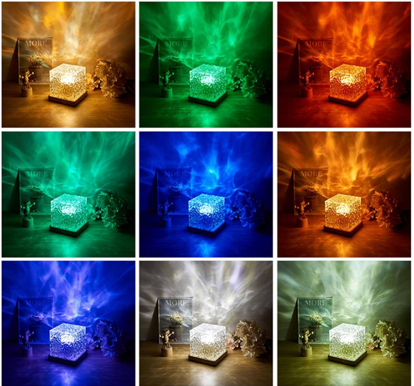
Image: A collage of nine images, each showing the Lumena Lamp projecting different colored water ripple effects onto a wall, including shades of orange, green, blue, and white, highlighting its versatile ambiance creation.