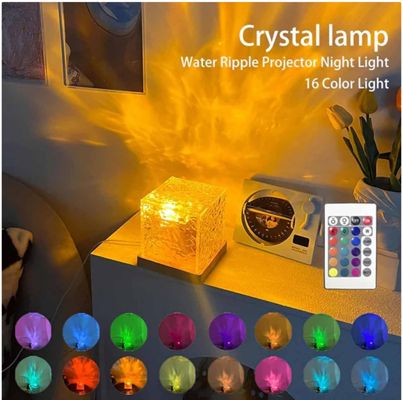
Image: The Lumena Lamp projecting a warm yellow water ripple effect on a wall, with an array of 16 color swatches displayed below, demonstrating the variety of available light colors.