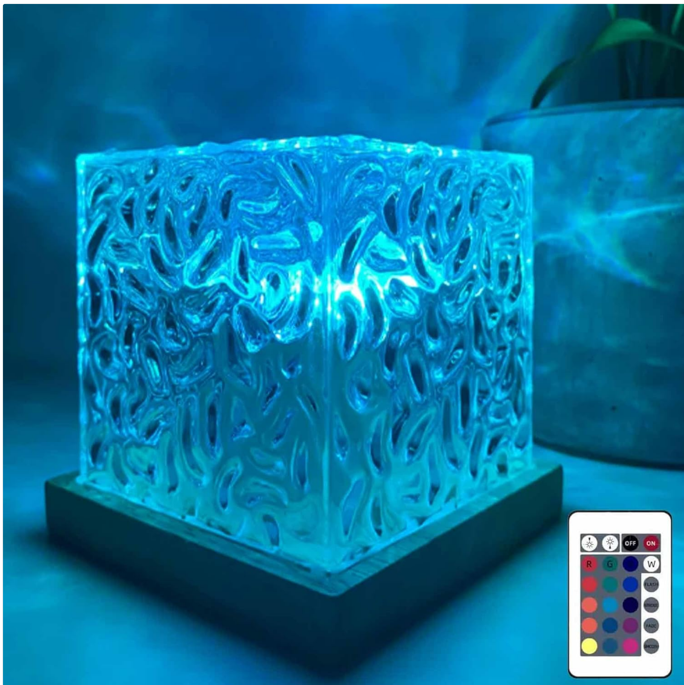
Image: The Lumena Lamp, a cube-shaped light with a textured surface, emitting a blue light, shown next to its remote control. This image illustrates the main components included in the package.