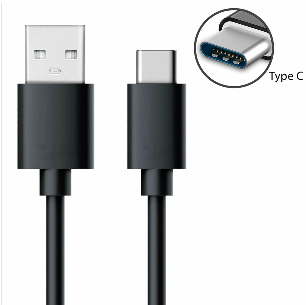
Image: Close-up view of the USB Type-A and Type-C connectors, highlighting the Type-C end for device connection.