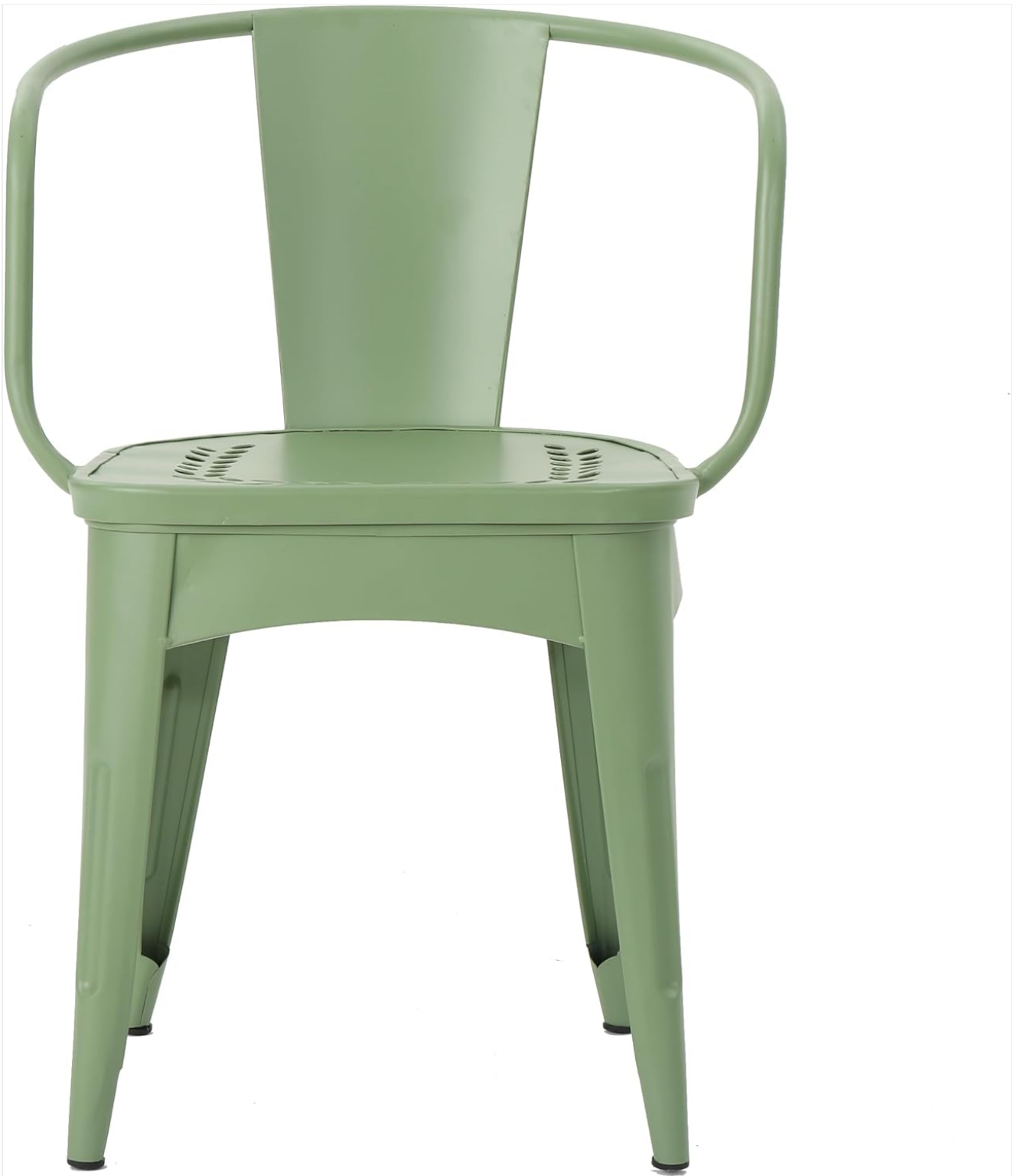
Image: A detailed view of one of the green bistro chairs, showcasing its ergonomic design and decorative seat perforations.

4. Final Check: Ensure all bolts are securely tightened and the furniture is stable before use.