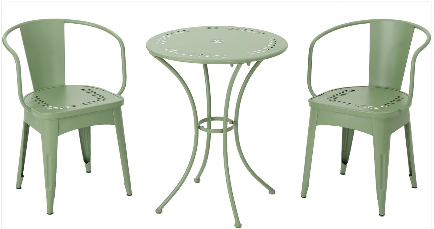
Image: Overview of the Cattino Bistro Table and Chairs Set, displaying one round table and two matching chairs, all in a green finish.