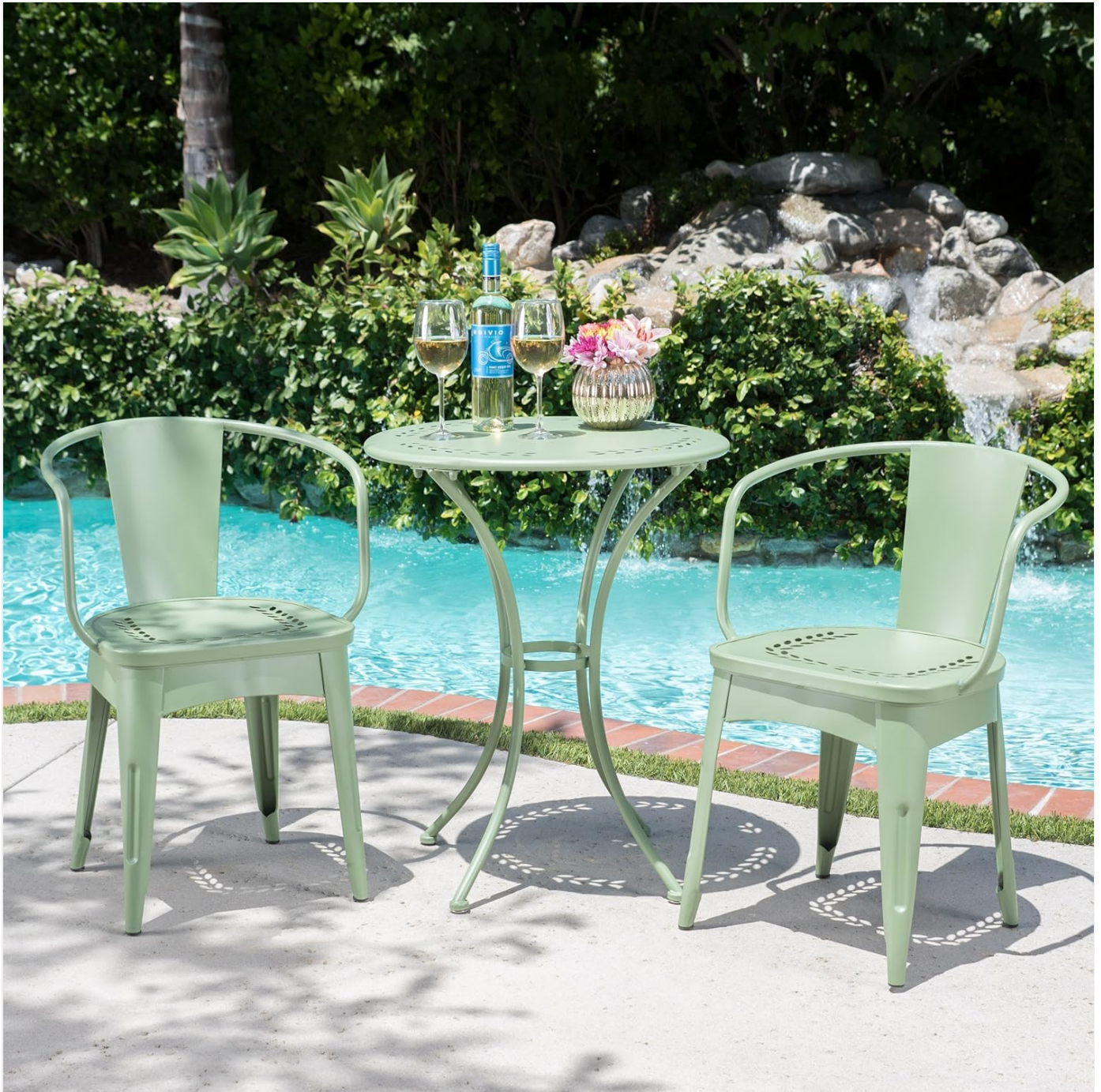
Image: The green bistro set positioned next to a swimming pool, demonstrating its suitability for various outdoor environments.