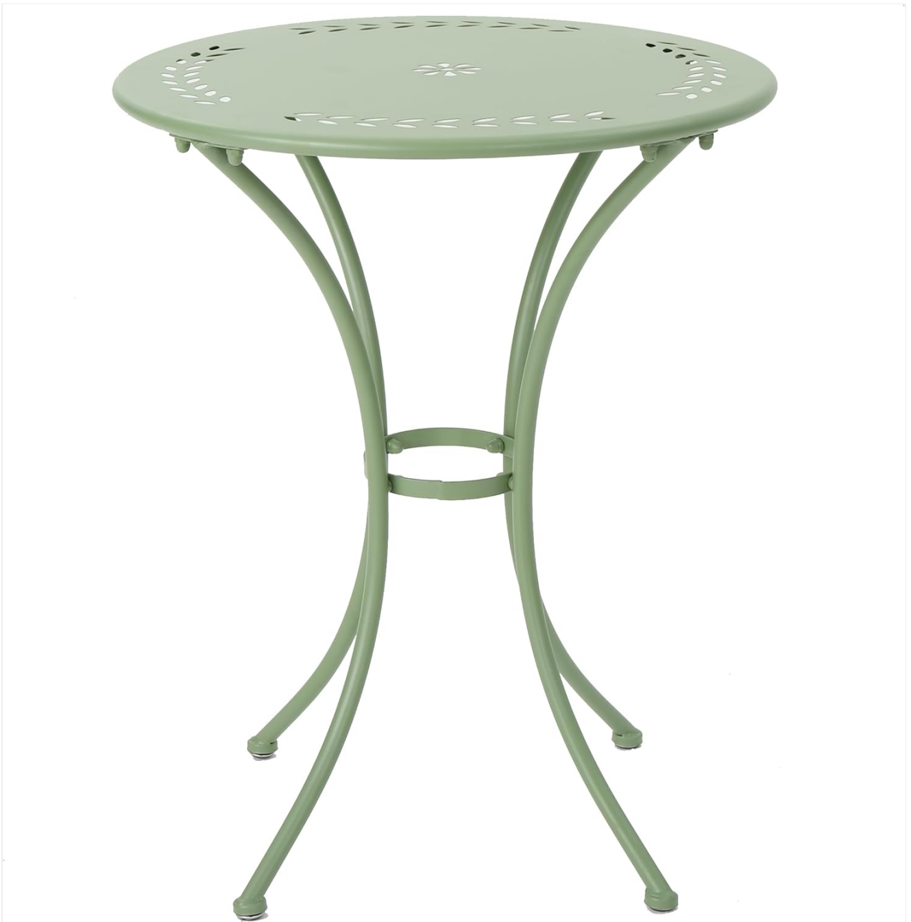
Image: A close-up view of the green round bistro table, highlighting its intricate floral details and curved leg design.