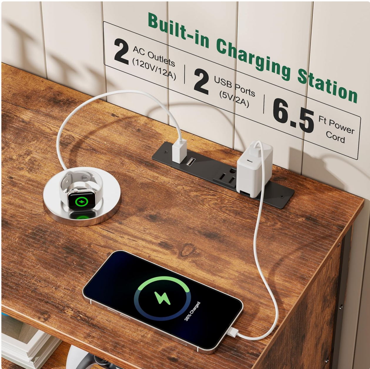
Figure 4: Detail of the integrated power strip, featuring 2 AC outlets and 2 USB ports for easy device charging.