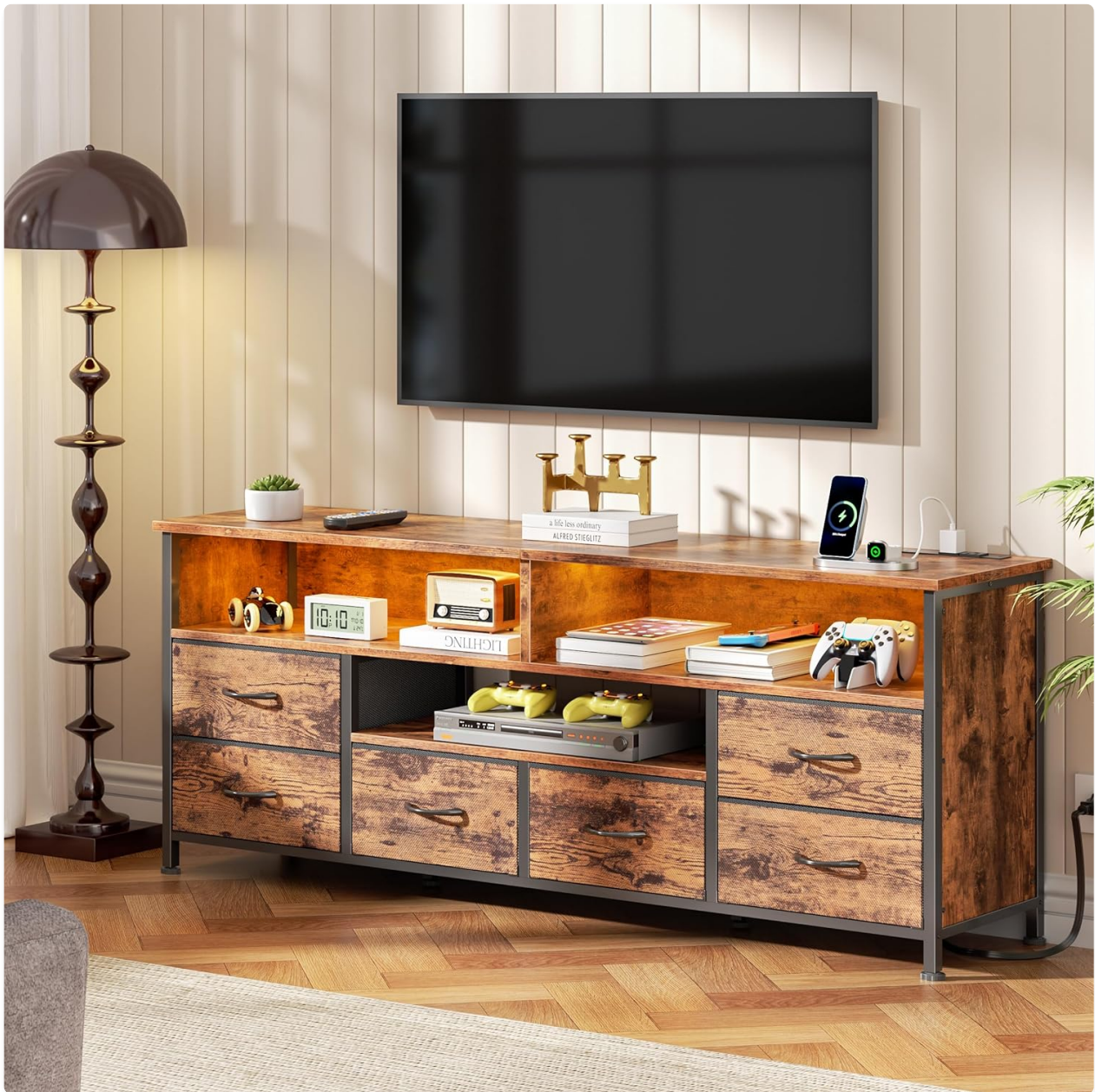
Figure 1: The Furologee 55-inch LED TV Stand in a living room environment, showcasing its design and functionality.