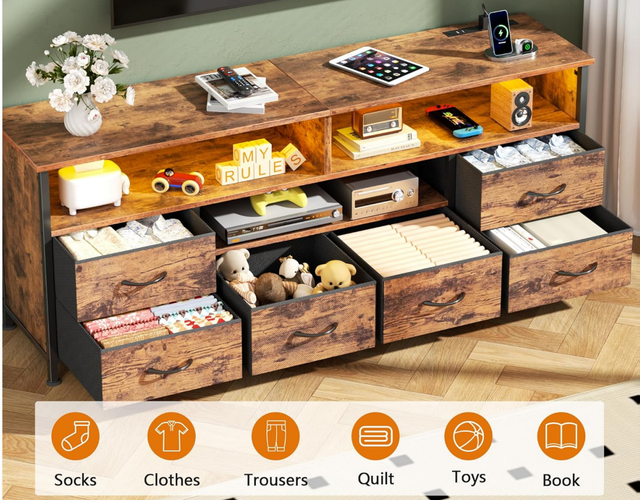
Figure 5: The TV stand with its six fabric drawers, demonstrating their storage capacity for various household items.