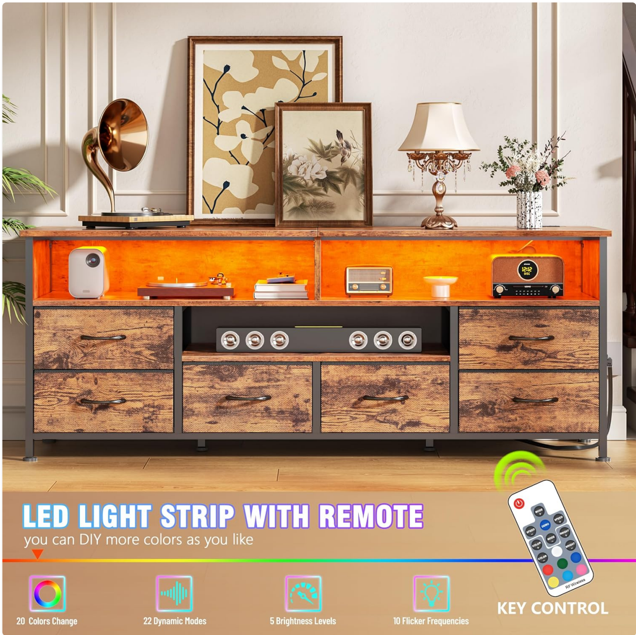
Figure 3: The remote control for the LED light strip, offering multiple color and mode options.