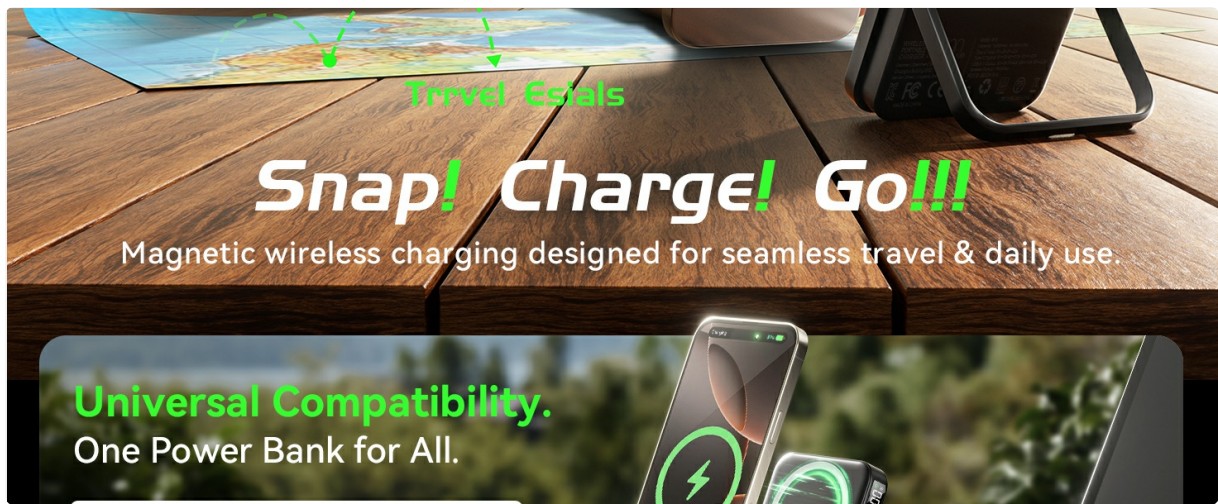
Figure 3: Charging the Power Bank