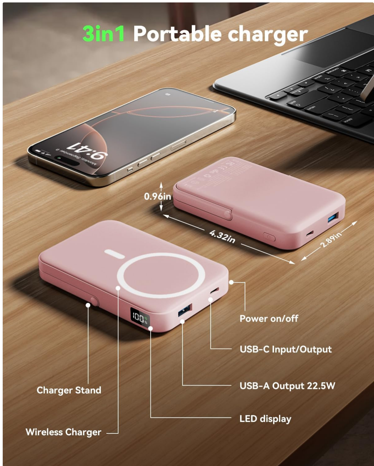
Figure 1: Product Components and Ports