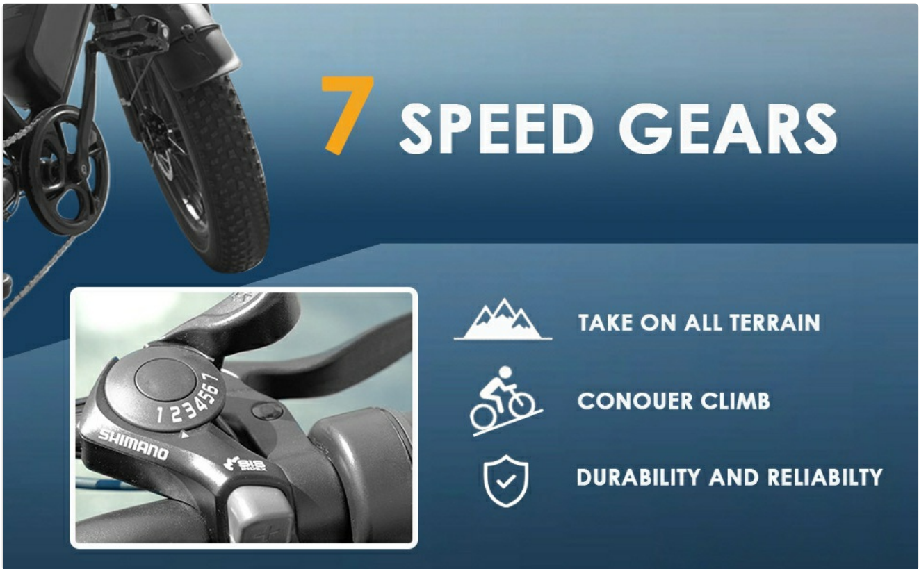
Image: 7-speed gear system for varied terrain.