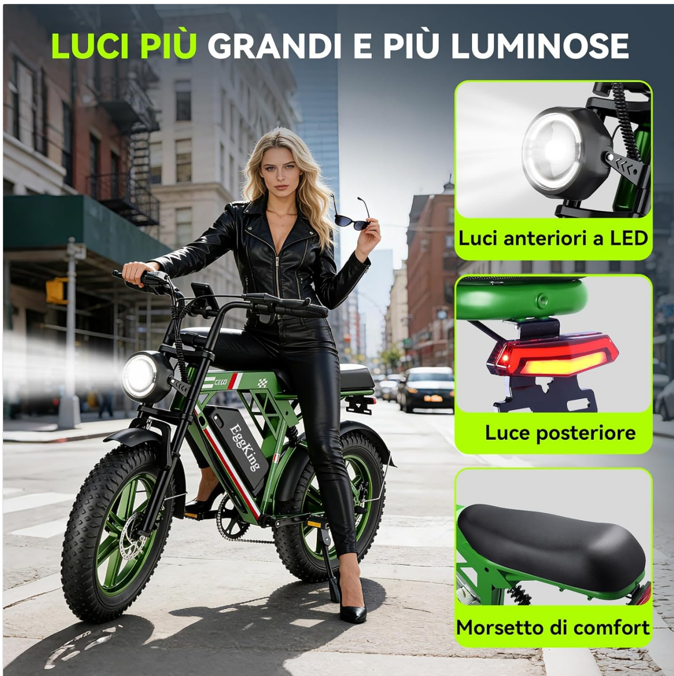
Image: Headlight assembly and cable connection.