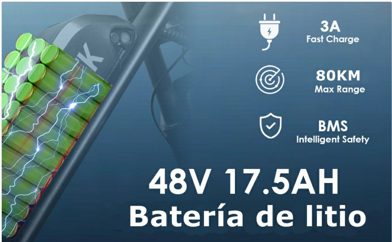
Image: Battery specifications and features.