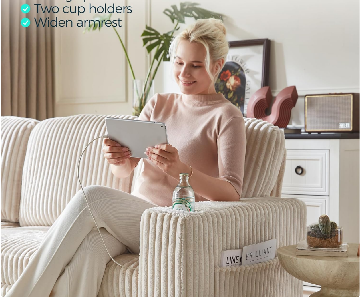
Image 2.1: Detail of the sofa's armrest, highlighting the USB charging port, cup holder, and side storage pocket for convenience.