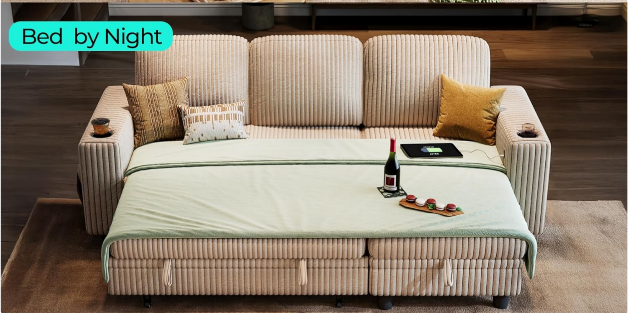
Bed by Night