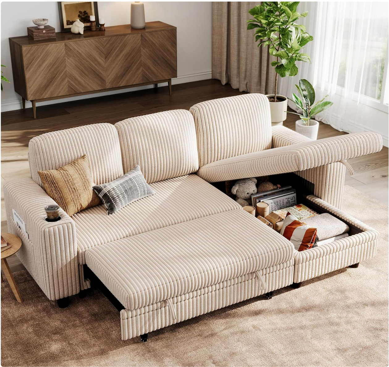
Image 1.1: The LINSY HOME Sectional Sleeper Sofa, featuring a pull-out bed and storage chaise, integrated into a modern living space.