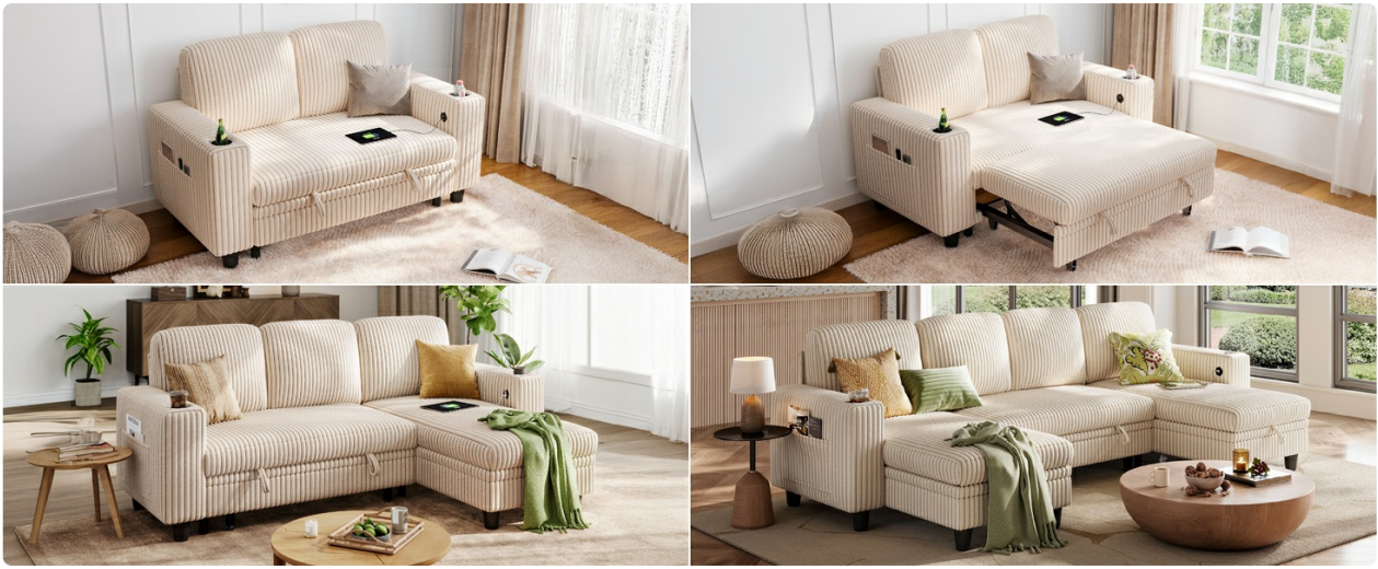
Image 2.3: Various modular arrangements of the sofa, illustrating its adaptability to different room layouts.