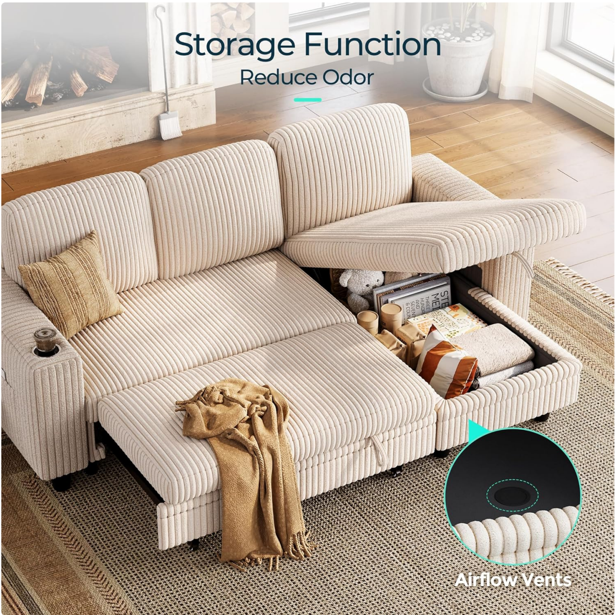
Image 4.3: The storage chaise with its lid open, showing ample space for various household items.