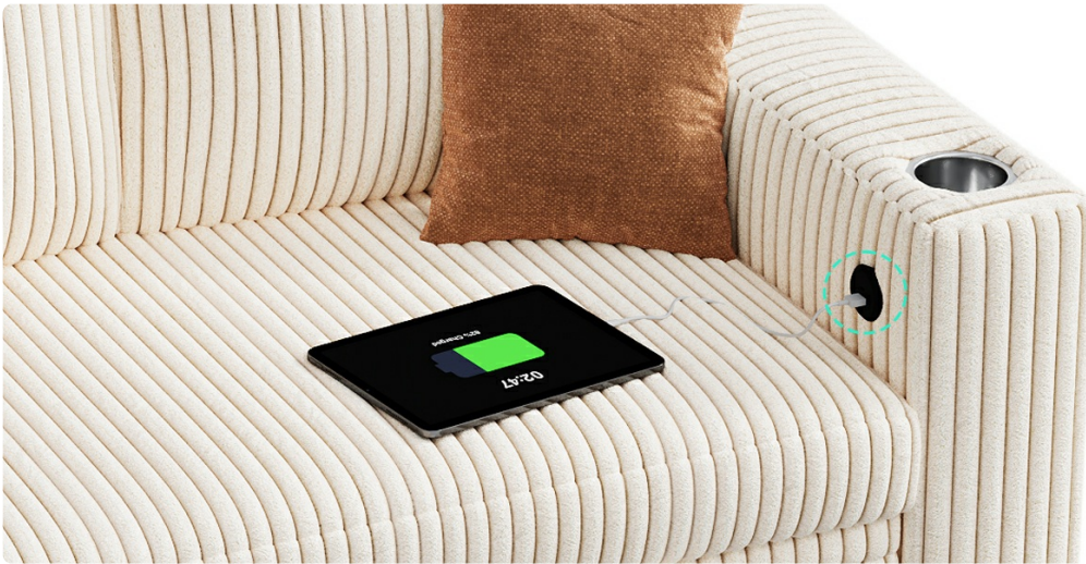
Image 4.5: A tablet being charged via the USB port located on the sofa's armrest.

device's charging cable into the appropriate port.