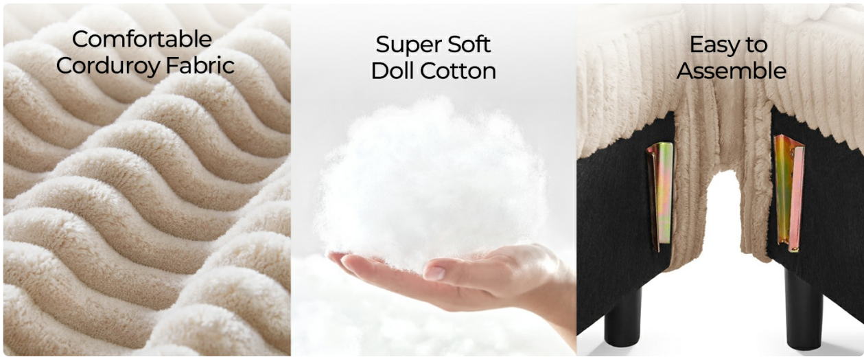
Image 3.1: Visual representation of the sofa's comfortable fabric, soft filling, and the simple metal connectors used for assembly.