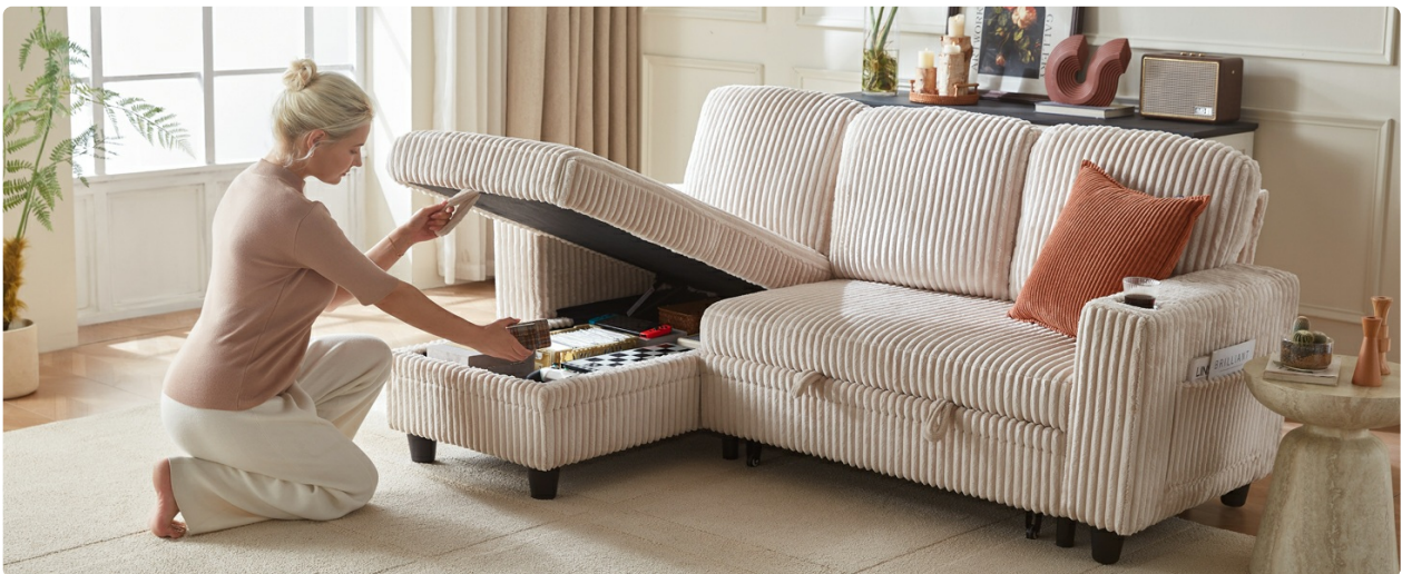
Image 4.4: A user demonstrating how to access the storage compartment within the chaise.