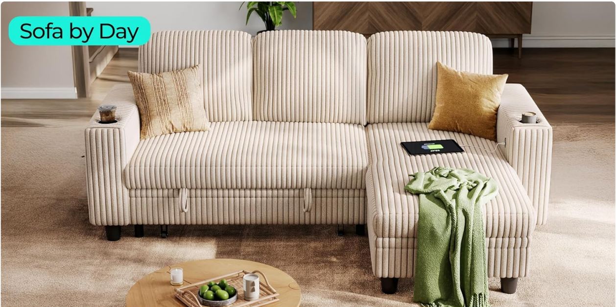
Sofa by Day