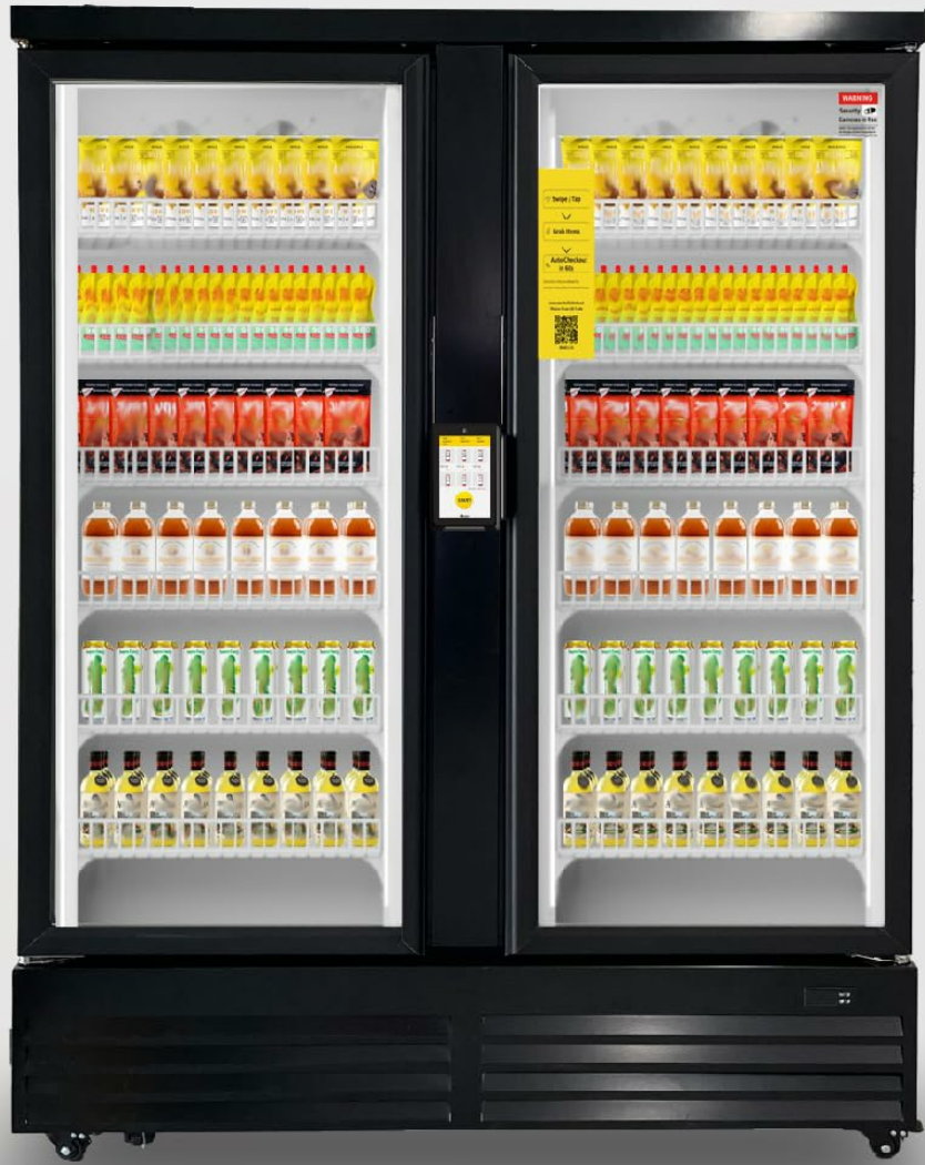
Figure 1.1: Front view of the HAHA Large Smart Vending Machine.