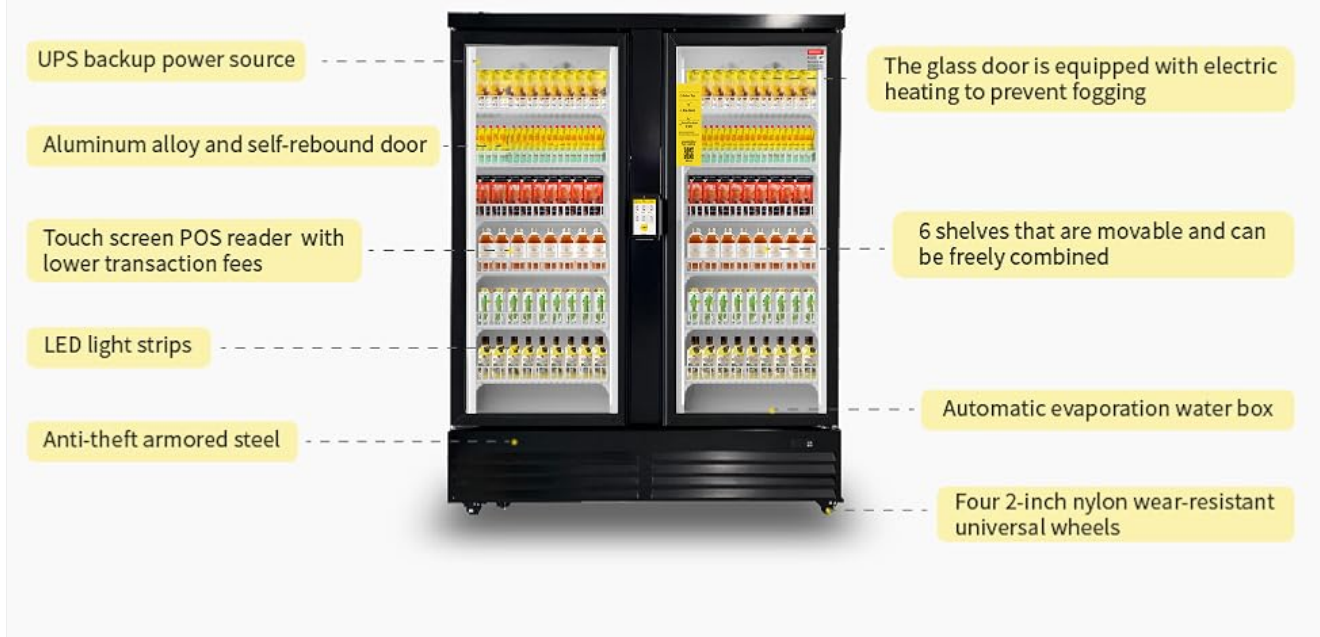
Figure 1.2: Illustration of AI-Powered Cooler capabilities.