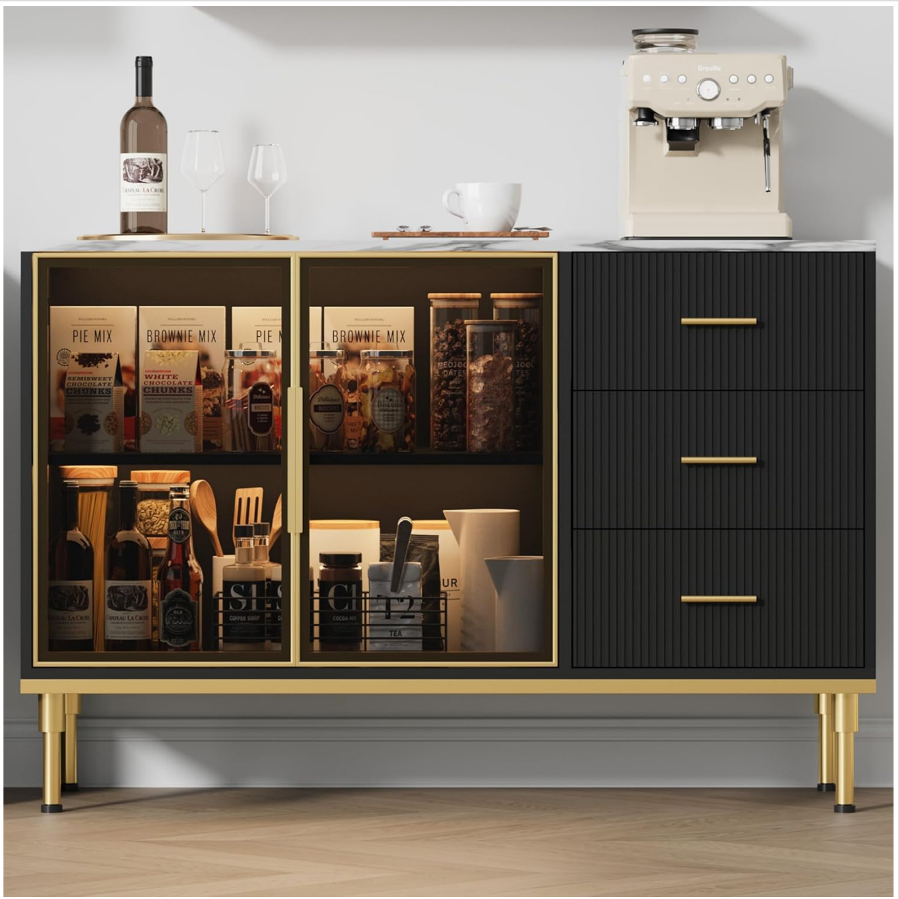
Figure 3.1: Cabinet interior showing organized storage for kitchen essentials.