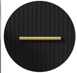
Stylish Gold Handle