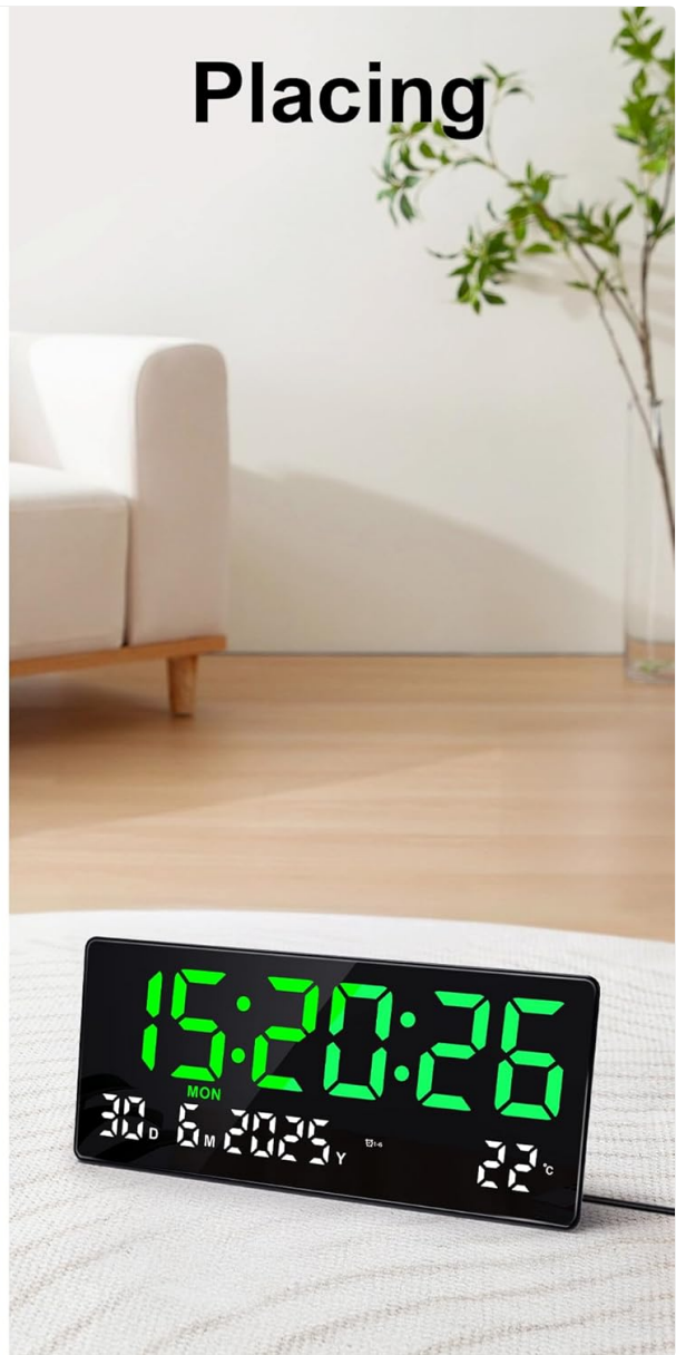
Figure 5.1: Wall hanging and desk placement options.