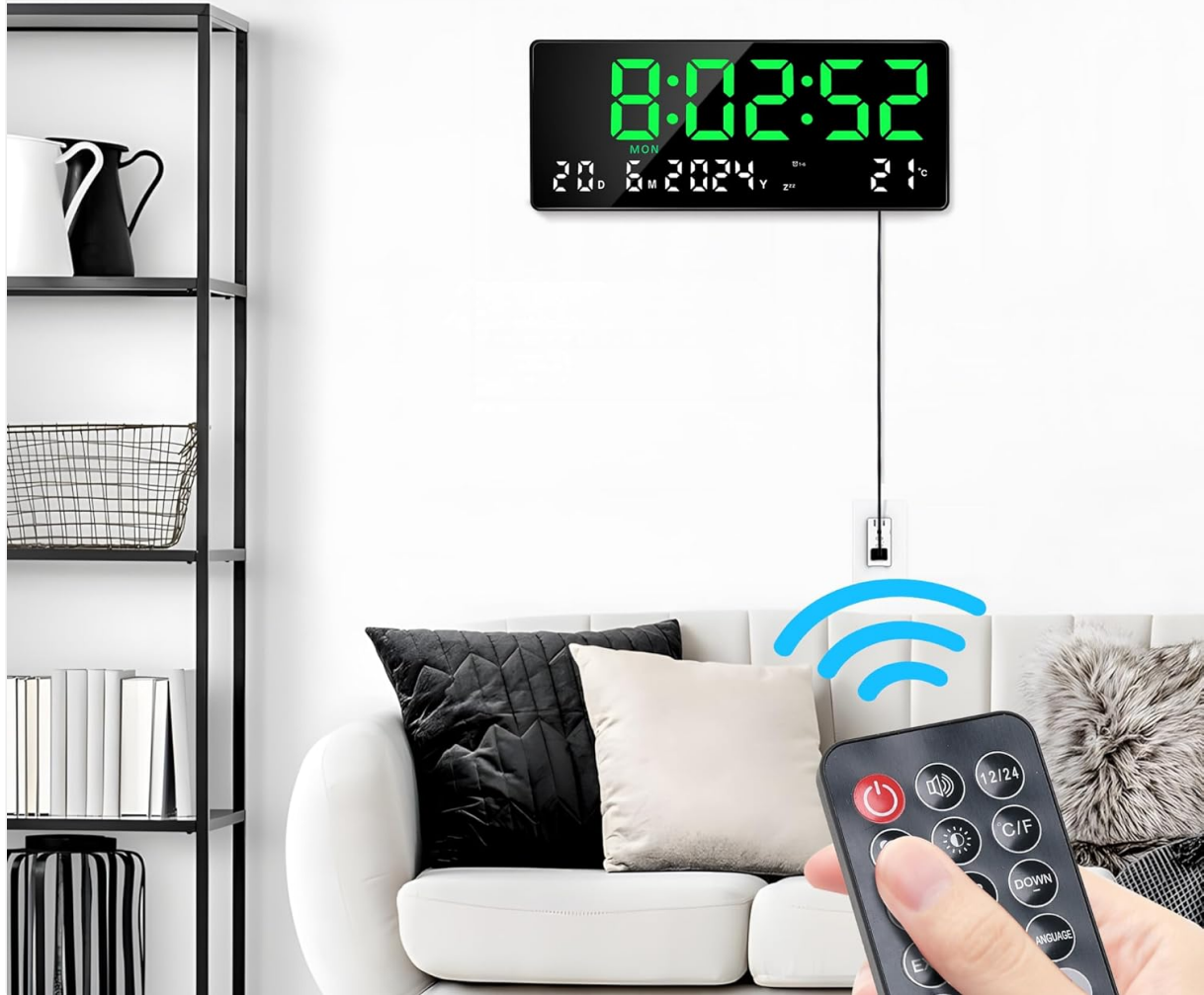
Figure 6.1: Using the remote control to adjust clock settings.

All the settings can be easily done with the remote control