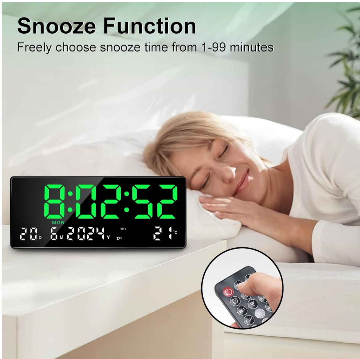
Figure 6.3: Activating the snooze function.

Freely choose snooze time from 1-99 minutes