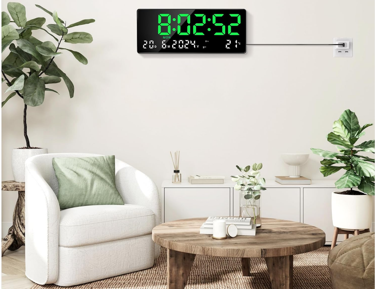
Figure 1.1: Lafocuse Large Digital Wall Clock in a living room environment.