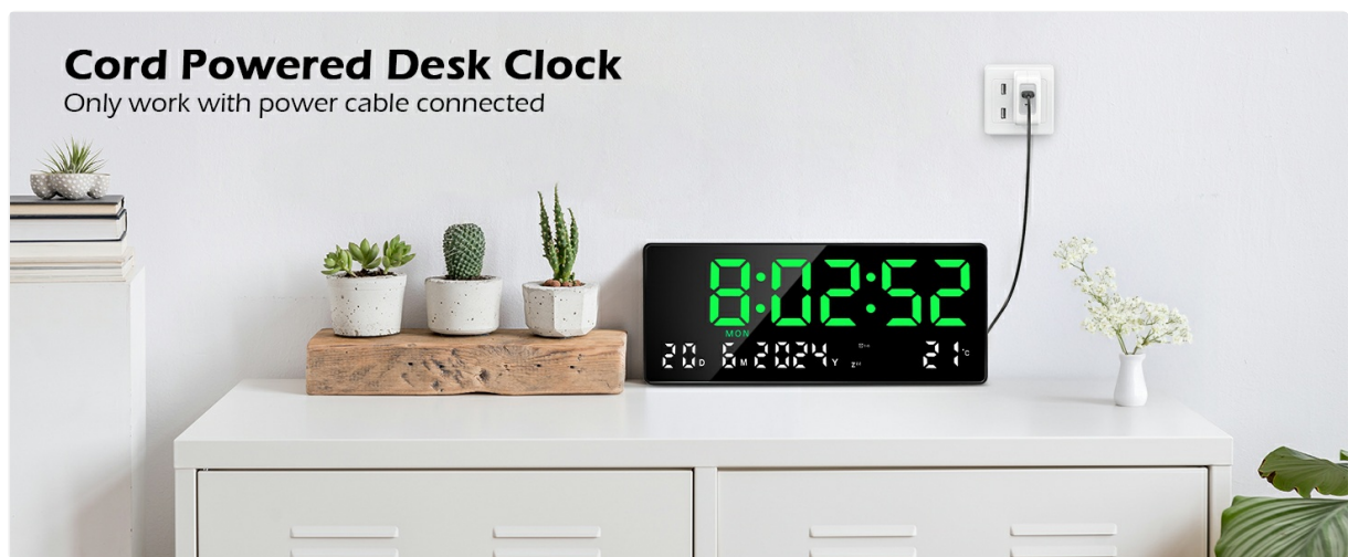
Figure 4.1: Clock powered by cord on a desk.