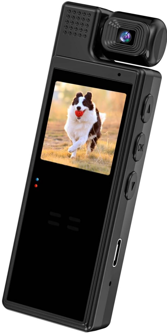
Image: Camera with its 1.3-inch color display active.