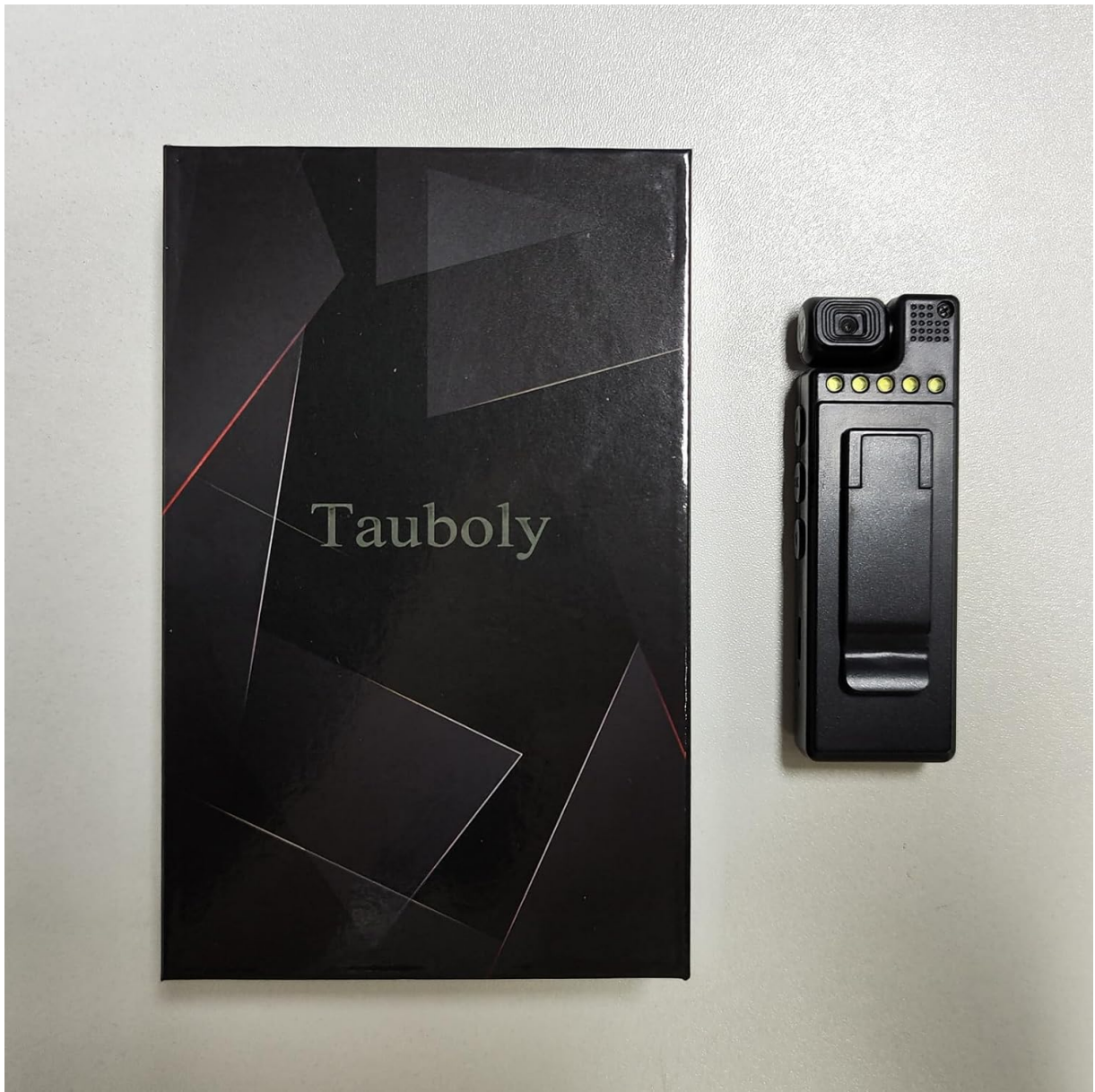
Image: The Tauboly L11 Mini Body Camera, USB cable, and user manual as packaged in the box.