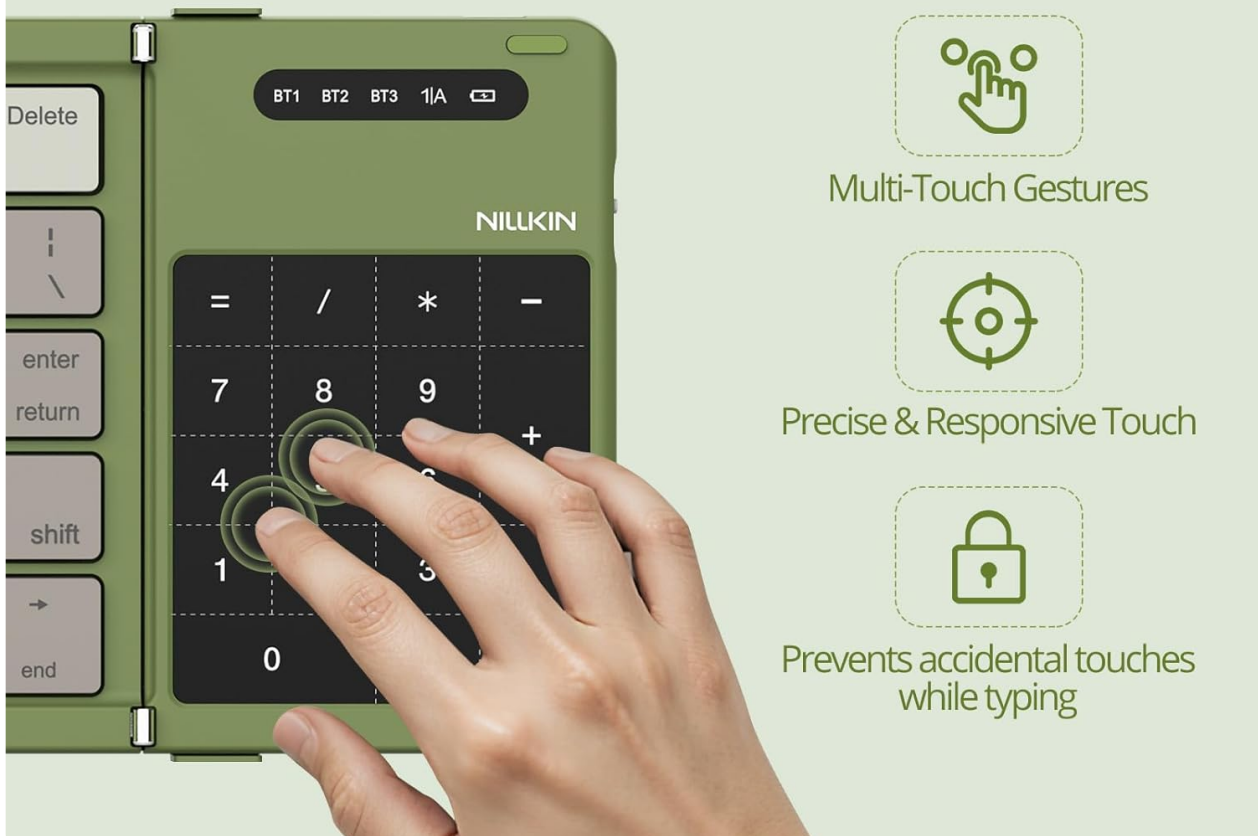
Image: Hand demonstrating touchpad and numeric keypad use.

Not only does it save the hassle of carrying a mouse, it's a boon to some professionals who need a numeric keypad to work.