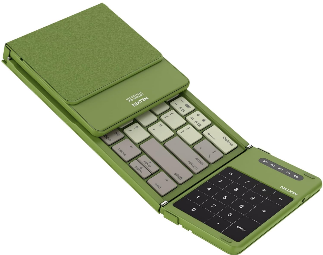
Image: Unfolded view of the Nillkin Pocket Foldable Keyboard.