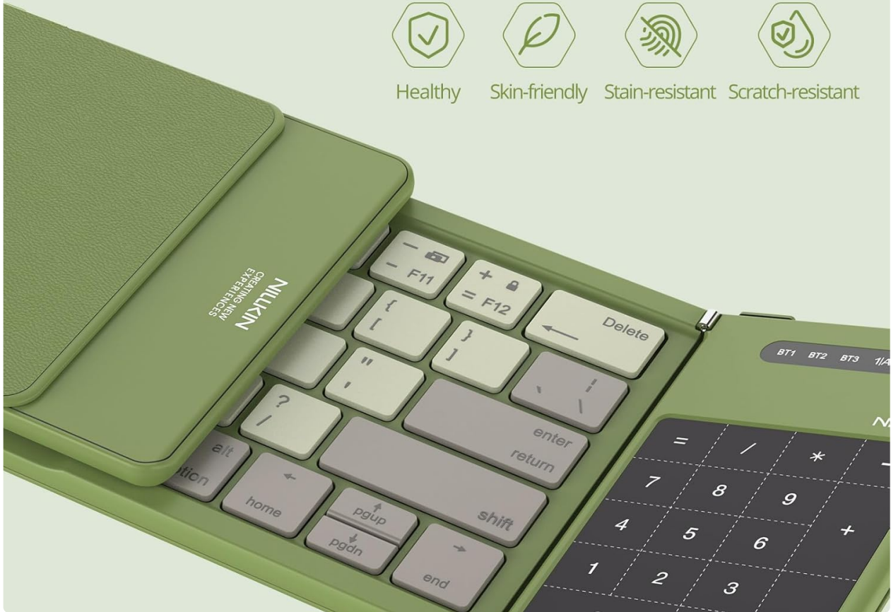
Image: Close-up of the keyboard's silicone back panel, emphasizing its durable and easy-to-clean material.