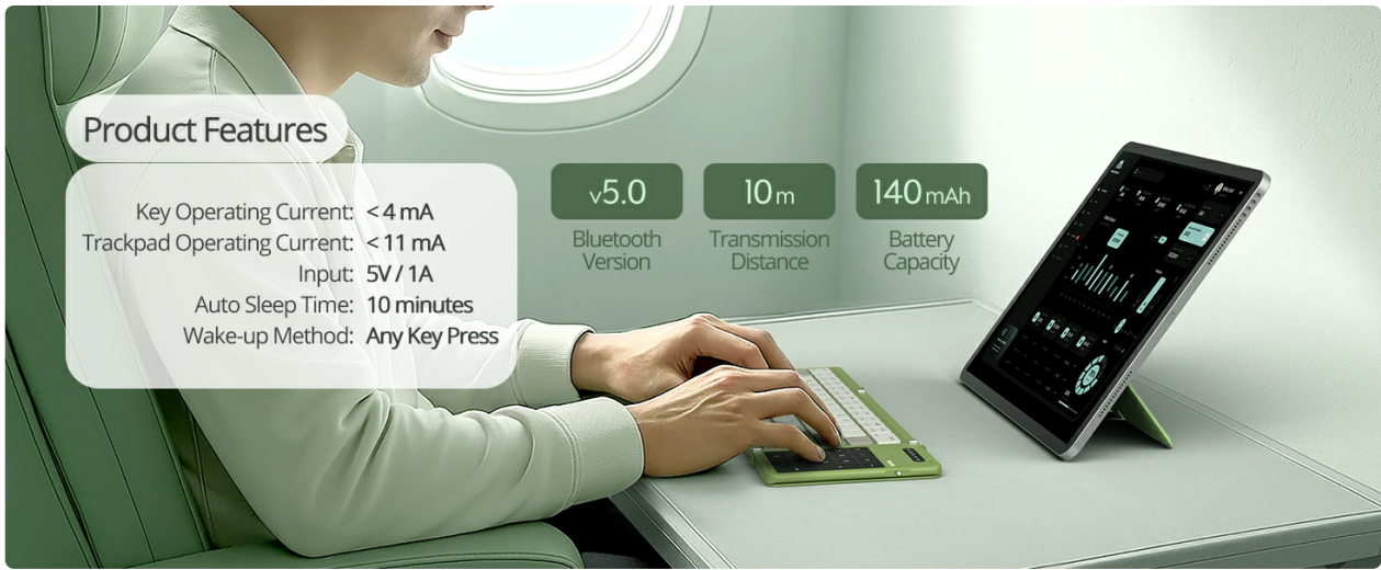
Image: Summary of key product features and specifications.