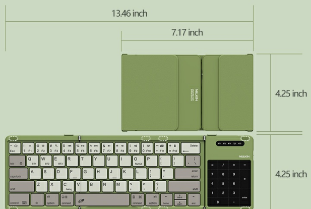
Image: Tri-fold design and dimensions of the keyboard.