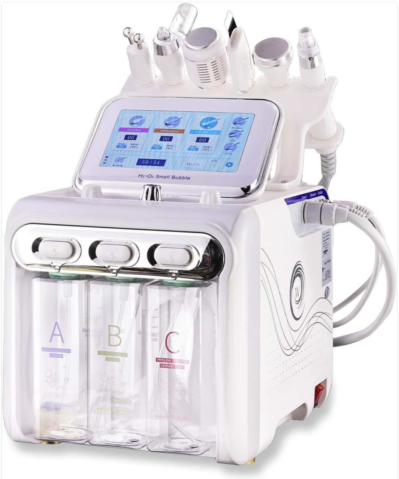
Figure 1: OIJIIE Hydrogen Oxygen Facial Machine LB-G006 main unit with handles and solution bottles.