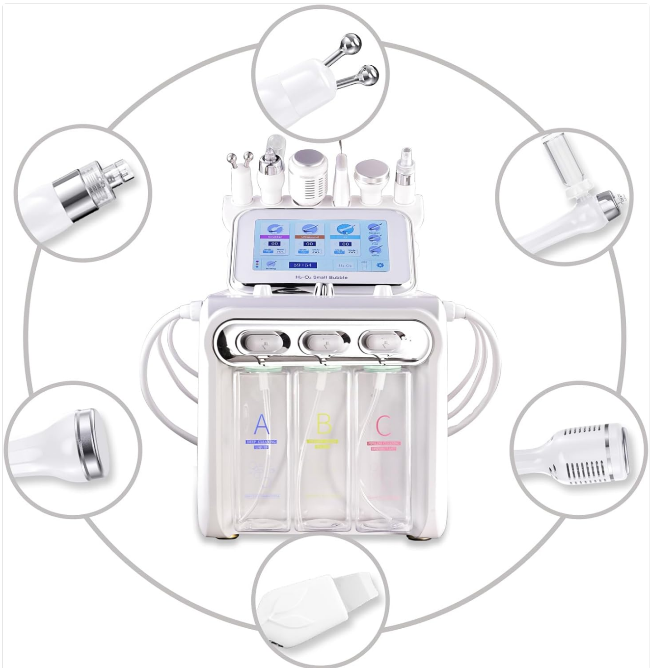
Figure 2: The main unit surrounded by its six distinct functional handles, each designed for specific skin care applications.