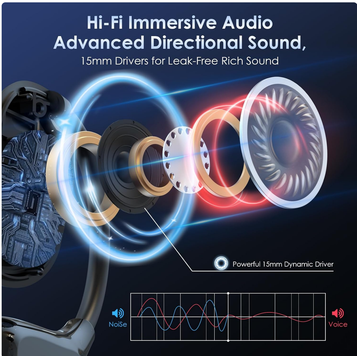
Image: An exploded view of the earbud's internal structure, emphasizing the 15mm dynamic driver for Hi-Fi immersive audio.

The earbuds deliver Hi-Fi immersive audio with advanced directional sound, utilizing 15mm dynamic drivers for rich, leak-free sound. Bluetooth 5.4 ensures a stable connection up to 10 meters (33 feet) with minimal delay for music, calls, and translation functions.