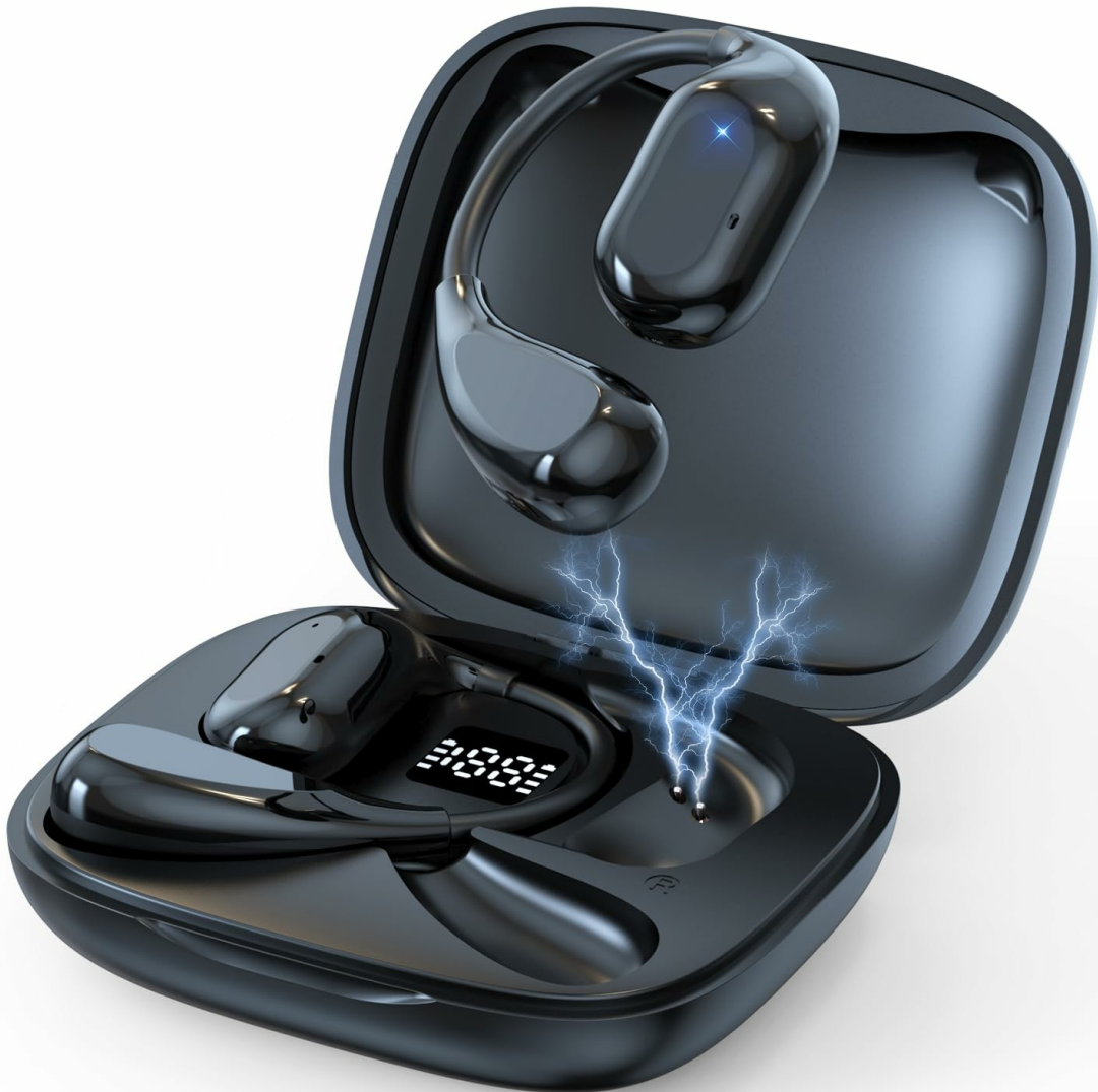
Image: The Olycism AI Translator Earbuds in their charging case.