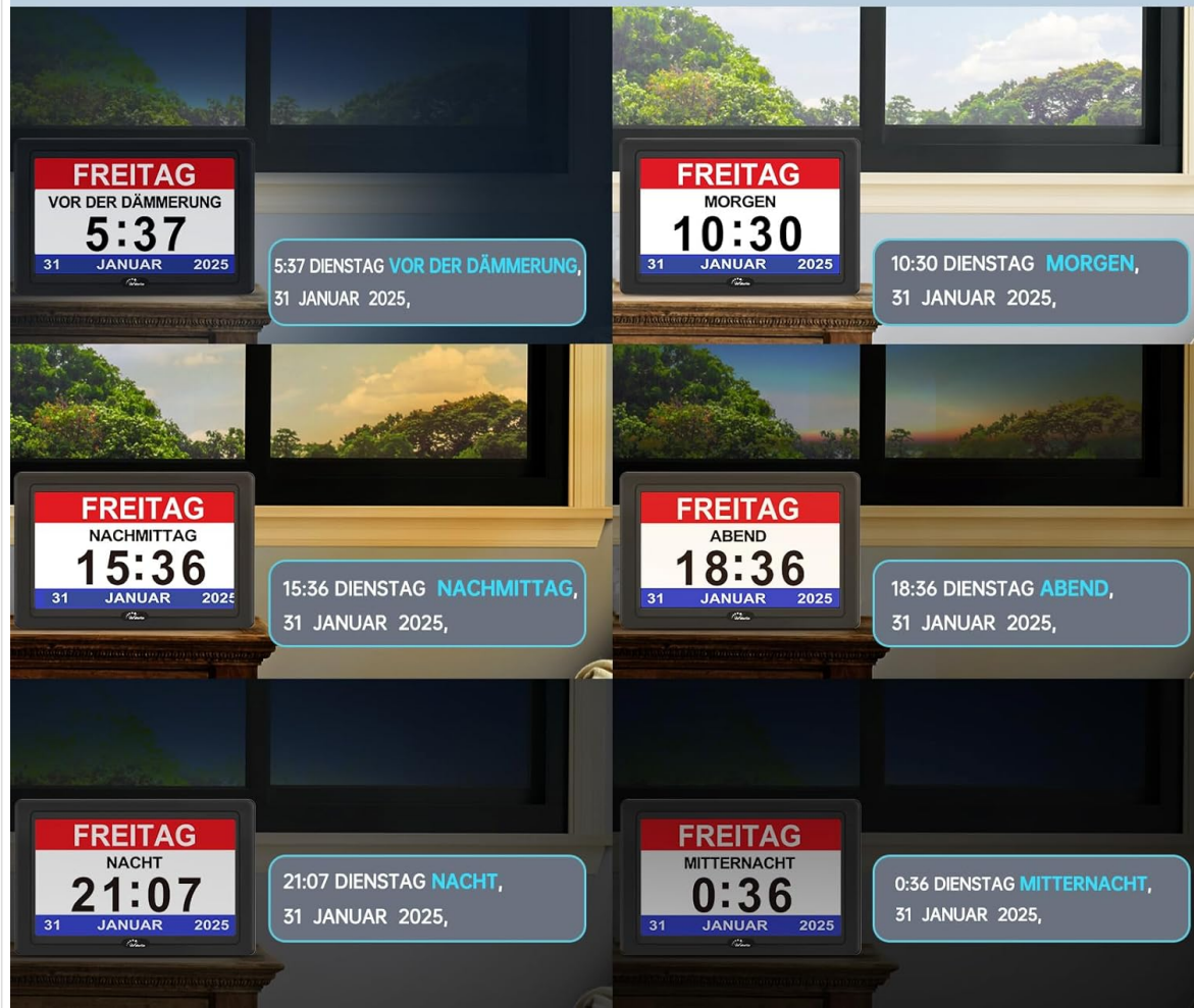
Illustration of the four available screen display modes.