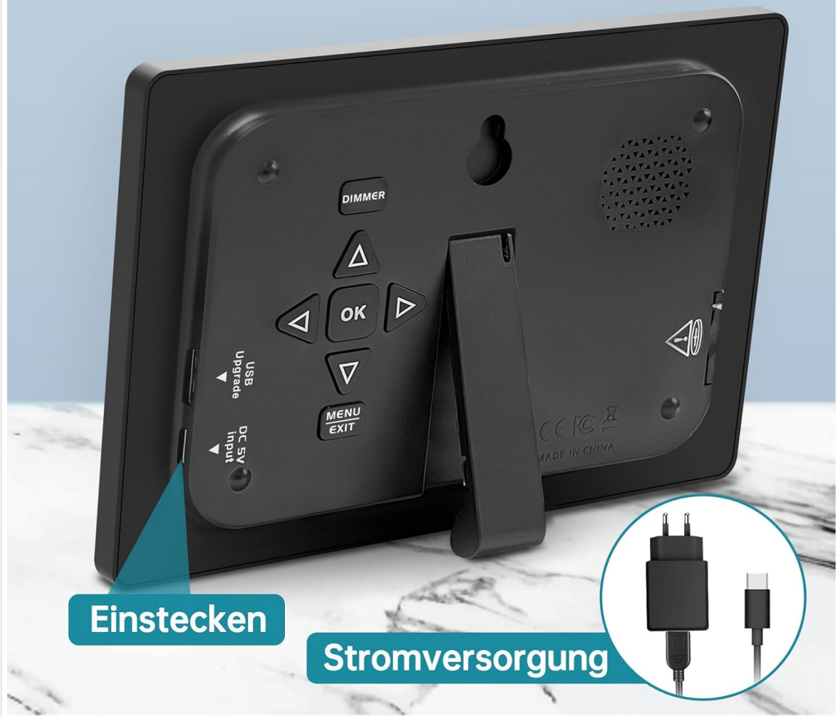
Rear view of the clock with power input and control buttons.