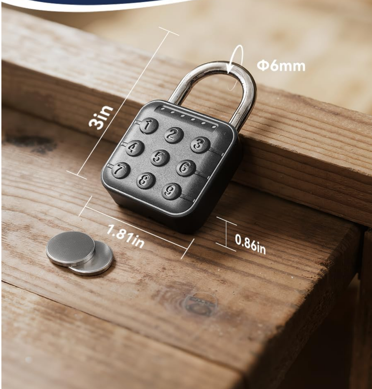
Figure 4.1: Battery compartment and CR2032 batteries for the LOCK-P90.