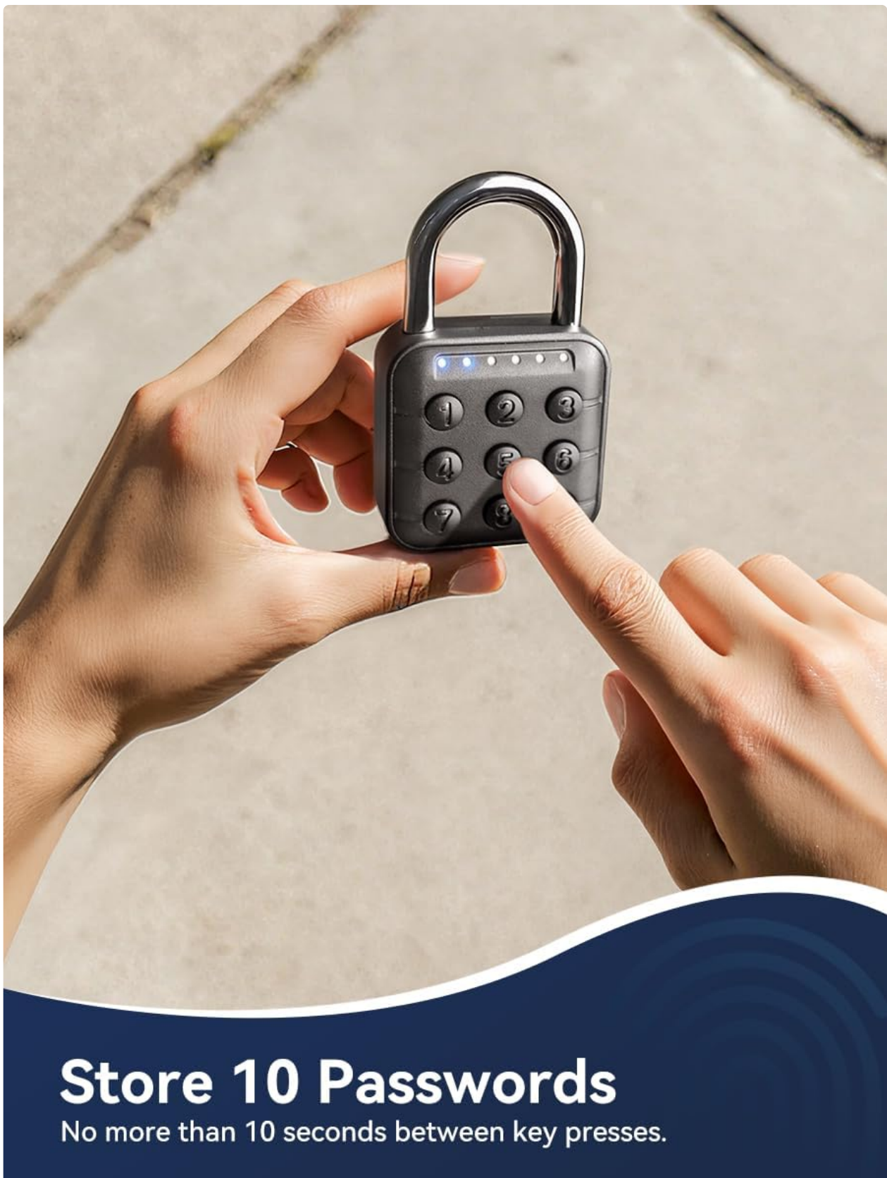
Figure 3.2: Entering a personalized code on the LOCK-P90 keypad.