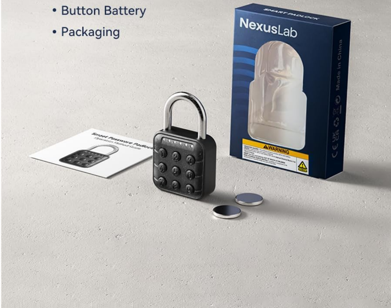
Figure 1.1: Packaging contents of the NexusLab LOCK-P90 Smart Combination Lock.