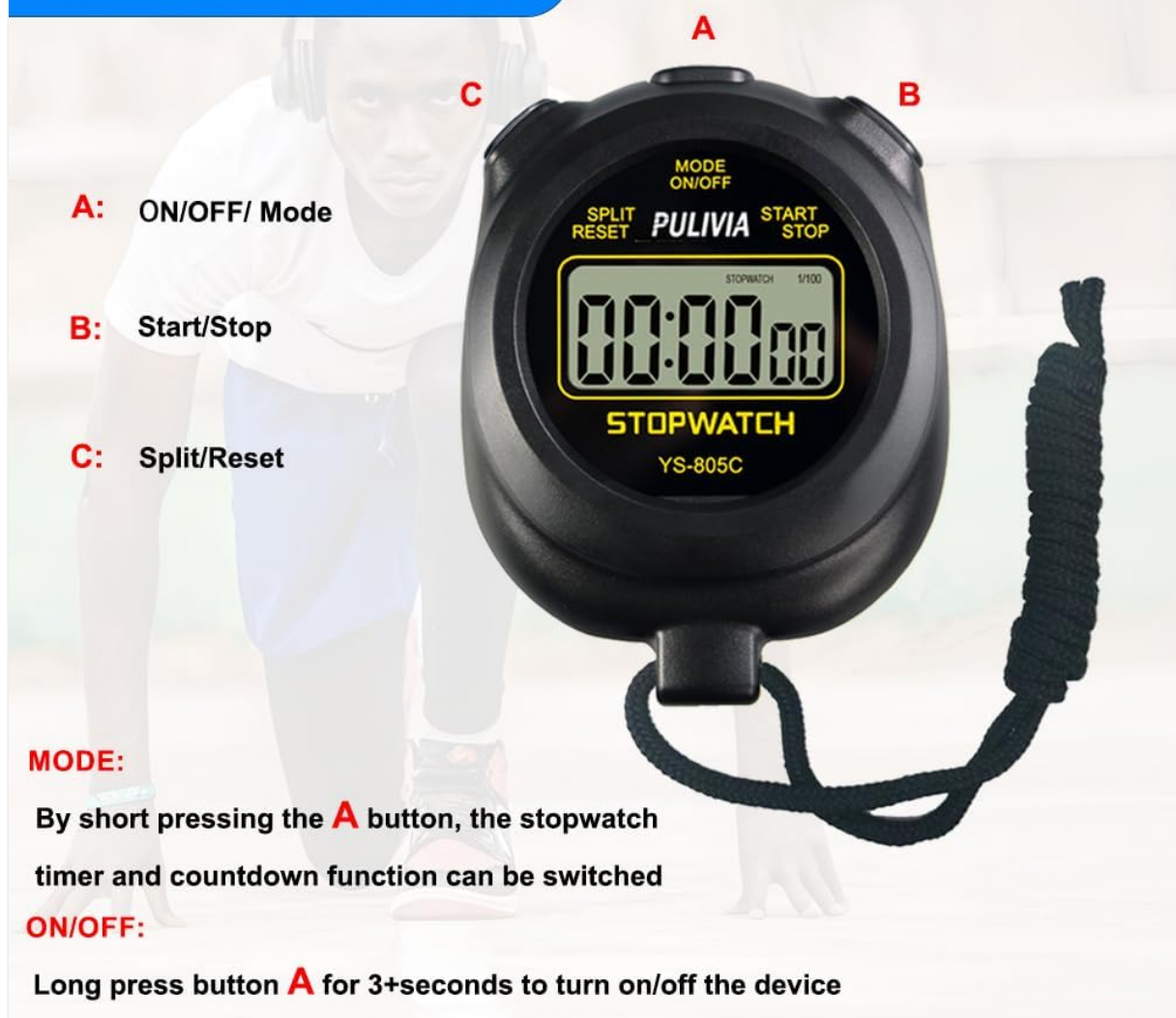
Image 4.1: Button layout and functions. This image labels the three buttons on the stopwatch: A (MODE ON/OFF), B (START/STOP), and C (SPLIT/RESET), along with their primary functions.