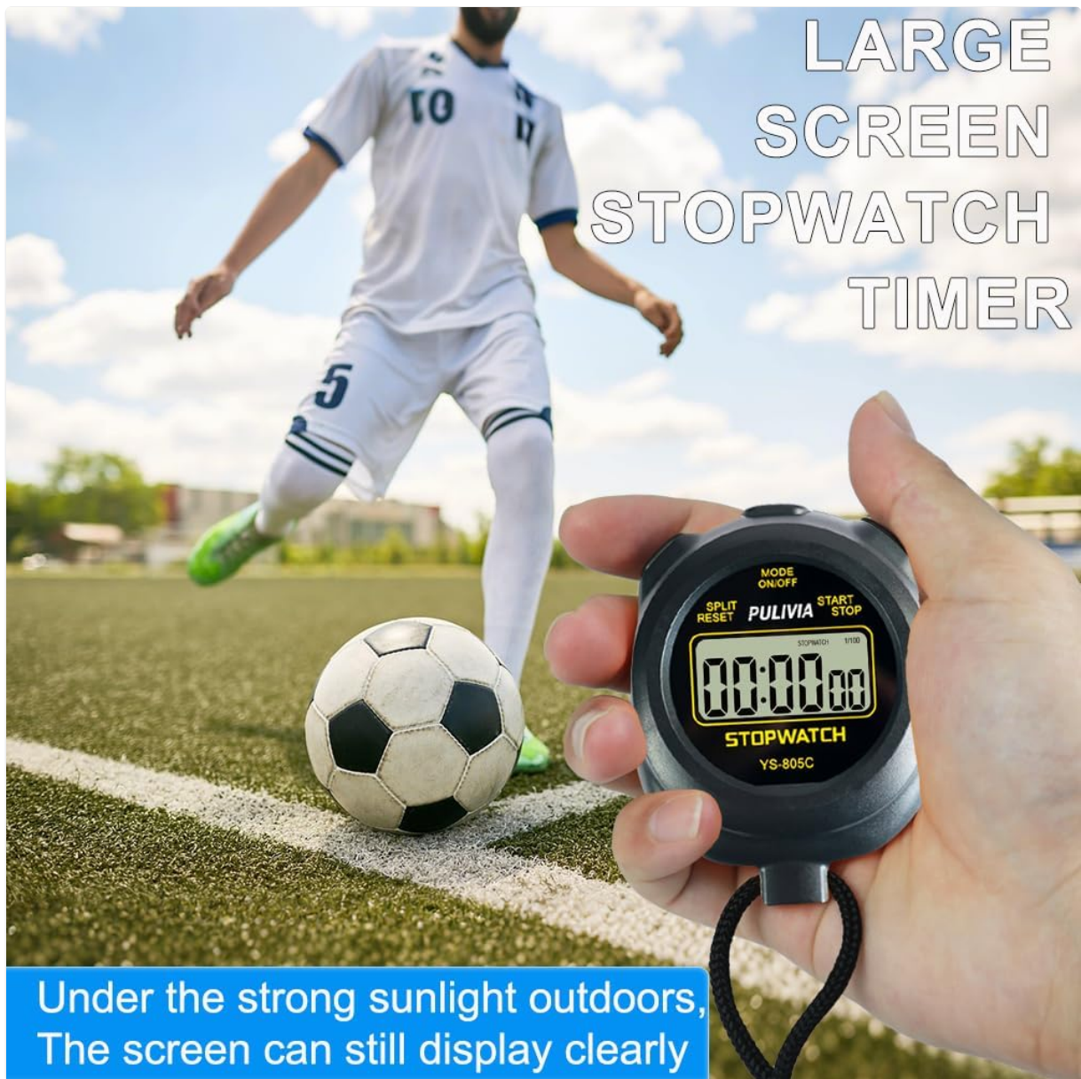
Image 2.2: Large screen visibility of the PULIVIA Stopwatch. This image shows a hand holding the stopwatch on a soccer field, demonstrating that the screen remains clear and readable even under strong outdoor sunlight.