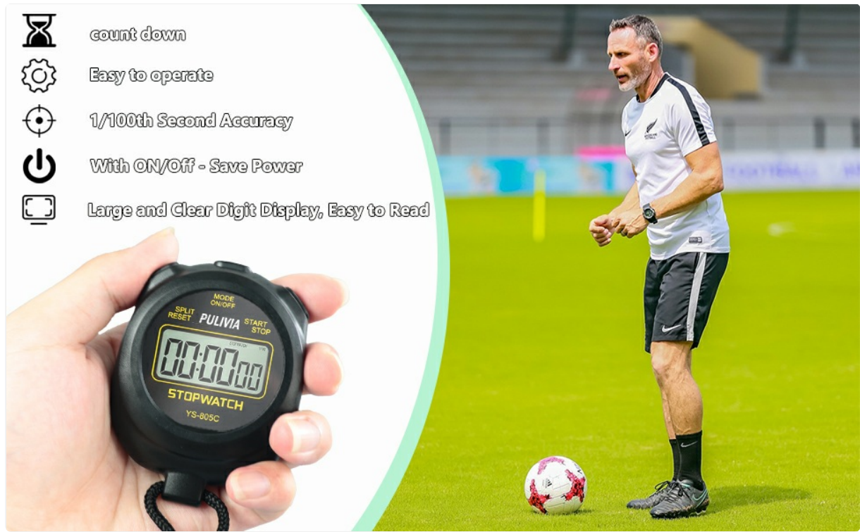
Image 2.1: Key features of the PULIVIA Stopwatch. This image highlights features such as countdown, easy operation, 1/100th second accuracy, ON/OFF function for power saving, and a large, clear digit display. A coach is visible in the background on a soccer field.