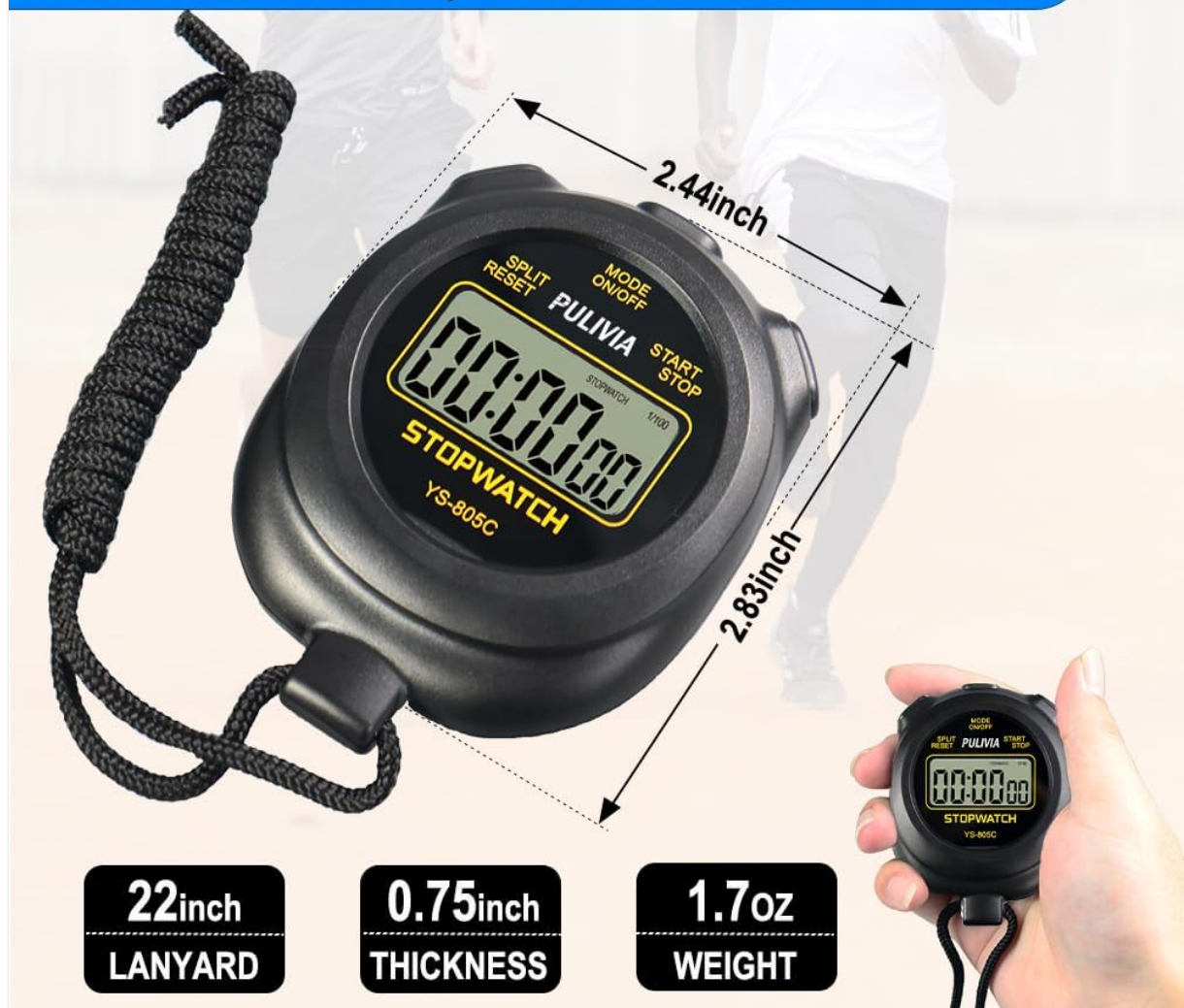
Image 7.1: Dimensions and weight of the PULIVIA Stopwatch. This image illustrates the physical measurements of the stopwatch, including its width (2.44 inches), height (2.83 inches), thickness (0.75 inches), and weight (1.7 oz). It also shows the lanyard length (22 inches).