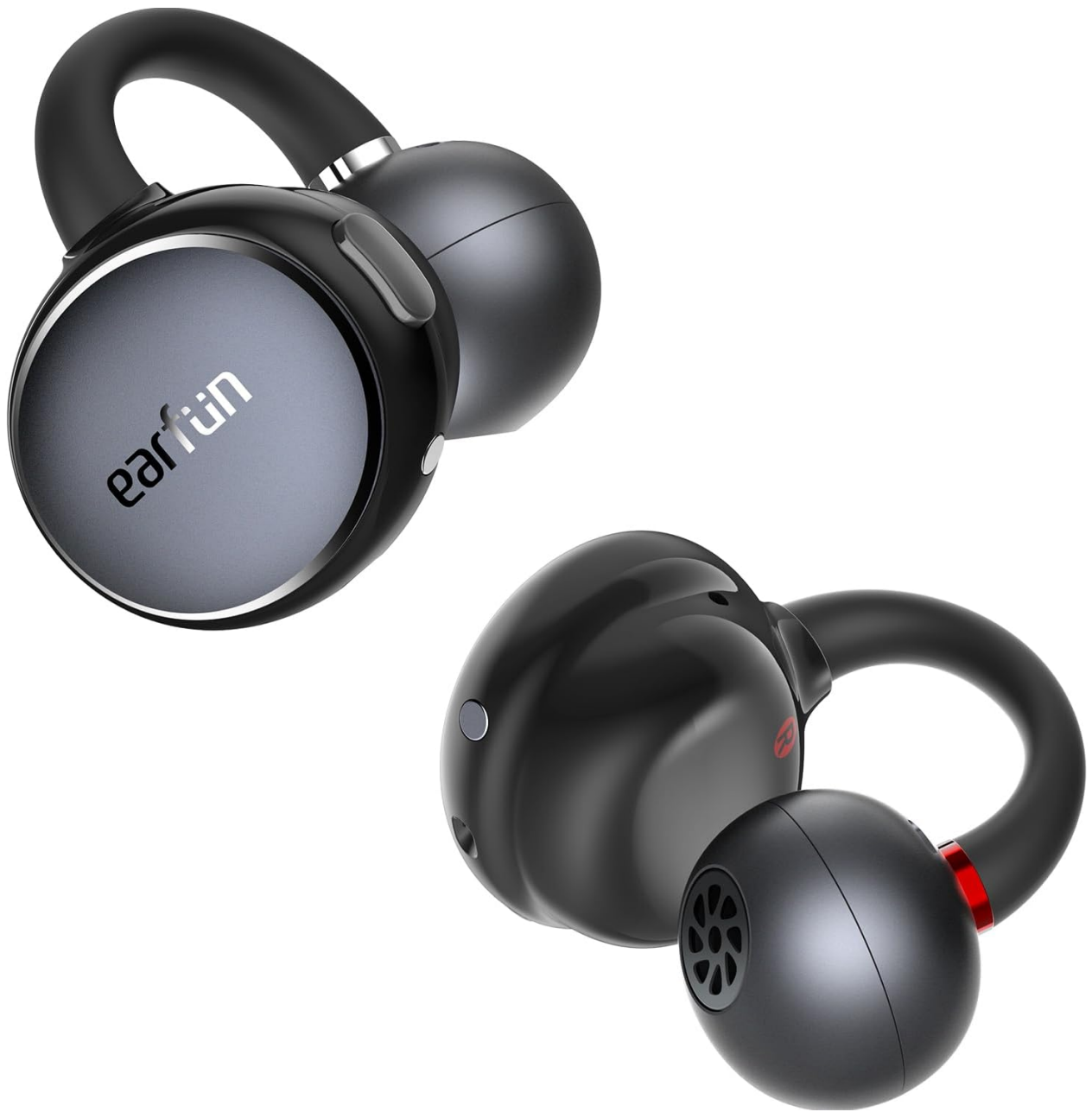
Figure 1: EarFun Clip Open Ear Earbuds and Charging Case.