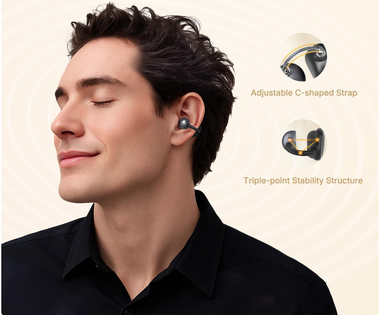
Figure 2: Illustration of the C-Shaped Bridge design for adaptive comfort and secure fit.

Clip-On design for a snug and secure fit