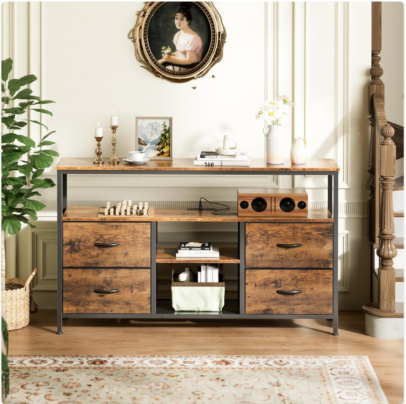
Figure 1: Fully assembled Huuger TV Stand Dresser in a living room setting.