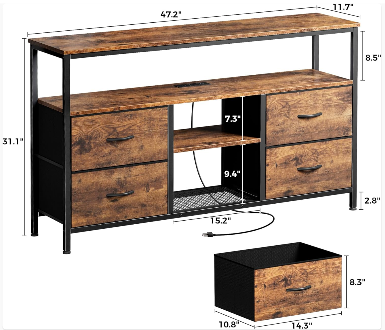
Figure 4: Product dimensions for planning your space.