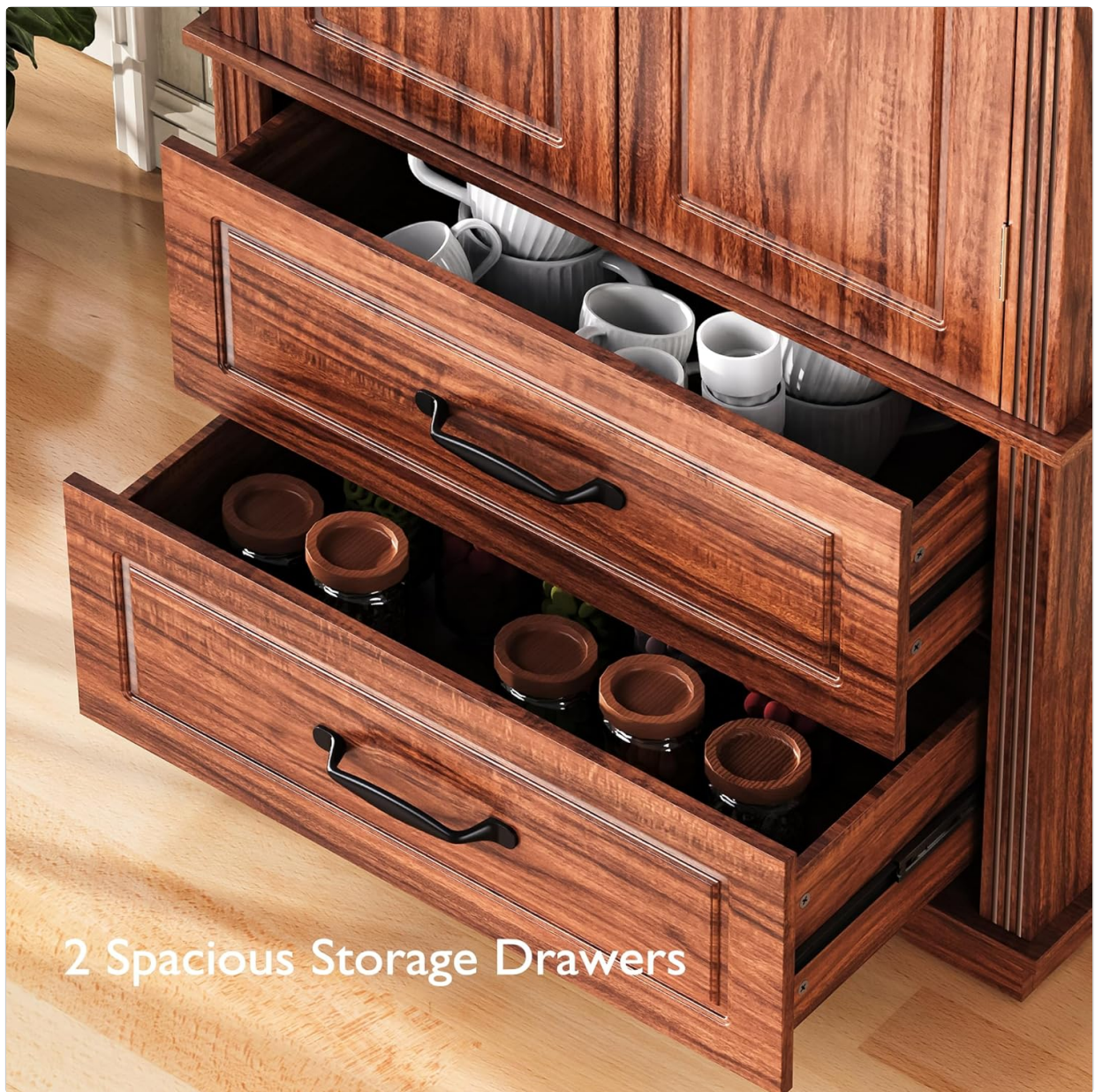
Image: The two spacious storage drawers, shown open with items inside.