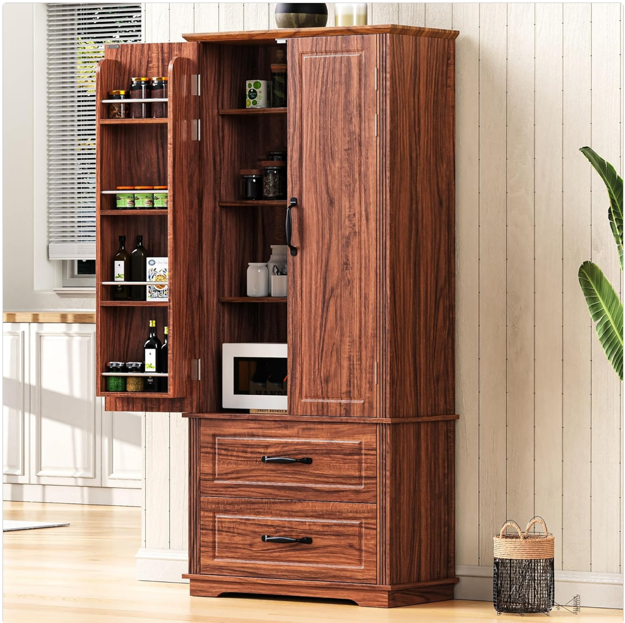
Image: Interior view of the pantry cabinet showcasing adjustable shelves, door racks, and lower drawers.