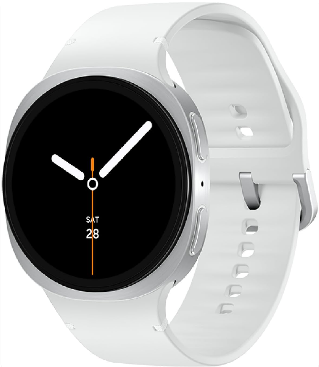
Figure 1: Samsung Galaxy Watch 8 (2025) 44mm Bluetooth Smartwatch.

This manual provides essential information for setting up, operating, maintaining, and troubleshooting your new smartwatch.