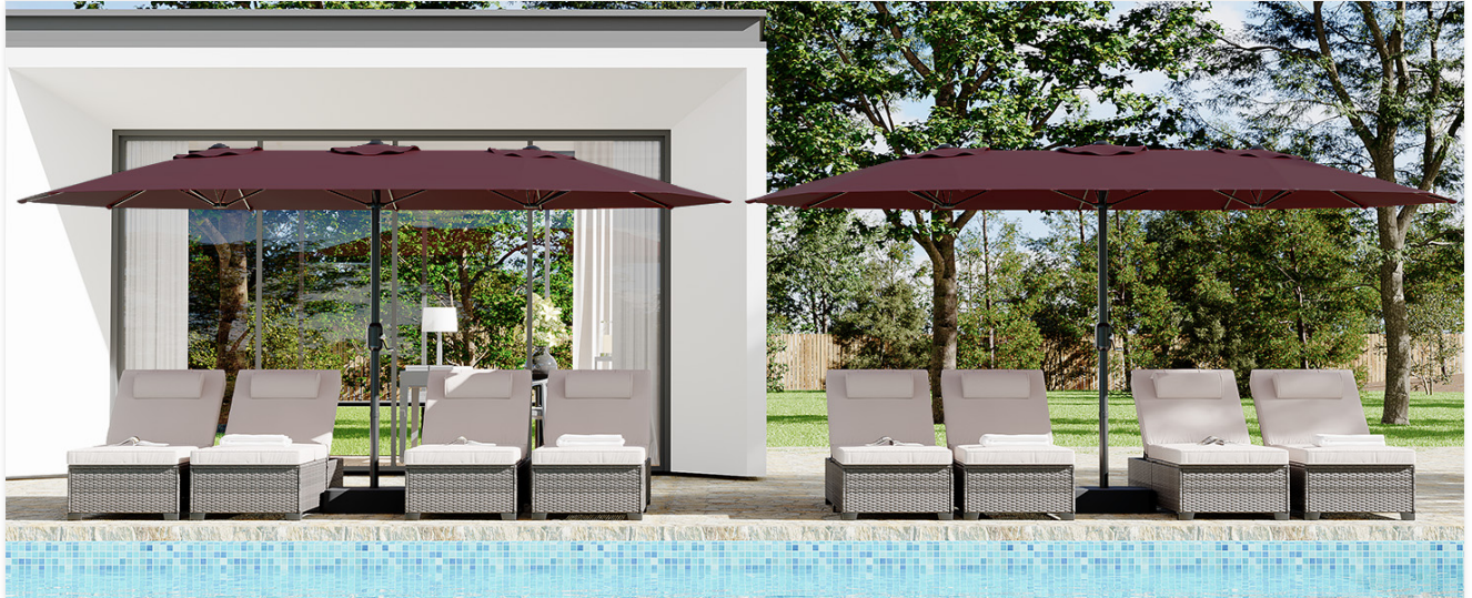
Key features including the crank lift system, double layer vent, and sandbag base.