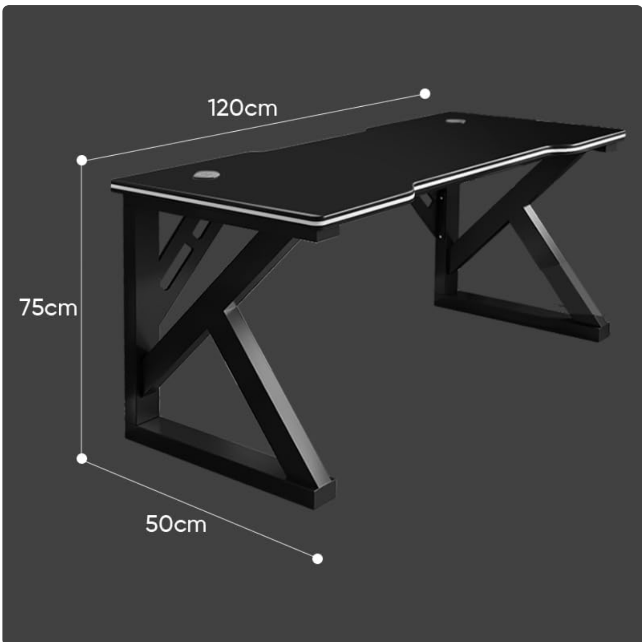
Image: Dimensions of the Deli Gaming Table.