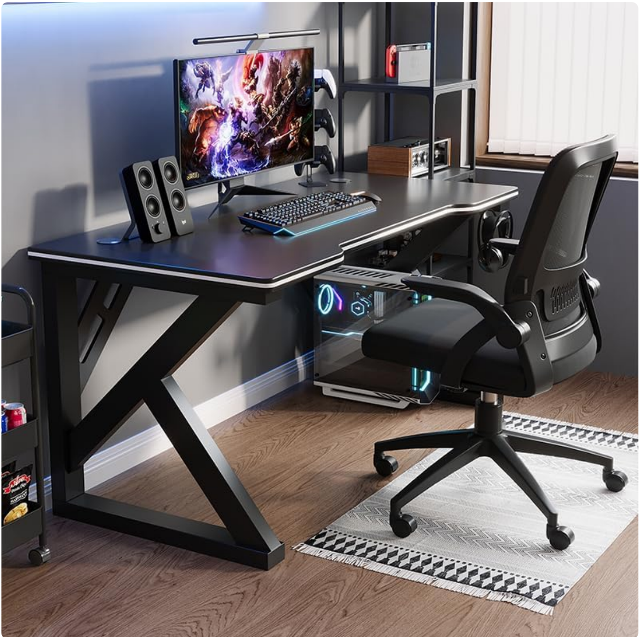
Image: A gaming setup on the Deli Gaming Table, illustrating its spacious surface.