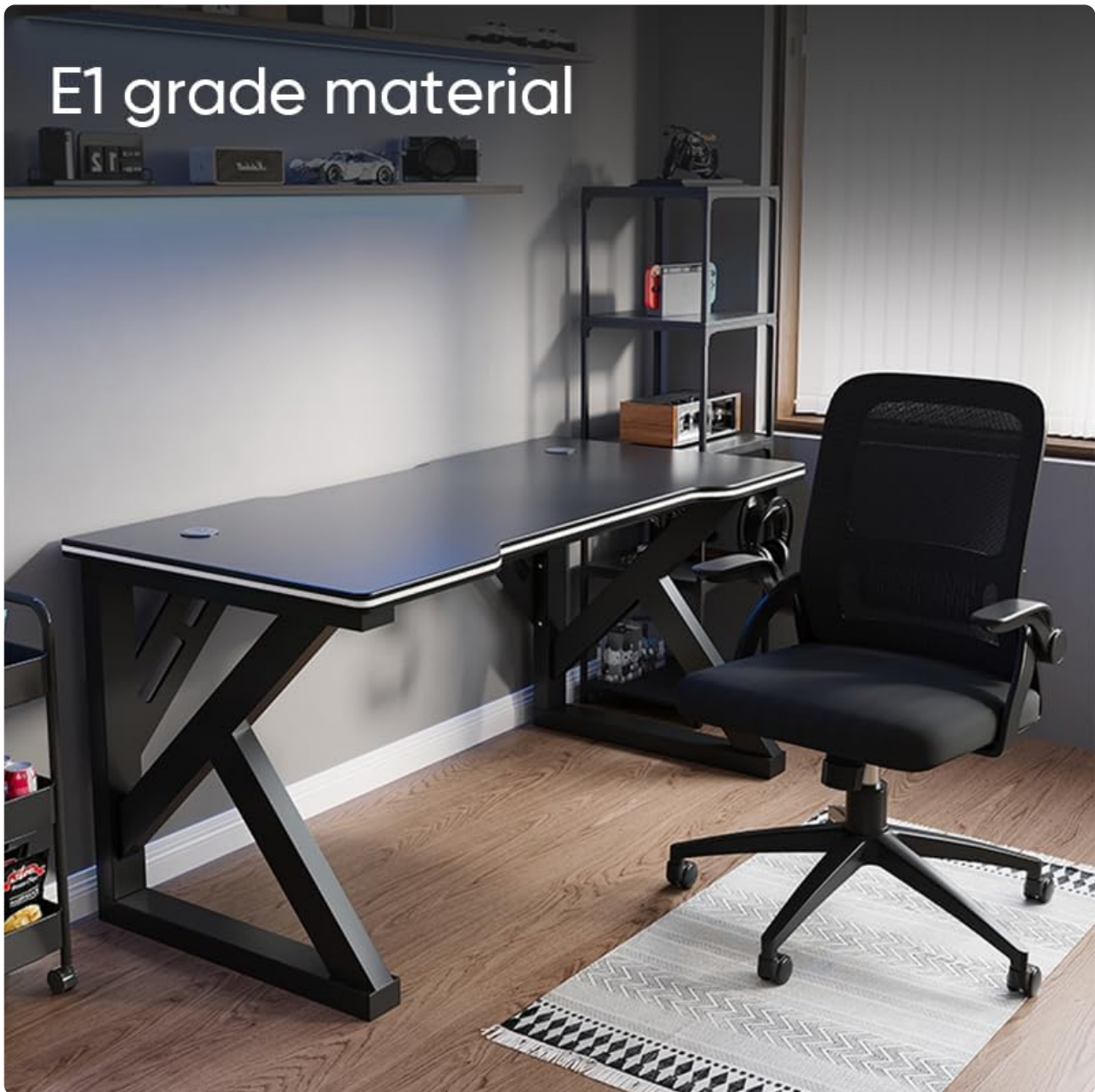
Image: The Deli Gaming Table highlighting E1 grade material.