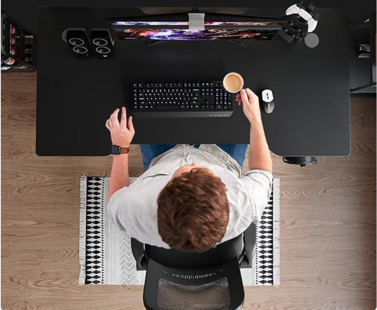
Image: Top-down view of a user at the Deli Gaming Table, highlighting ergonomic design.

Comfortable and does not push the abdomen