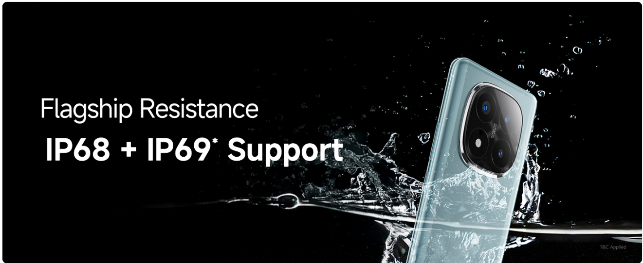
Figure 7: Device demonstrating IP68 water resistance.