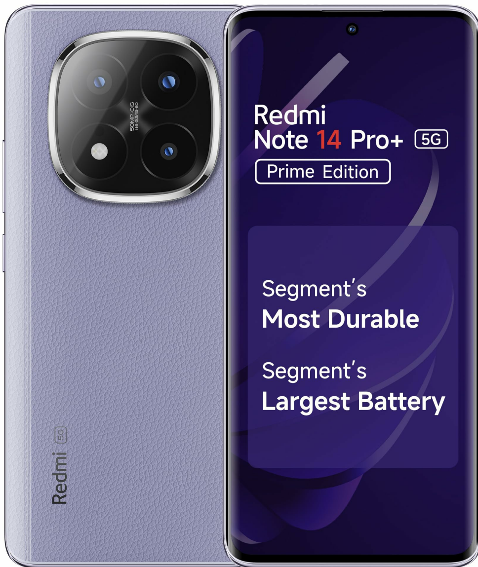
Figure 1: Redmi Note 14 Pro+ 5G Prime Edition smartphone.