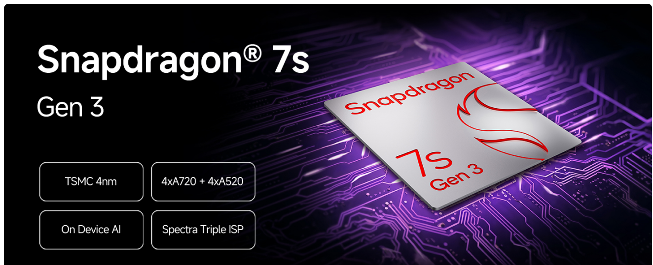
Figure 6: The Snapdragon 7s Gen 3 processor.

Powered by the Snapdragon 7s Gen 3 processor and running on Android 14 with Xiaomi HyperOS, your device offers smooth performance for daily tasks and gaming. The 8GB RAM ensures efficient multitasking. Explore the features of Xiaomi HyperOS for a personalized user experience.