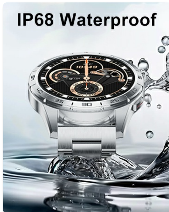
Image: The SUNKTA SML3 Smart Watch displaying heart rate, blood oxygen, and sleep monitoring data.