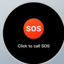
SOS Emergency Contact