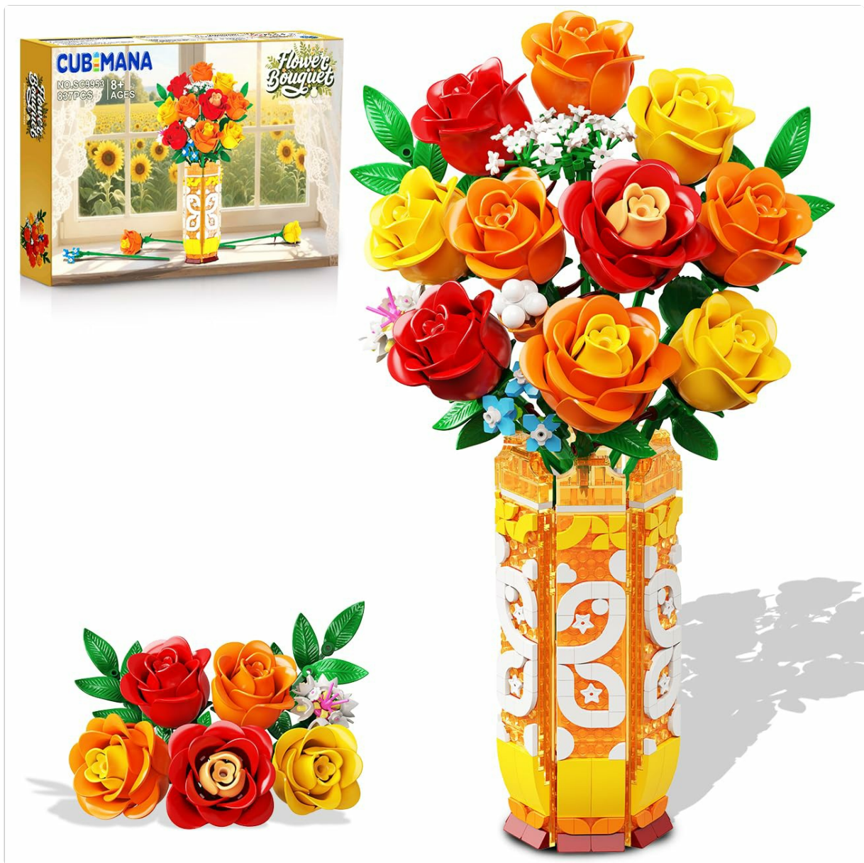
Image 1.1: The fully assembled CUBIMANA Flower Bouquet Building Set, showcasing the colorful roses and decorative vase.