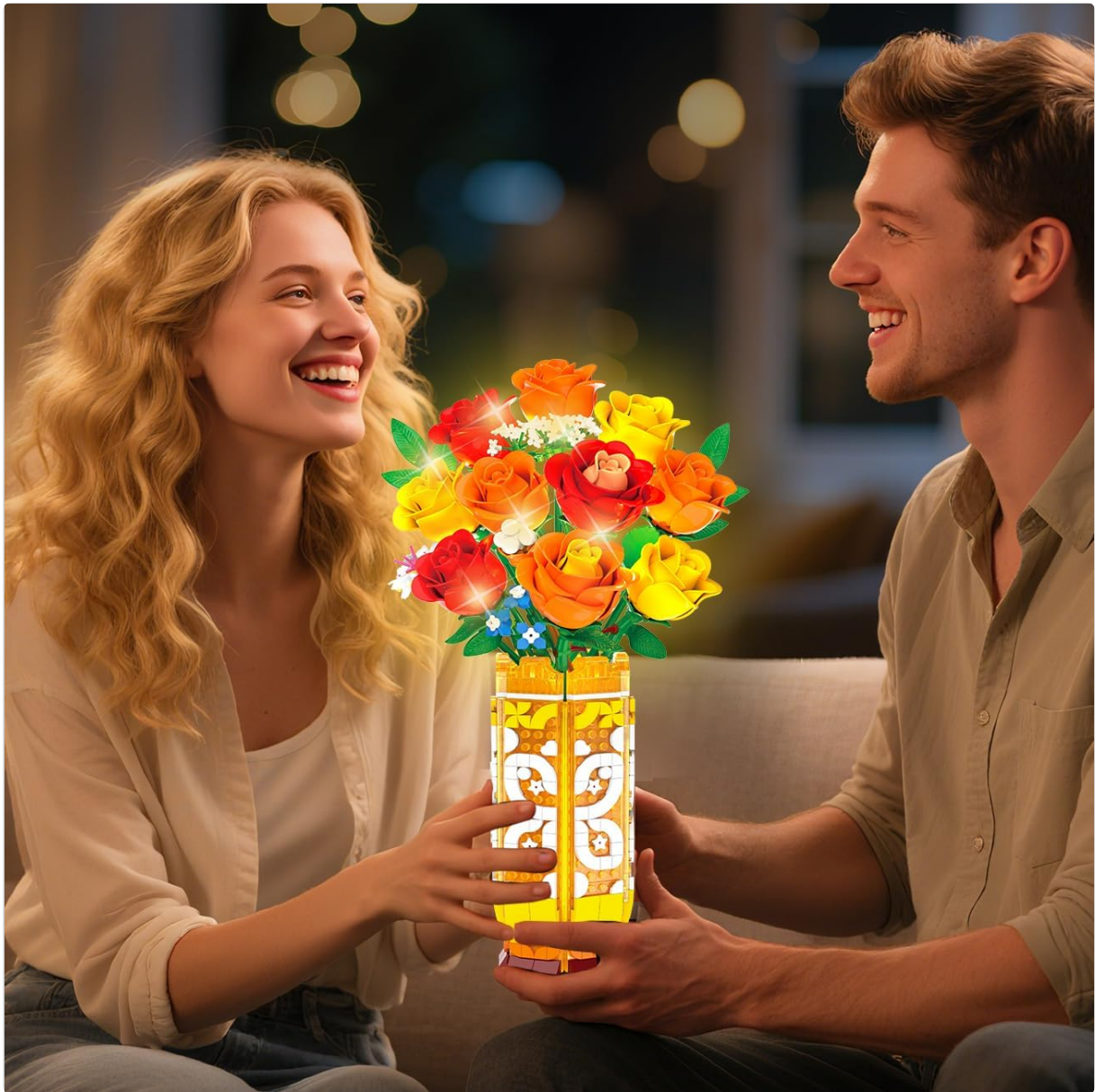
Image 4.1: The CUBIMANA Flower Bouquet illuminated by the integrated LED light strip, creating a warm glow.