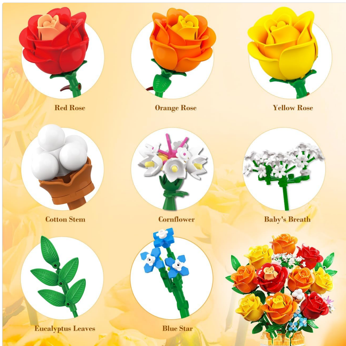
Image 3.2: Close-up view of the different types of roses, baby's breath, and other floral elements that can be constructed.

Your browser does not support the video tag.