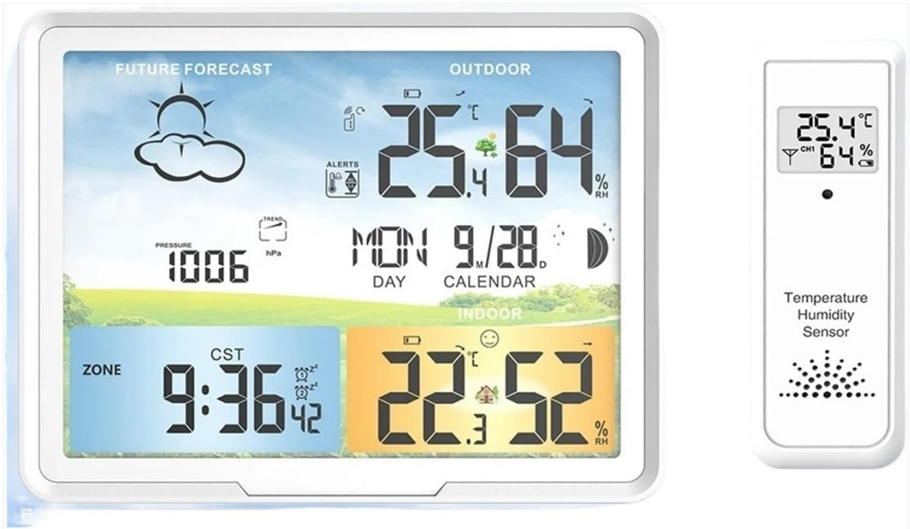
Image: Main Unit and Wireless Sensor. This image displays the primary weather station unit with its large digital display and the compact wireless outdoor sensor. The main unit shows future weather forecasts, current outdoor and indoor temperature and humidity, barometric pressure, date, time, and indoor temperature and humidity. The sensor displays its current temperature and humidity readings.

The main unit's display is designed for clear readability, presenting information such as future weather forecasts, current outdoor and indoor temperature and humidity, barometric pressure, date, and time. The wireless sensor is compact and designed for outdoor placement to accurately measure external environmental conditions.