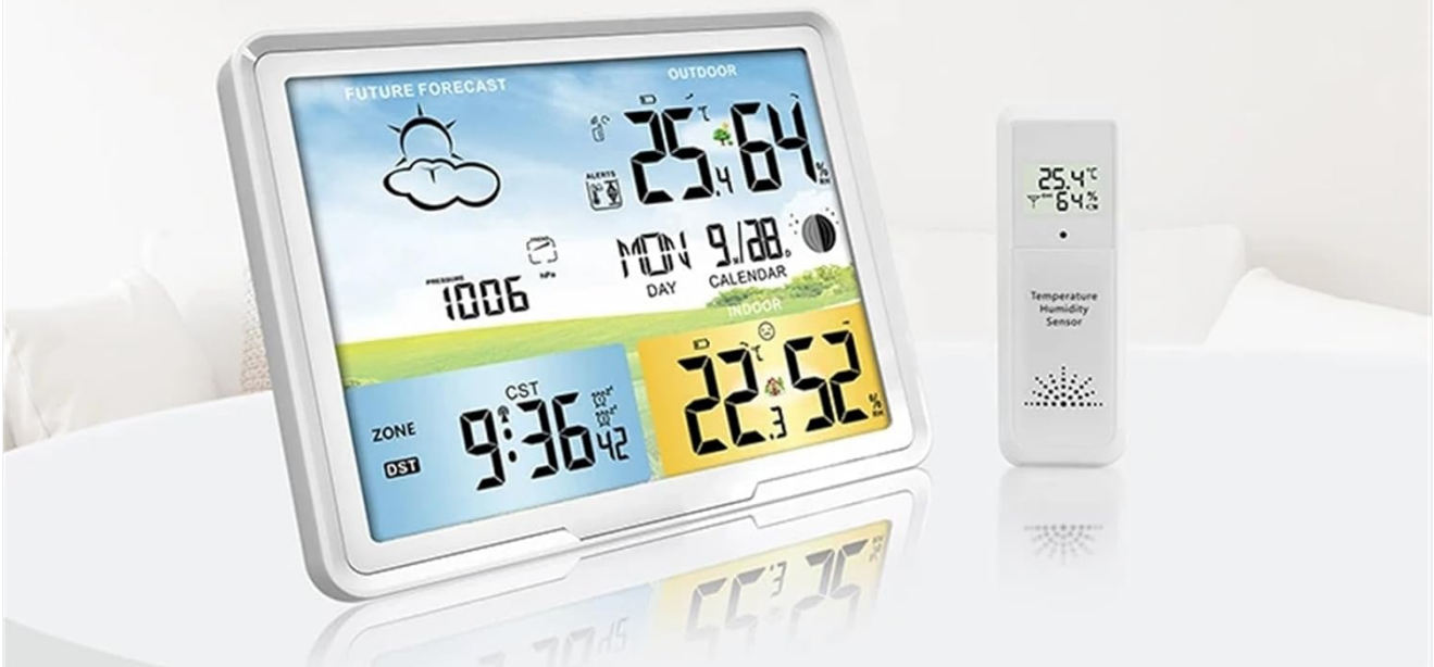
Image: Remote Monitoring Capability. This image demonstrates the ability of the weather station to remotely monitor temperature and humidity. It shows the main unit and sensor, with smaller images above suggesting various locations where the wireless sensor can be placed, such as a refrigerator, car interior, or wine cellar, to monitor conditions remotely.