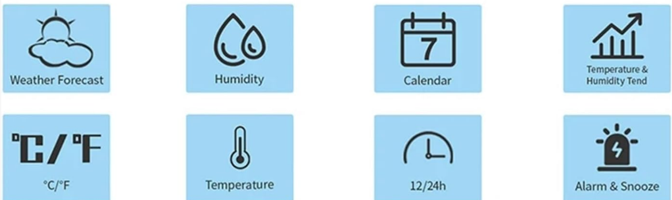
Image: Dimensions and Feature Icons. This image provides the physical dimensions of both the main weather station unit (172mm x 132mm x 23mm) and the wireless sensor (126mm x 43.2mm x 23.6mm). Below the dimensions, a series of icons visually represent key features: Weather Forecast, Humidity, Calendar, Temperature & Humidity Trend, °C/°F, Temperature, 12/24h time format, and Alarm & Snooze.