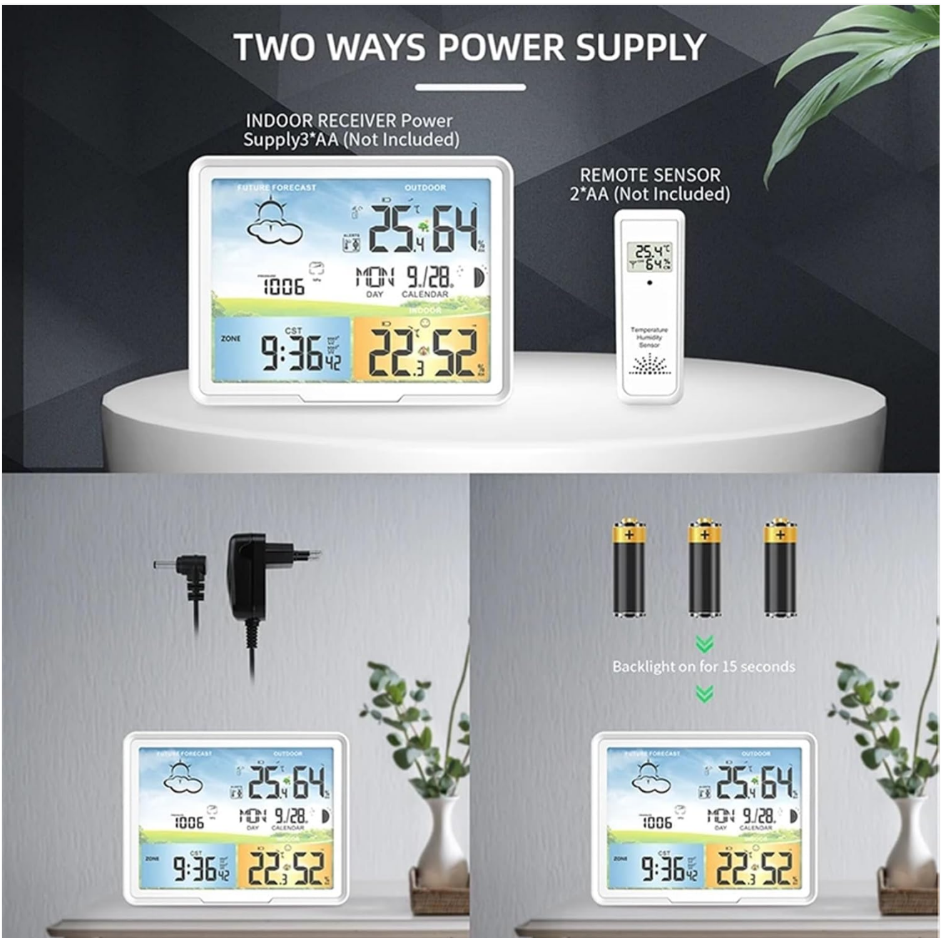
Image: Power Supply Options. This image illustrates the two methods of powering the weather station: using the USB power cord for continuous operation and using AAA batteries for portable use, which results in the backlight turning off after 15 seconds to save power. It also shows the battery requirement for the remote sensor (2*AA).