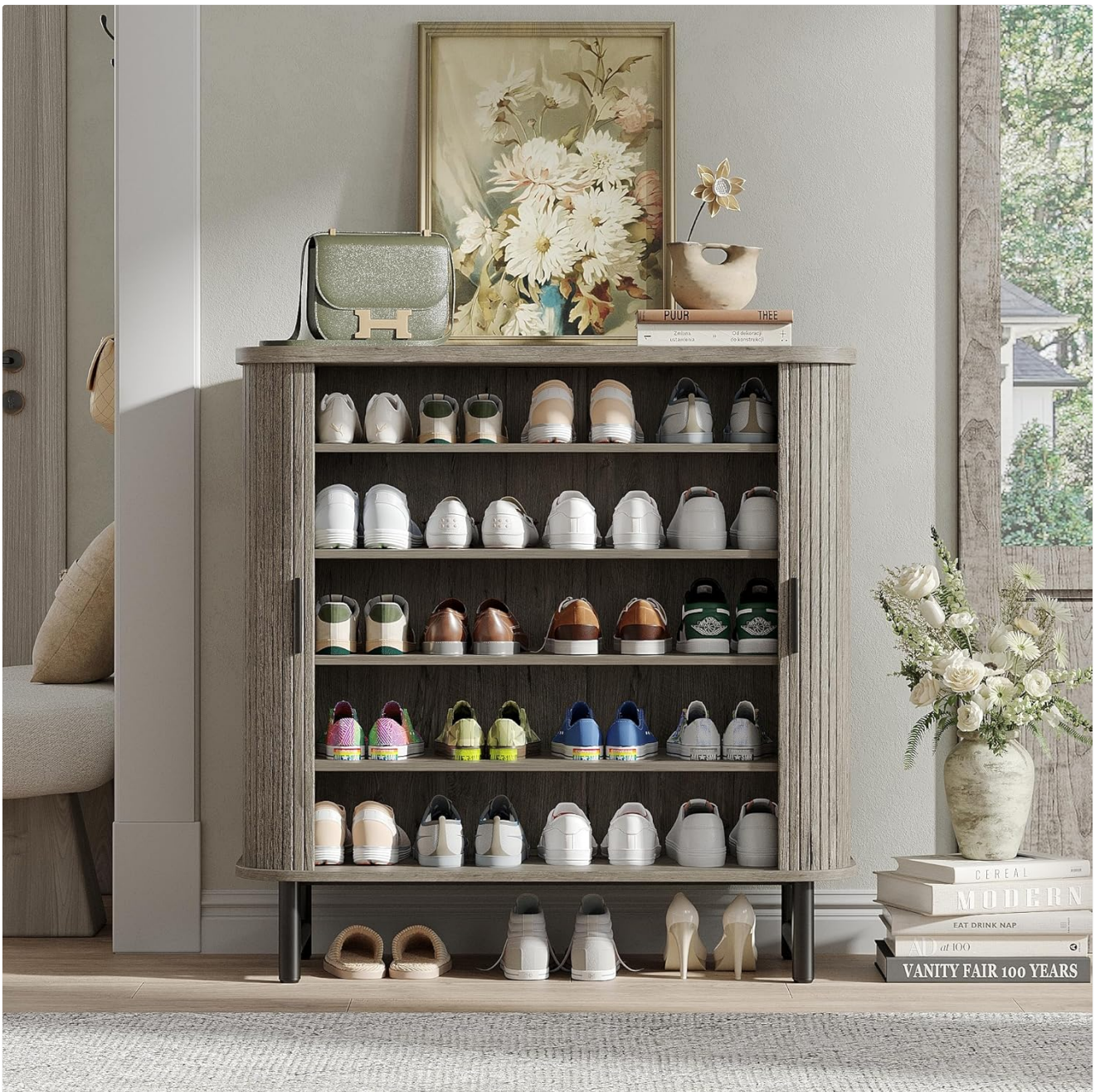
Figure 6: Internal storage capacity. This image shows the cabinet with its doors fully open, revealing multiple pairs of shoes neatly organized on the adjustable shelves, demonstrating its ample storage capabilities.