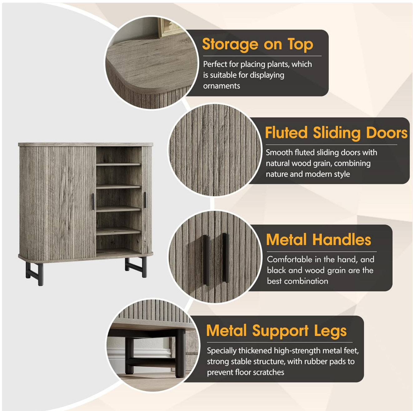
Figure 2: Close-up views highlighting the cabinet's top storage area, the texture of the fluted sliding doors, the design of the metal handles, and the sturdy metal support legs.

feet with rubber pads ensure stability and floor protection.