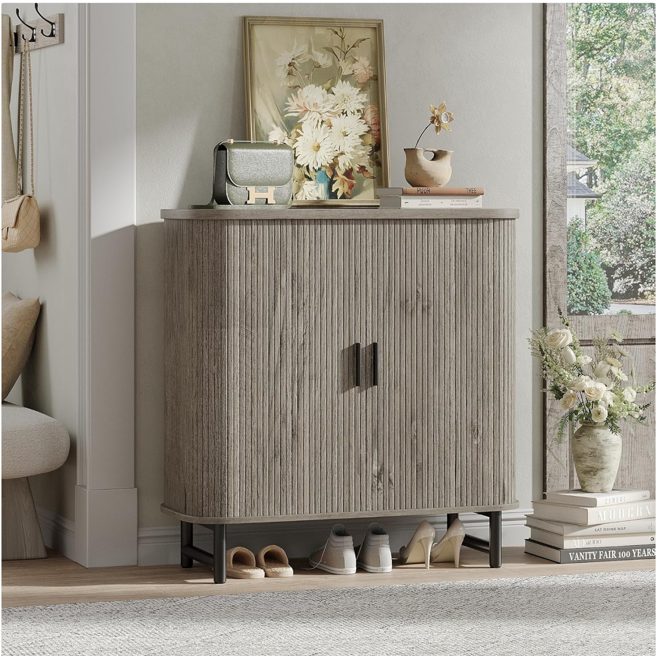
Figure 1: The Maupvit Shoe Storage Cabinet in a typical entryway setting, showcasing its closed appearance and integration into home decor.