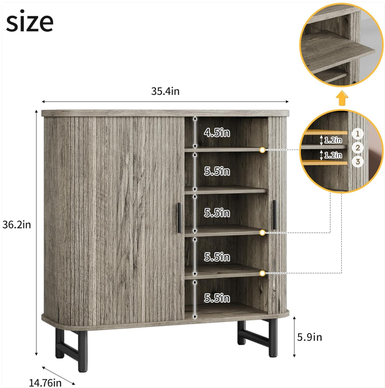
Figure 5: Dimensions and adjustable shelf details. This diagram provides precise measurements of the cabinet and illustrates the adjustable nature of the internal shelves, highlighting the three possible height settings for each movable partition.

To adjust a shelf, carefully lift it and reposition it into the desired slot. You can also remove partitions entirely to create larger compartments for taller items. Additionally, there is a top storage space suitable for displaying ornaments or handy items, and a special heightened space at the bottom for slippers or frequently used shoes, which also facilitates easy cleaning underneath.