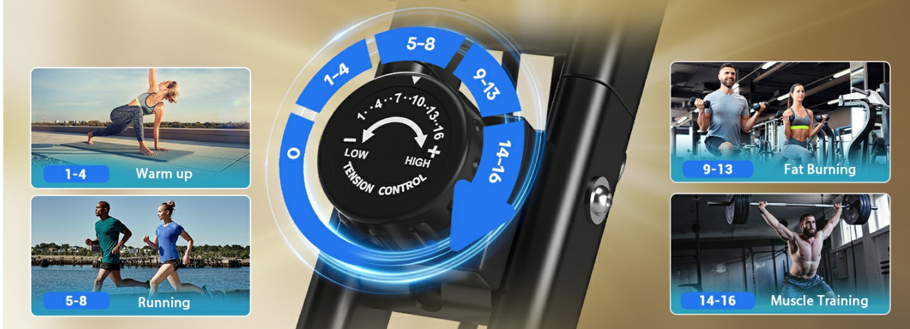
Image: Overview of the 5-in-1 exercise modes.