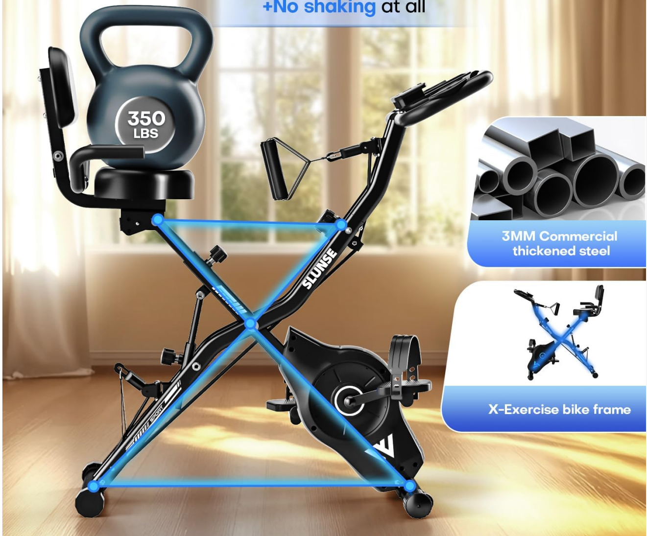
Image: Stable Dual-Triangle Frame design.

Weight capacity 350 LBS +No shaking at all