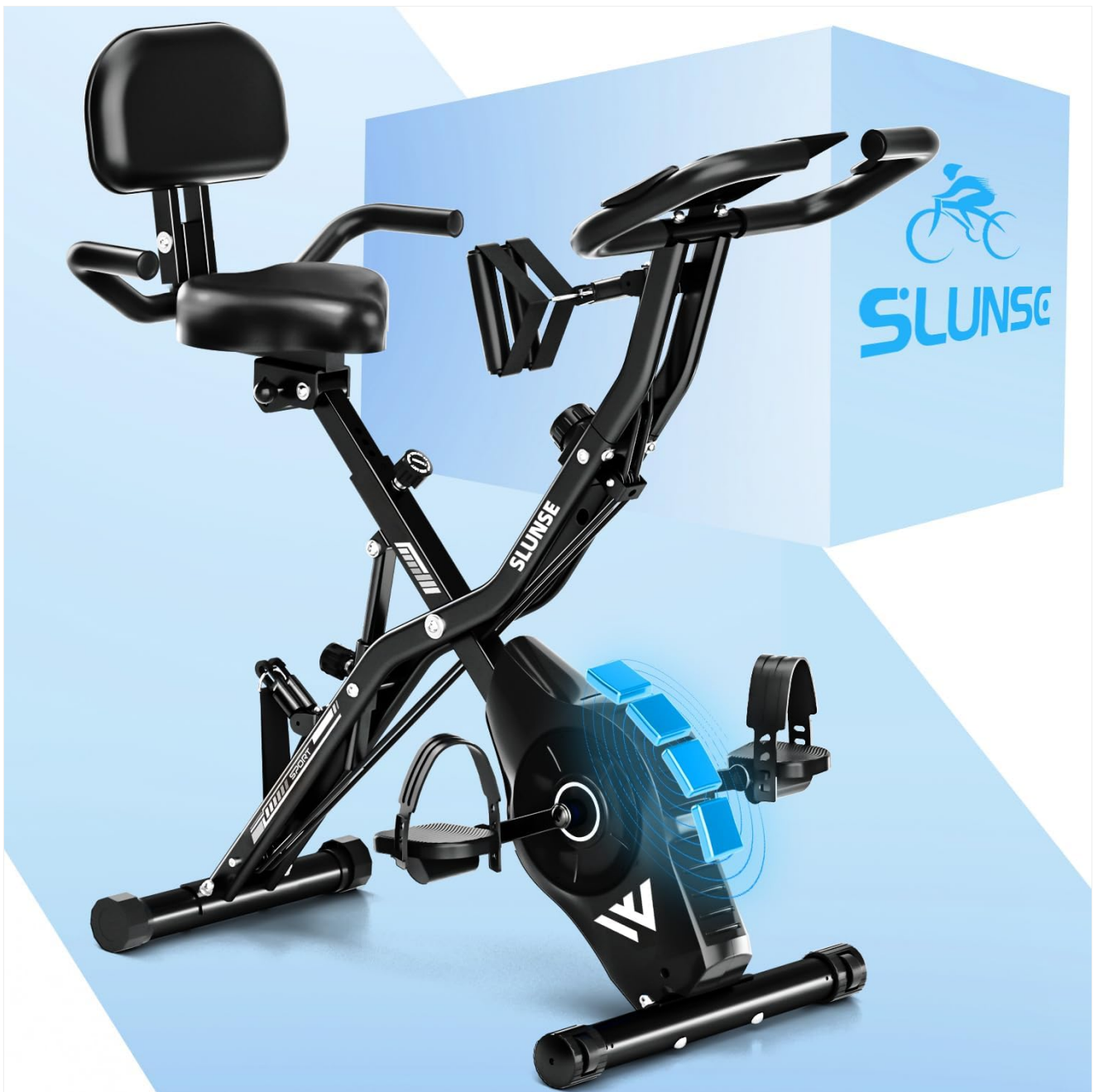
Image: SLUNSE 5-in-1 Foldable Stationary Exercise Bike.