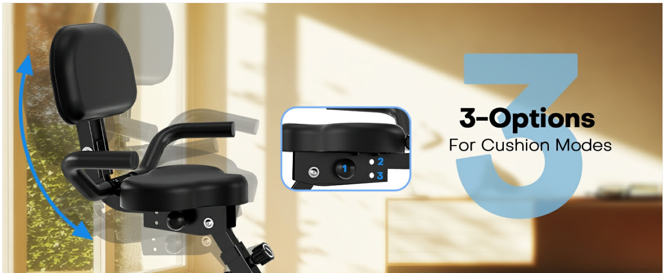
Image: Precise adjustment options for ergonomics.