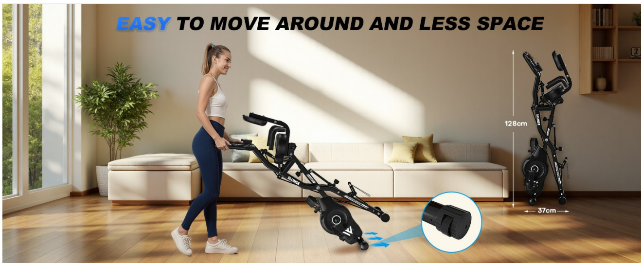
Image: Demonstrating the easy folding and transport of the exercise bike.

The bike can be fully folded to a compact size of 1.9 FT 2 for storage. Transport wheels are integrated for easy movement.