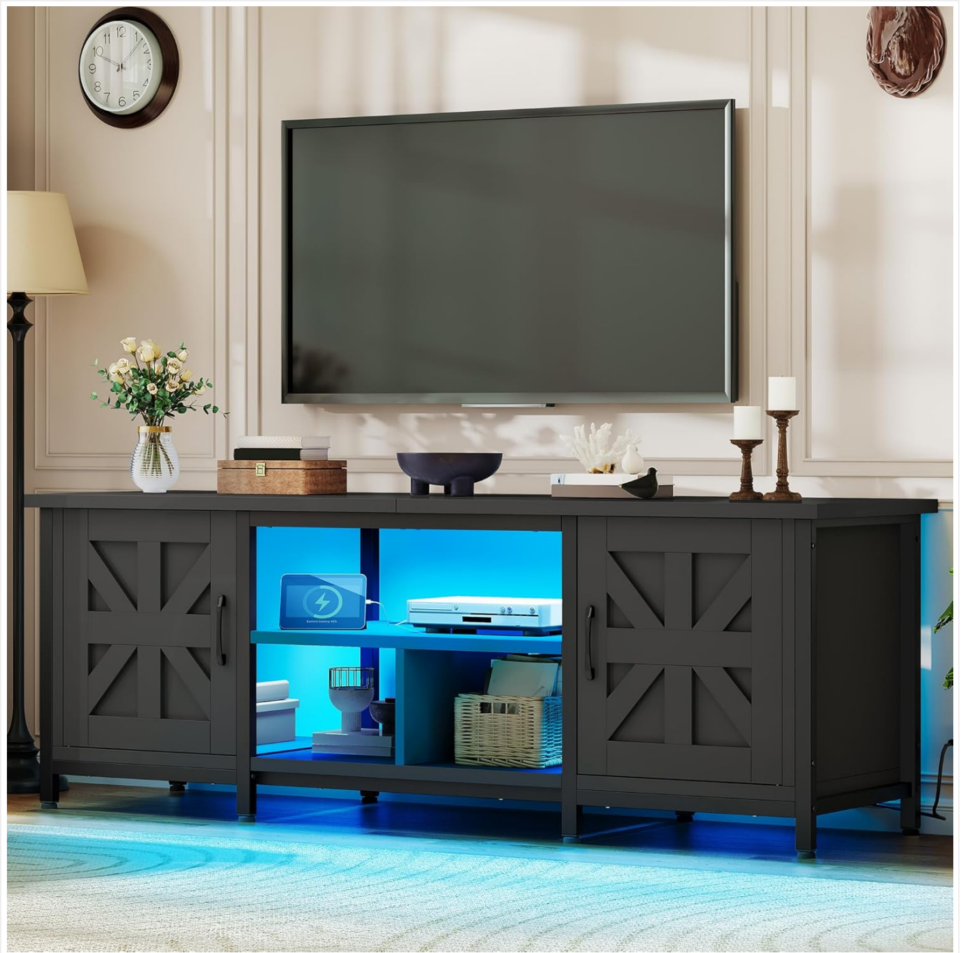
Figure 1: YITAHOME TV Stand Overview

The YITAHOME TV Stand is designed to accommodate TVs up to 70 inches, featuring a farmhouse aesthetic with cross-pattern doors, integrated LED lighting, and a convenient charging station.