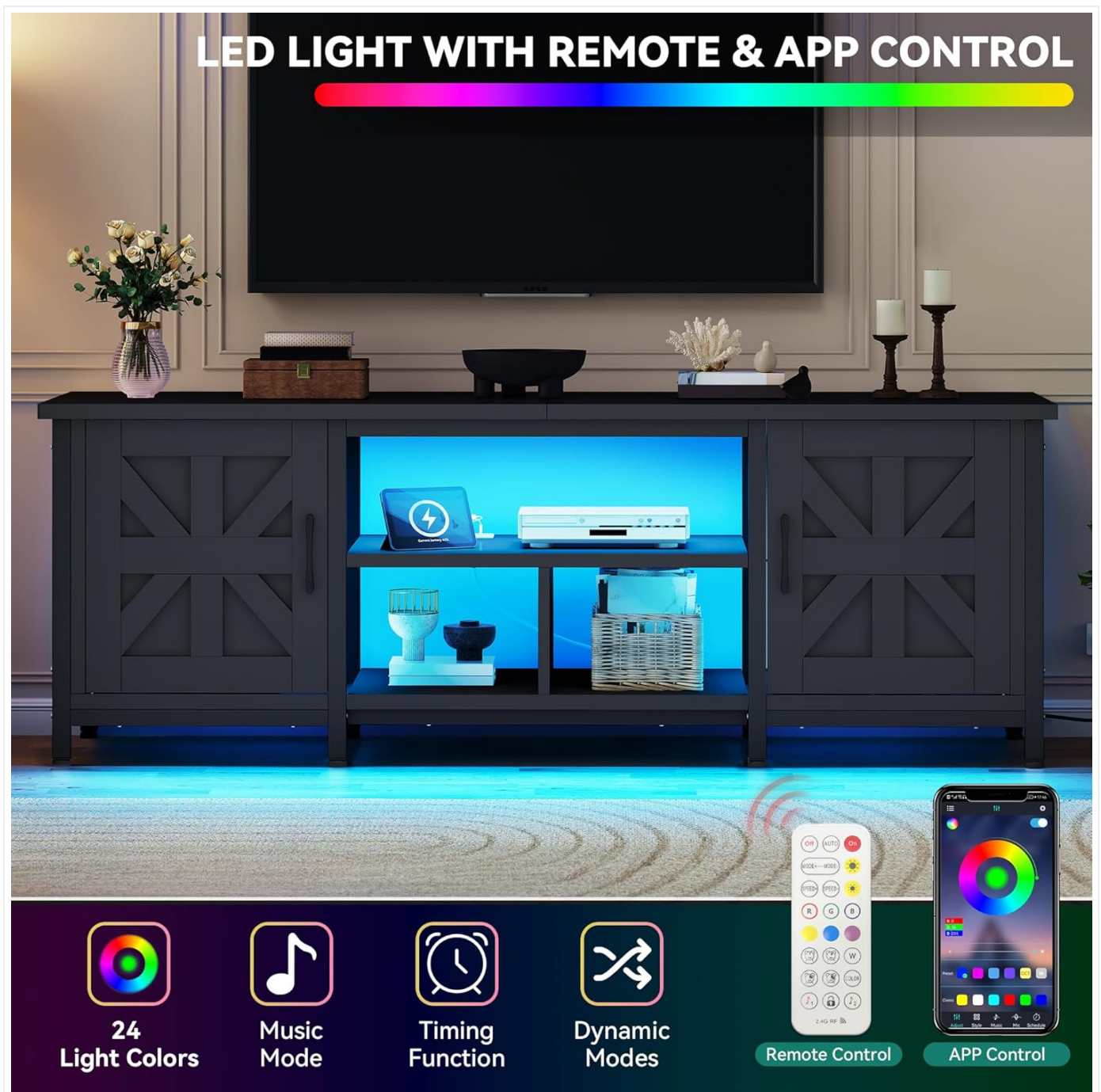
Figure 4: LED Light Control Options

The LED lighting system offers versatile control via both a physical remote and a smartphone application, allowing for dynamic color and mode adjustments.