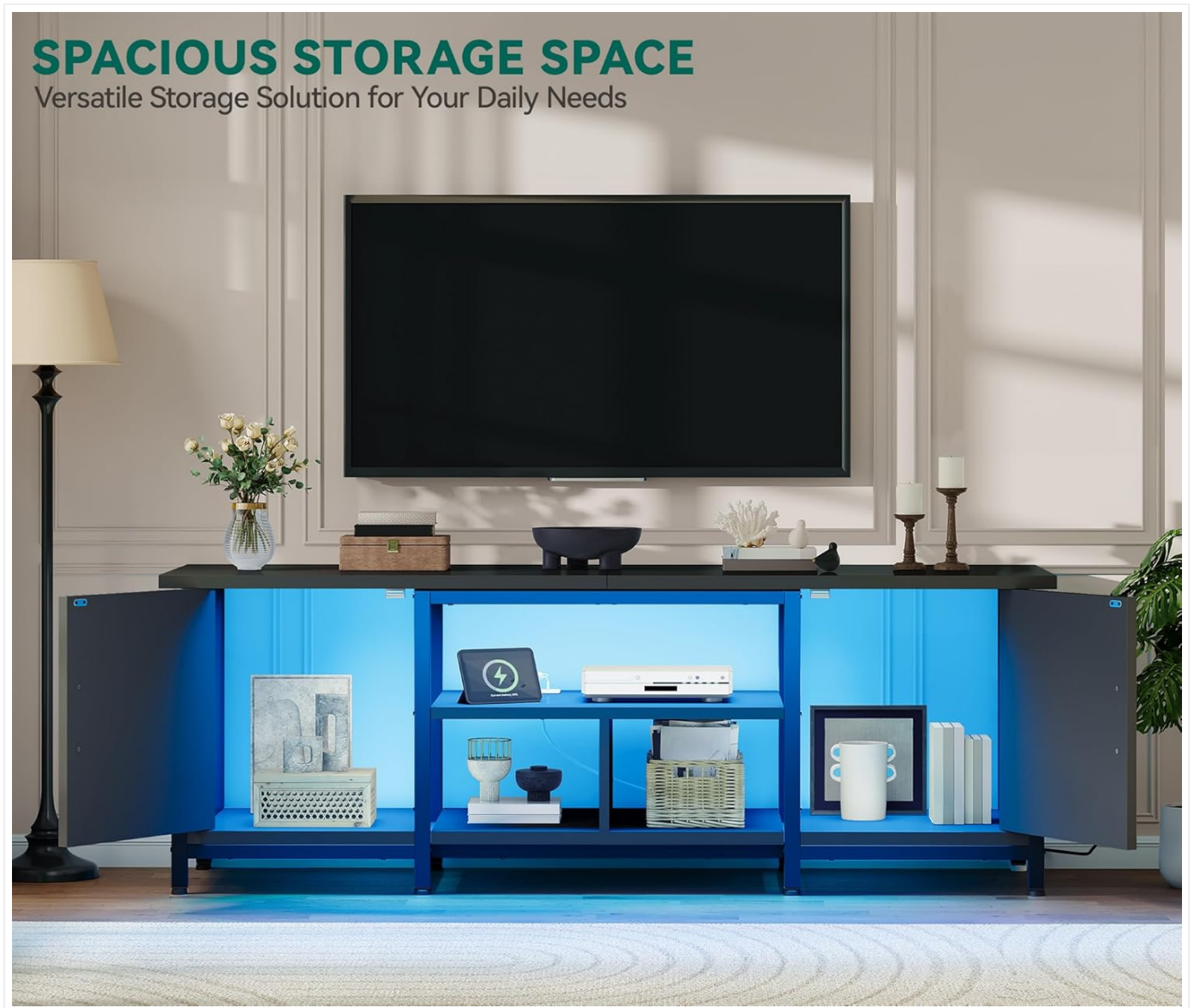
Figure 3: Spacious Storage Solution

This image highlights the integrated charging station for powering devices, the robust metal frame for durability, and the adjustable feet for stability on various floor surfaces.