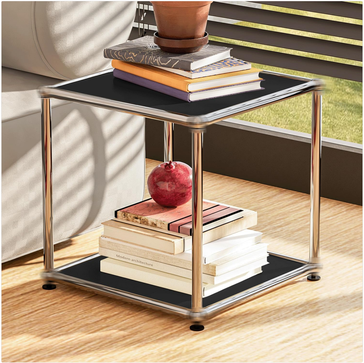
Image 3: A black ARVORA storage cabinet used as a side table in a living room, holding books and a decorative item.