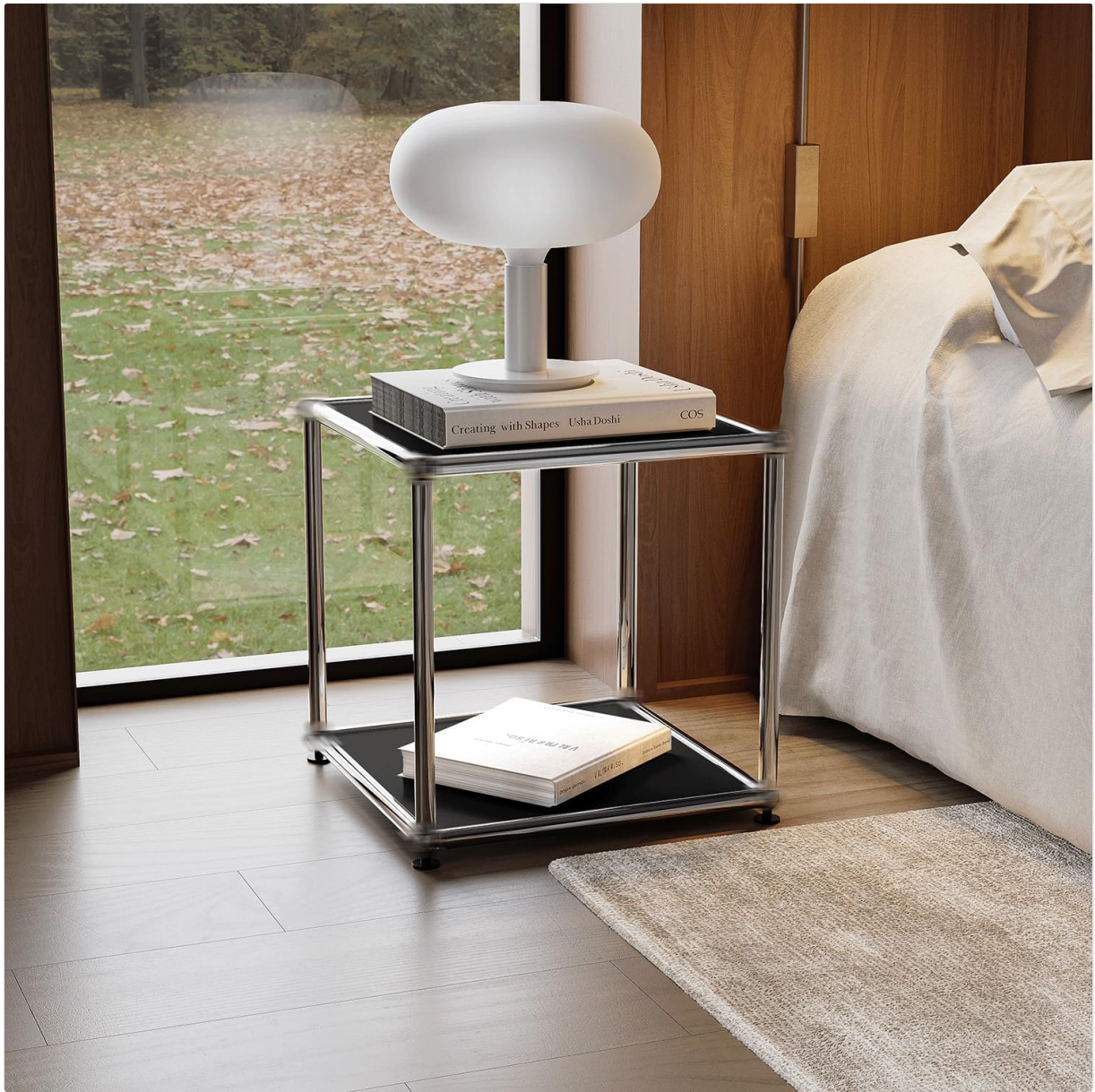
Image 4: An ARVORA storage cabinet serving as a nightstand in a bedroom, holding a lamp and books.