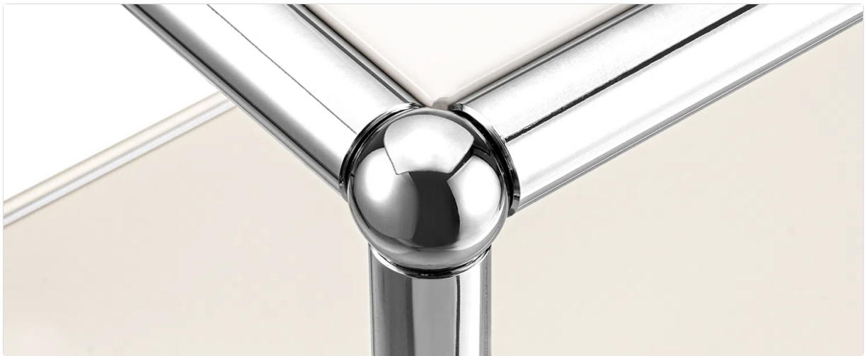
Image 2: Detail of the ball head connector, illustrating the pre-installed component for easier assembly.