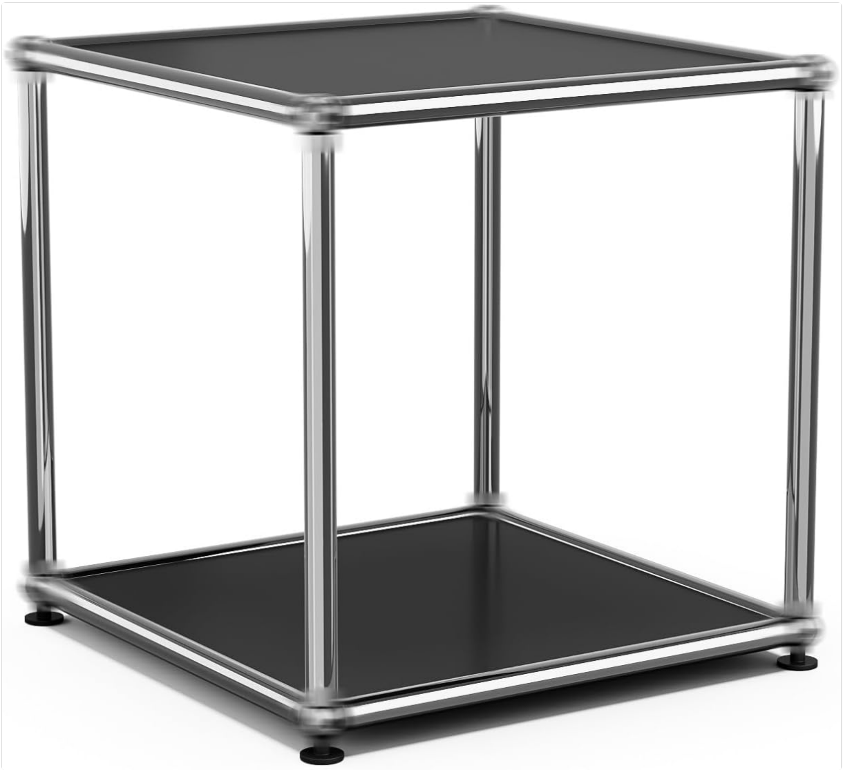
Image 1: The ARVORA Modern Storage Cabinet in black, showcasing its minimalist design and galvanized steel frame.