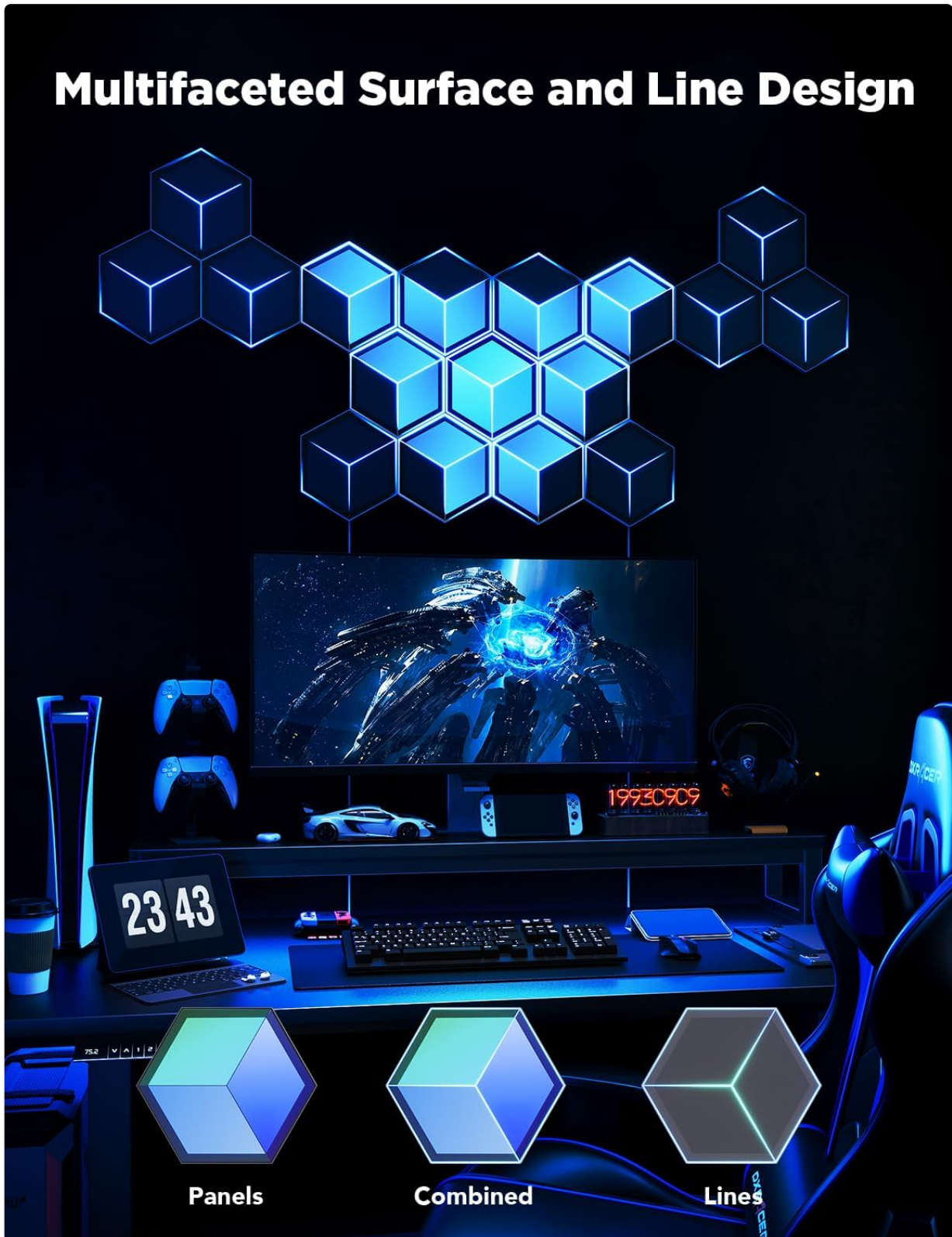
Image: The Govee Hexagon Light Panels showcasing their multifaceted surface and line design capabilities, integrated into a gaming room setup.