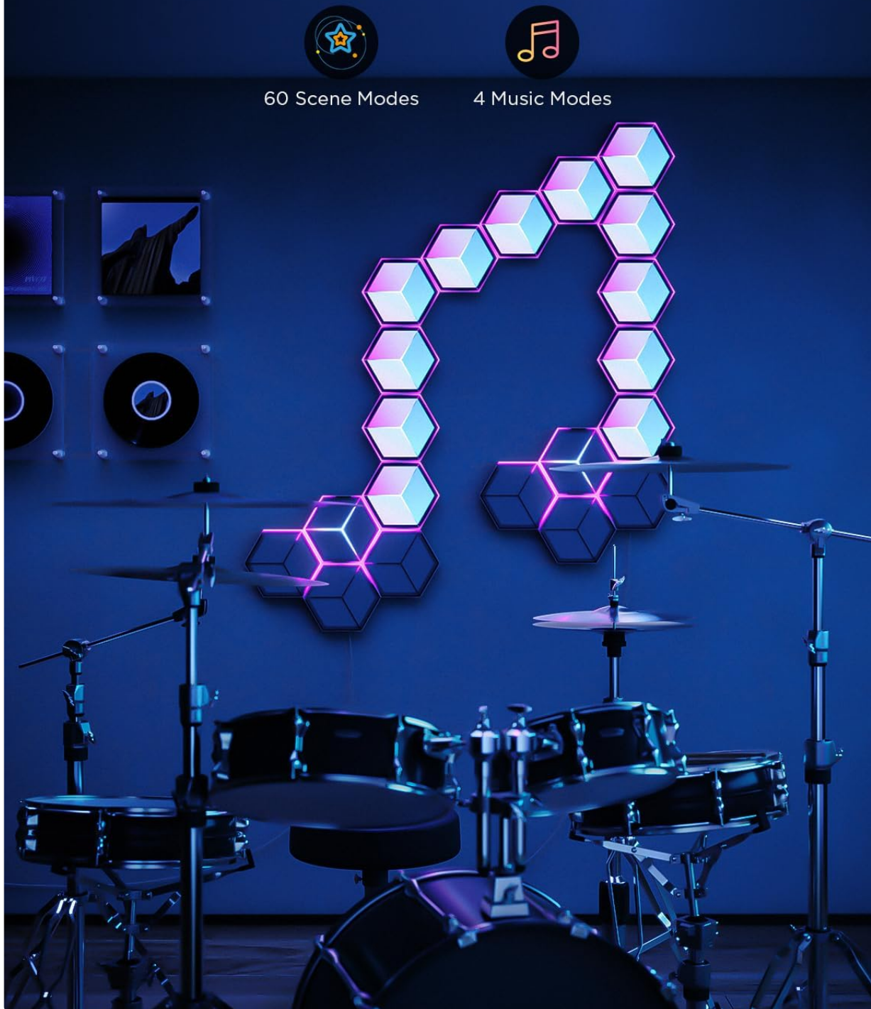
Image: Govee Hexagon Light Panels configured in a music mode, dynamically responding to sound and arranged in a musical note shape above a drum kit.