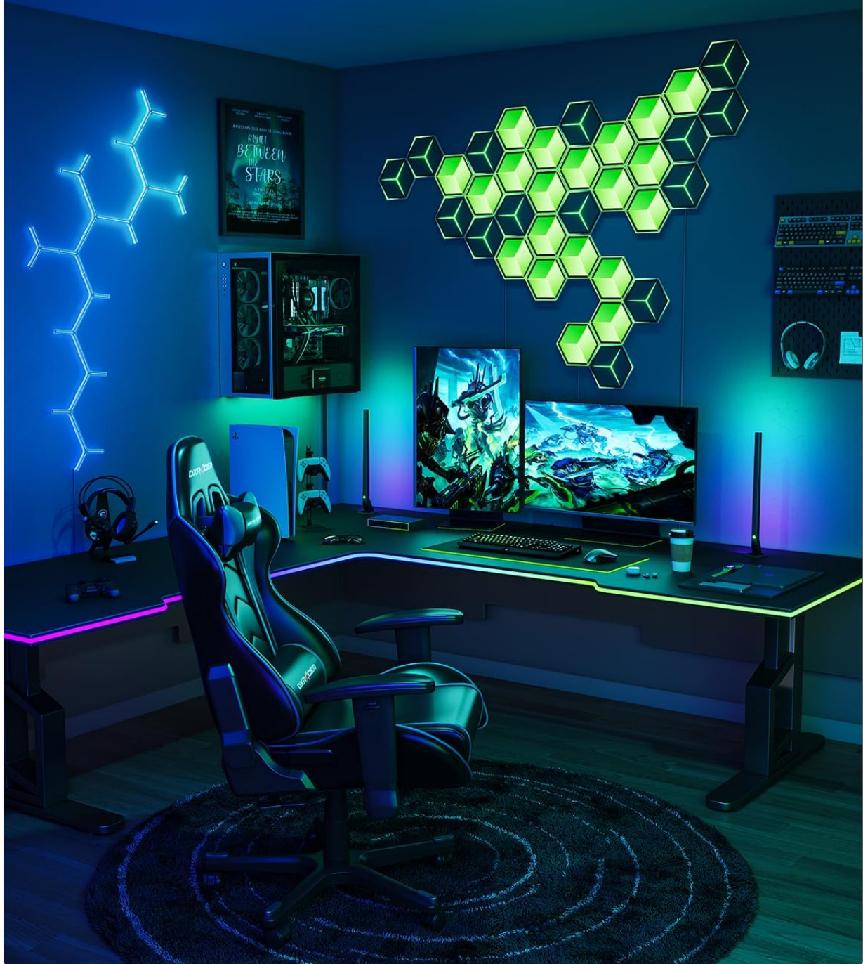
Image: A gaming room featuring Govee Hexagon Light Panels providing an upgraded and immersive lighting experience.