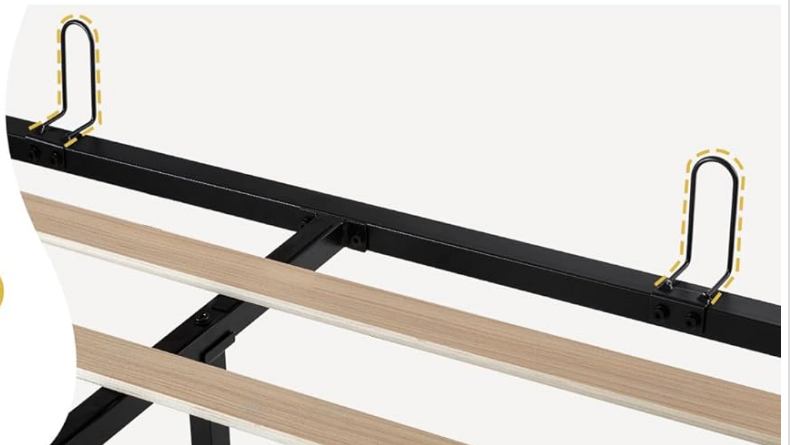
Figure 2: Hydraulic Lift System Components. This image highlights the hydraulic mechanism for easy mattress lifting, the hand strap for effortless operation, and the fixed device designed to secure the mattress platform in the open position, preventing accidental closure.