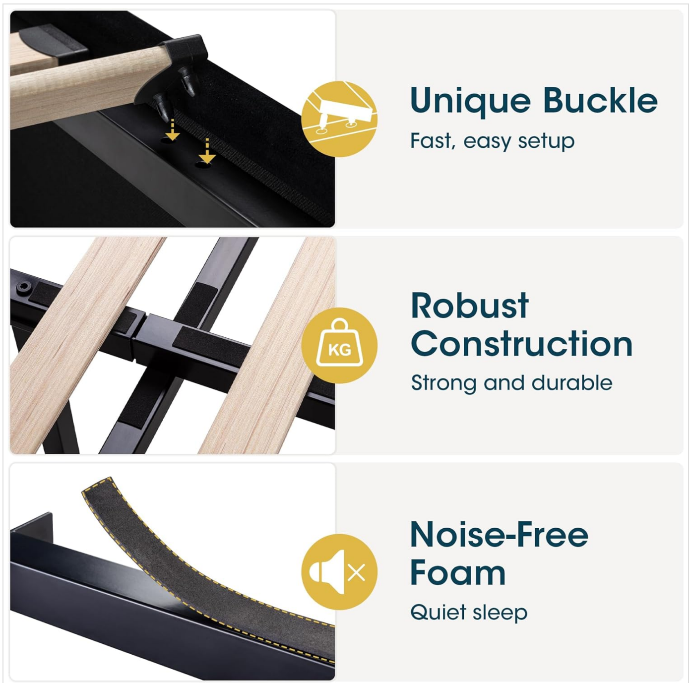
Figure 3: Slat System Features. This image details the unique buckle design for quick and easy slat setup, the robust construction of the bed frame and wooden slats for durability, and the noise-free foam applied to prevent squeaks and ensure quiet sleep.