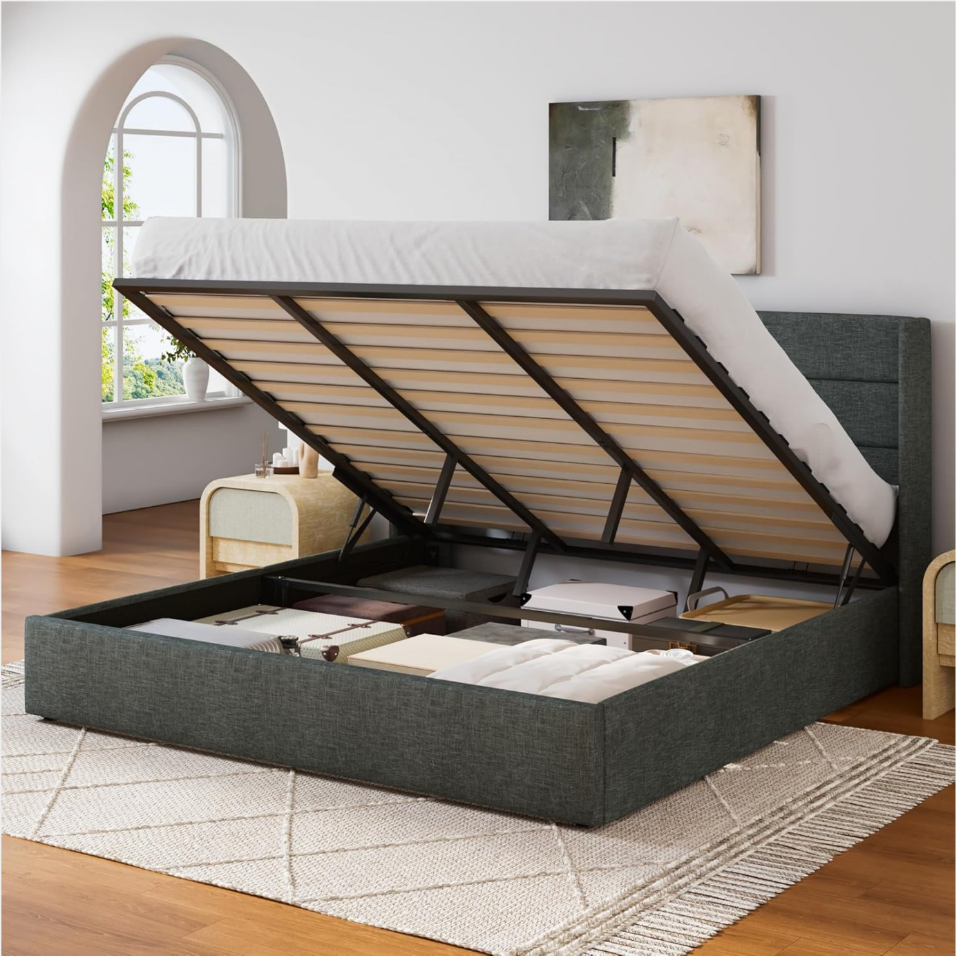
Image: The WEEWAY King Size Lift Up Storage Bed shown with the mattress lifted, exposing the ample storage space beneath the platform. Various items are neatly stored within the bed frame.