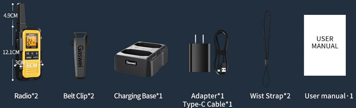
Labeled diagram of the Gaswei G2Pro+ Walkie Talkie components.