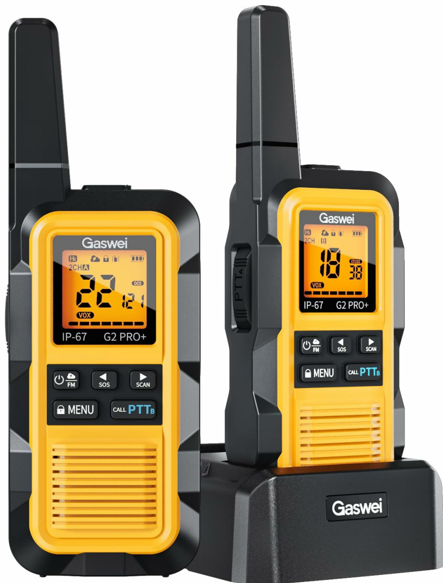
Front view of the Gaswei G2Pro+ Walkie Talkie.