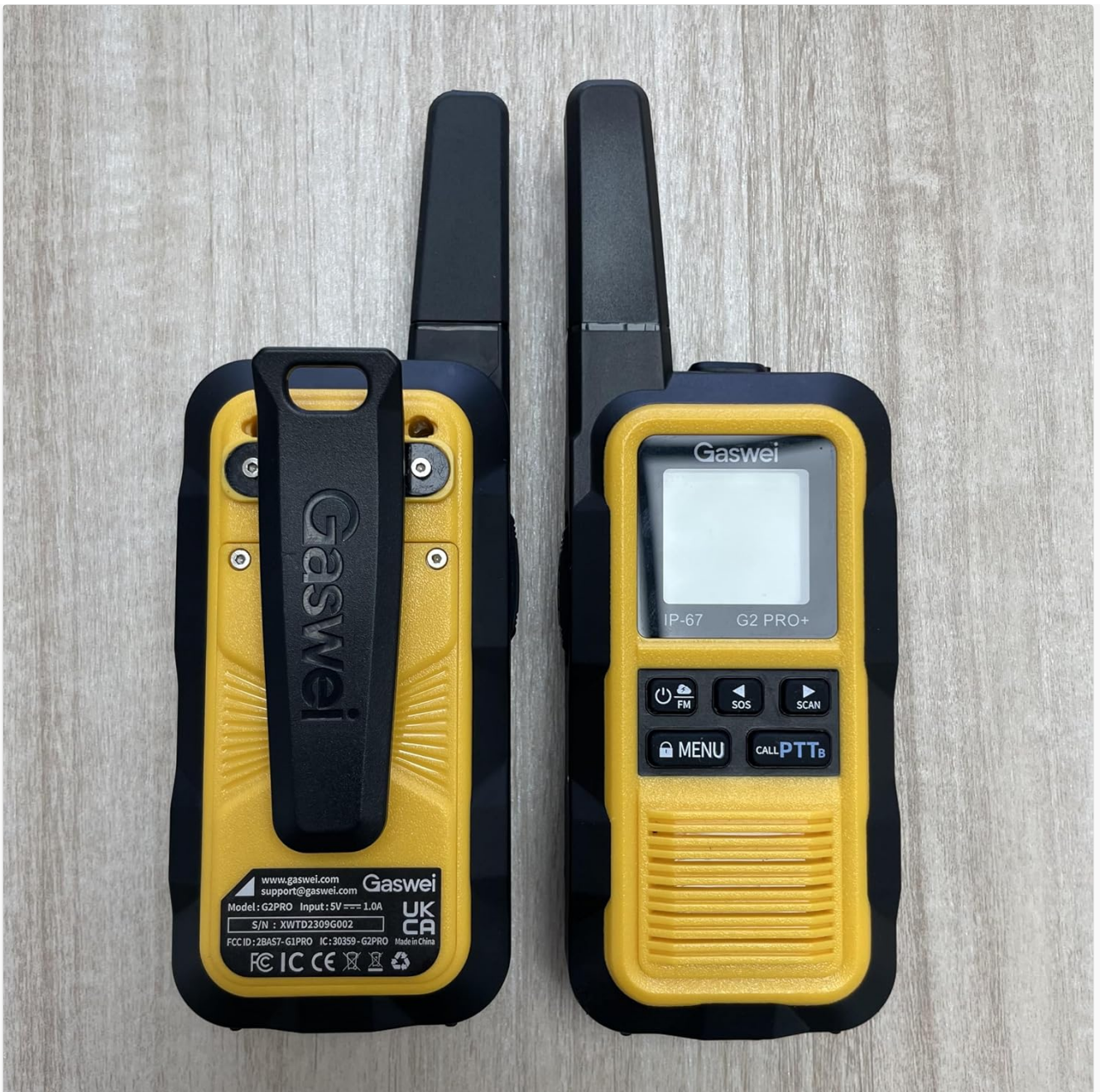
Rear view of the walkie talkie with belt clip attached.